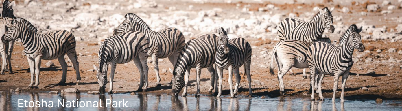
Etosha National Park