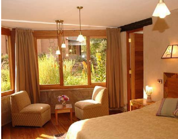
Luxury Single, 3 Rooms $300 Offered with either two queen beds or a single king for the solo traveler.