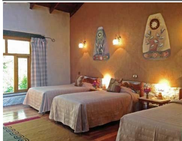
Garden Triple, 4 Rooms $425 Three twin beds in a spacious room provides a comfortable retreat option.