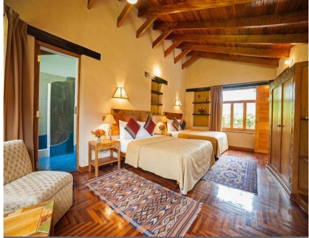
Luxury Twin, 7 Rooms $375 A top pick for friends to share a spacious tranquil room with two queen beds.