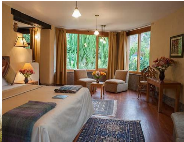
Luxury King, 5 Rooms $375 Spacious room for a couple, with one king bed-- a perfect choice for a special occasion.