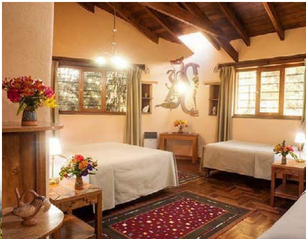
Luxury Triple, 2 Rooms $450 A combination of 3 beds allow families and friends to share in Andean luxury.