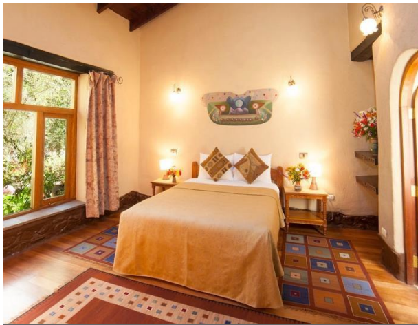
Garden Single, 7 Rooms $250 Ideal for the solo traveler with a double bed or queen bed.

INCLUSIVE ROOM RATES: include fresh herbal teas and two delicious vegetarian meals: buffet breakfast and 3-course dinner. Guests are also invited to use the available sacred spaces of WillkaT'ika, described in "Facilities" below. 10% service charge not included in room rates.