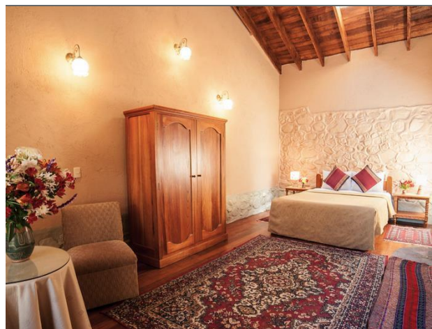
Garden Matrimonial, 4 Rooms $325 Lovely room with one queen bed accommodating one couple.