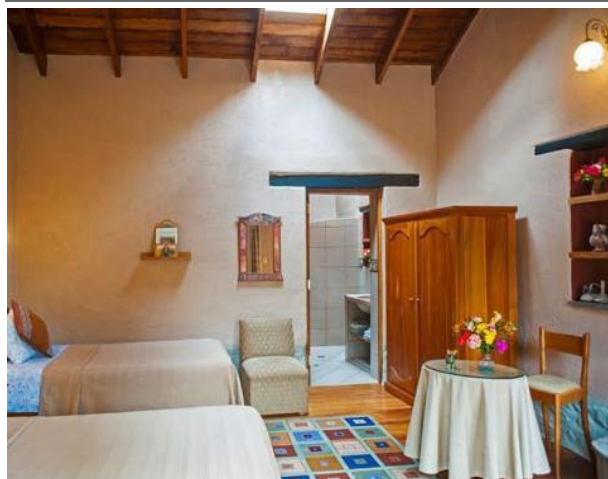
Garden Twin, 3 Rooms $325 Two twin beds accommodating two friends or family members.