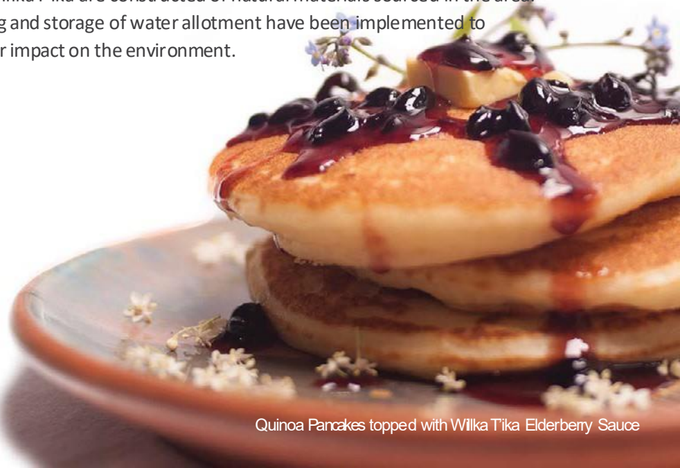
Quinoa Pancakes topped with Willka T'ika Elderberry Sauce

Willka T'ika is a holistic haven in the Andes. The handsome adobe-style buildings that grace Willka T'ika are constructed of natural materials sourced in the area. Solar heating and storage of water allotment have been implemented to minimize our impact on the environment.