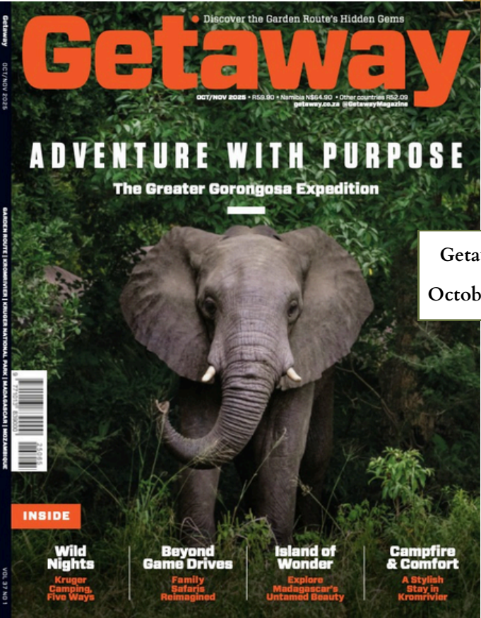
Getaway South Africa Cover Story October/November 2025