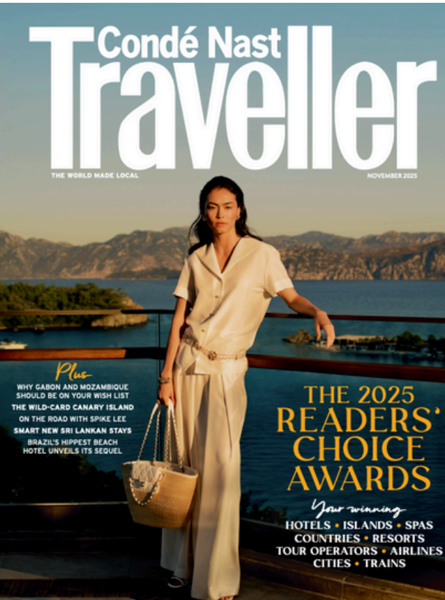
Condé Nast Traveller November 2025

A selection of press coverage from 2025 on Gorongosa National Park and Gorongosa Safaris. More to be added as it goes live.