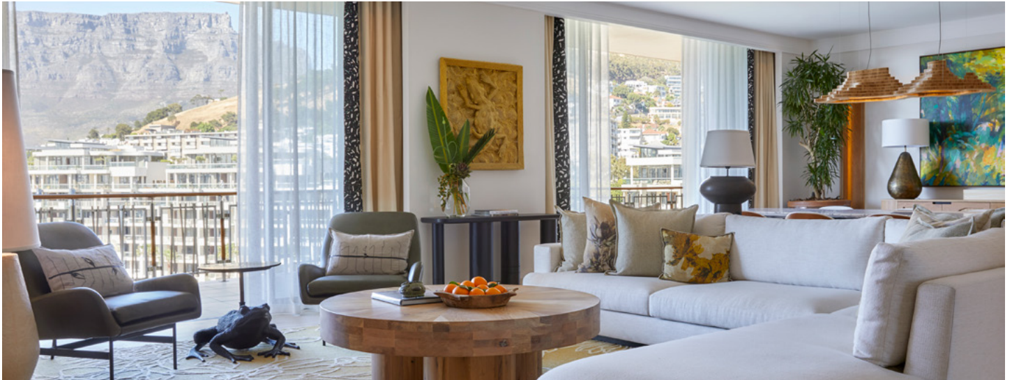
TABLE MOUNTAIN SUITE

Dramatic African artwork accentuates the foyer, large entertainment area and dining room in the one bedroom 316m 2 /3,401ft 2 Table Mountain Suite, located in the crescent-shaped Marina Rise. The suite also features an executive office, dedicated Guest Host, a personal gym and a magnificent terrace ensuring the perfect view, after which this suite takes its prided name. Guests are able to host private dinners or business meetings at the large, 10-seater dining room table as One&Only Cape Town's chefs* prepare gourmet meals in the fully-equipped kitchen. With only one bedroom, the suite still has a luxurious and spacious ambiance and includes an oversized bath, rain shower, private water closet and dual marble vanity. It can be transformed into a family-friendly two-bedroom suite by utilising an inter-leading Premier Marina Table Mountain Room featuring two queen beds. *A private chef can be pre-arranged at an additional charge.