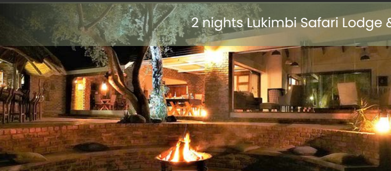
2 nights Lukimbi Safari Lodge & 2 nights Idube Game Reserve

(Please confirm rates with our head office before giving a quote as all rates are subject to change)