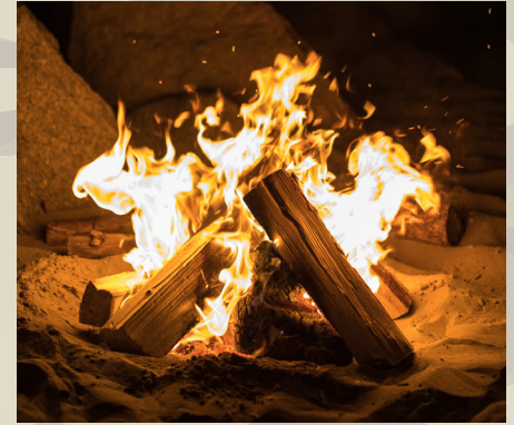
After Dinner with your folks

Once you settle into your suite, you will receive your guide pack which contains a Treasure Map of all the goodies you need to find for the next few days. You will then be wished away for the famous Treasure Hunt, in search of all the treasures for your pack. There is so much to discover around this massive Peter-Pan style treehouse.