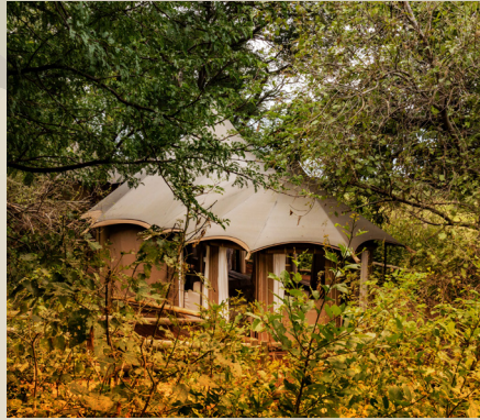
Arrival at Nambwa Tented Lodge

The Late afternoon's sun rays will reflect off the water's edge, the soothing sound of the water as it is gently broken by the bow of the boat cutting through the water's surface as you and your family are transferred to your home for the next 3 nights.