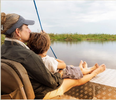
Boat Cruise to Nambwa Tented Lodge