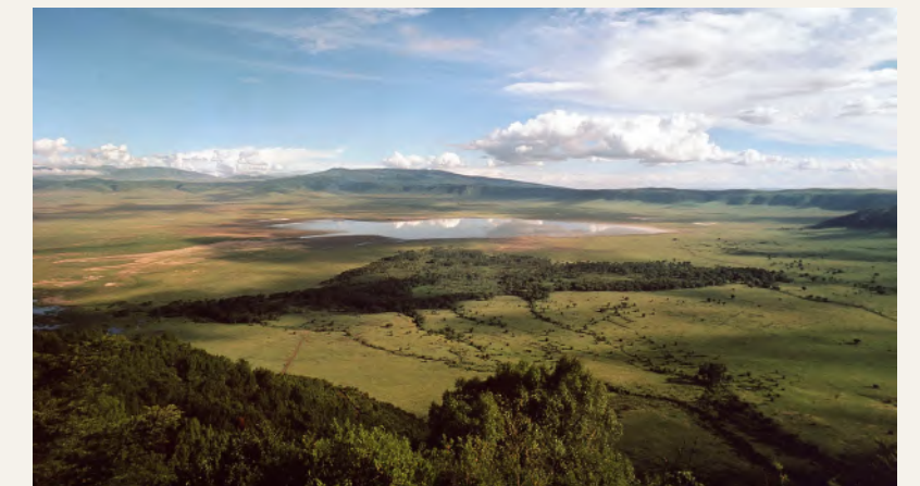
The landscape is verdant during this season