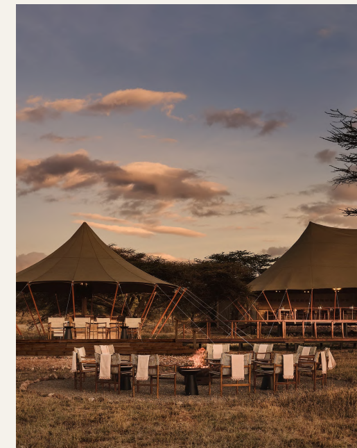
The fire beckons as night falls

Sundowners overlooking nature while guests warm themselves by the fire pit.