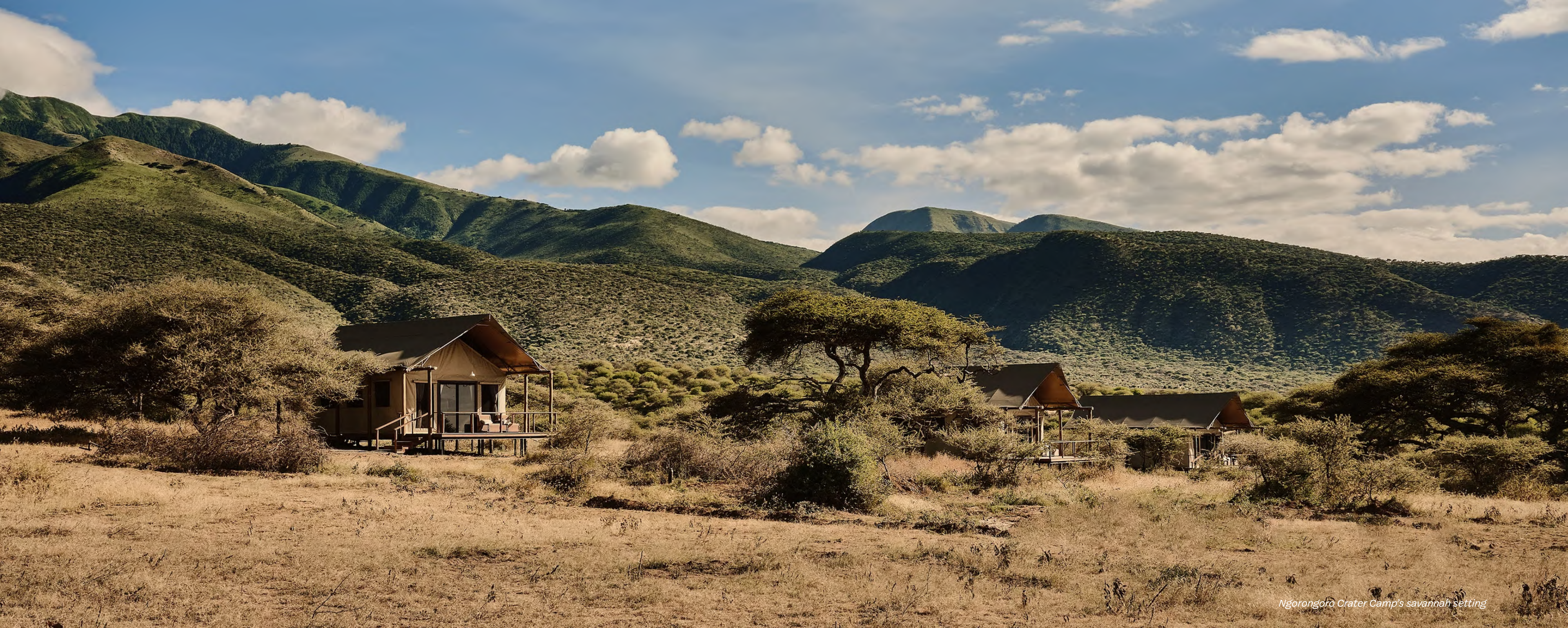
Ngorongoro Crater Camp's savannah setting