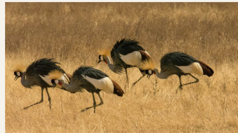
The area is home to 500 bird species