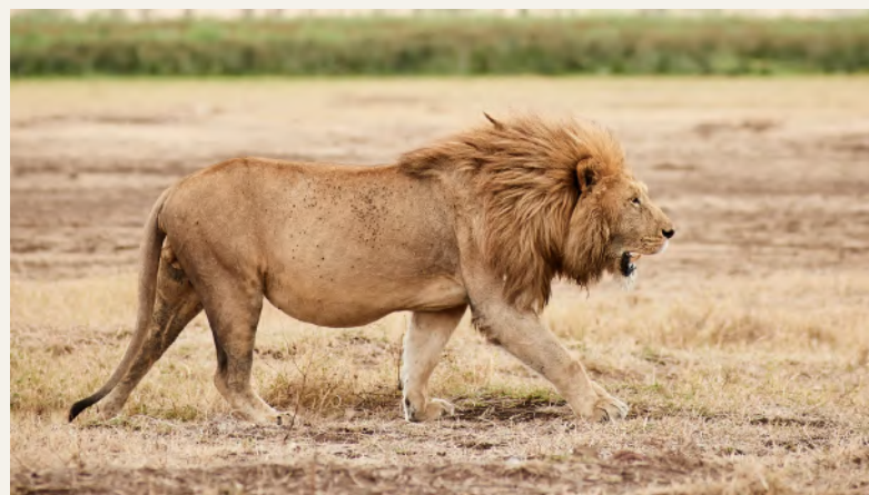
A lion on the prowl

There is a 500-species-strong population of birdlife too – from kori bustards (one of the world's heaviest flying birds) on the plains to African paradise flycatchers calling noisily in the woodlands. Only giraffe and antelope are missing from the scene – the surrounding cliffs perhaps proving too steep for such long-limbed creatures.