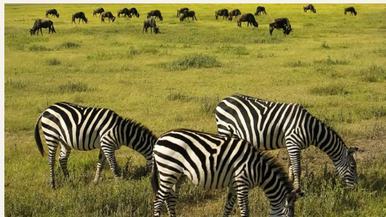
Zebra graze in the grasslands

While it's impossible to predict the weather, guests might find it helpful to learn how a visit to Ngorongoro Crater Camp might differ from one month to the next: from the secret perks of the rainy season to the best time to spot the Big Five – perhaps all in one day.