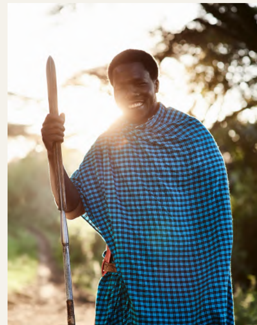
This is the home of the Maasai people

Encounters with local Maasai and the chance to take part in cultural activities.