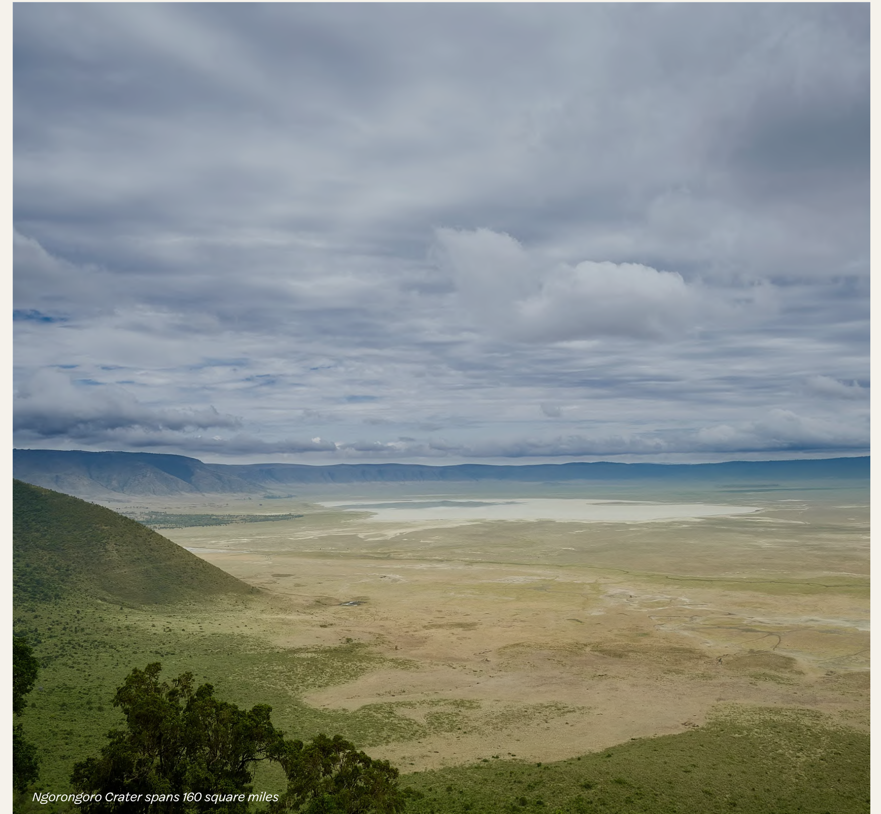
Ngorongoro Crater spans 160 square miles