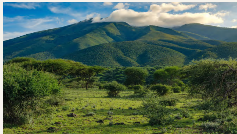
The camp is near the rim of the caldera

The world's largest inactive, intact, unfilled caldera was formed about three million years ago when a volcano erupted so violently that it collapsed upon itself. It's now a UNESCO World Heritage Site, and its 160 square miles throb with life. Between 25,000 and 30,000 animals, including all of the Big Five, roam the crater floor, creating a self-contained ecosystem that is hugely significant for wildlife conservation. Set on edge the forested rim of the caldera, Ngorongoro Crater Camp is unrivalled as a base from which to explore it all.