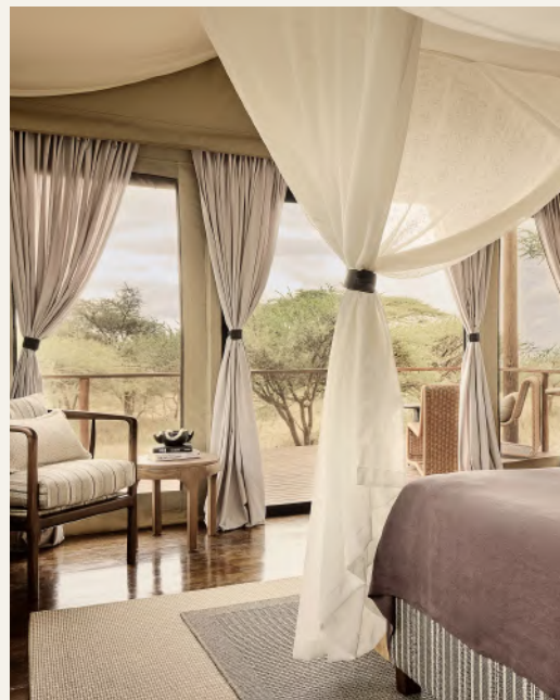
Enjoy the views from your private deck

The intimate, minimalist design features 10 tented suites, each with private decks.