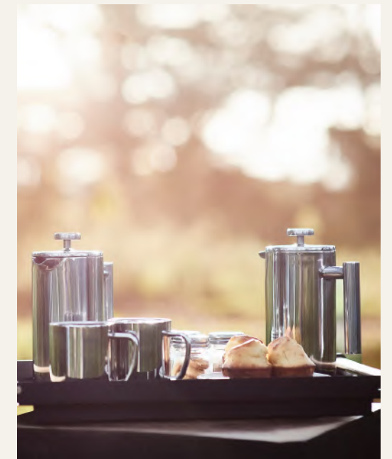
A wake-up call with morning coffee

Memorable picnics in the bush on thrilling full-day game drives.