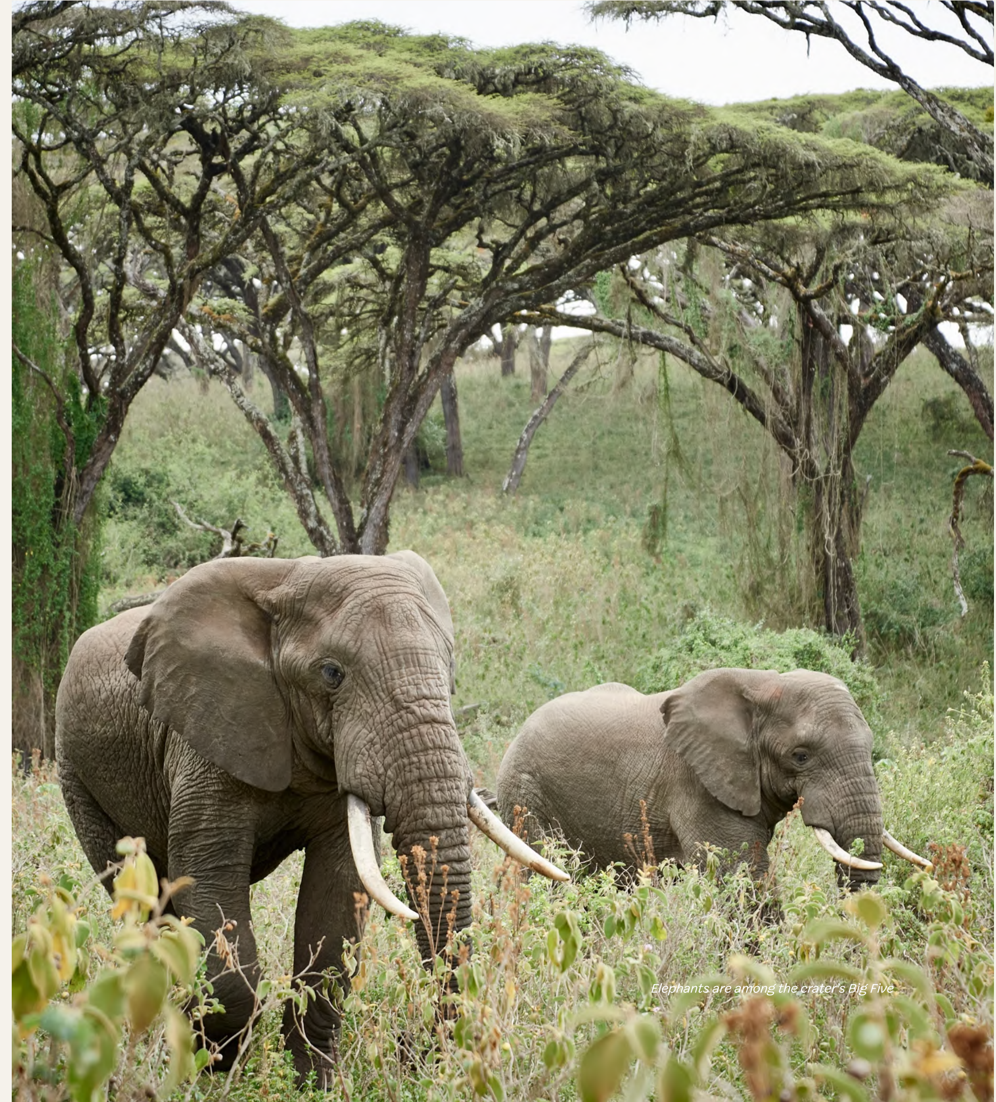
Elephants are among the crater's Big Five