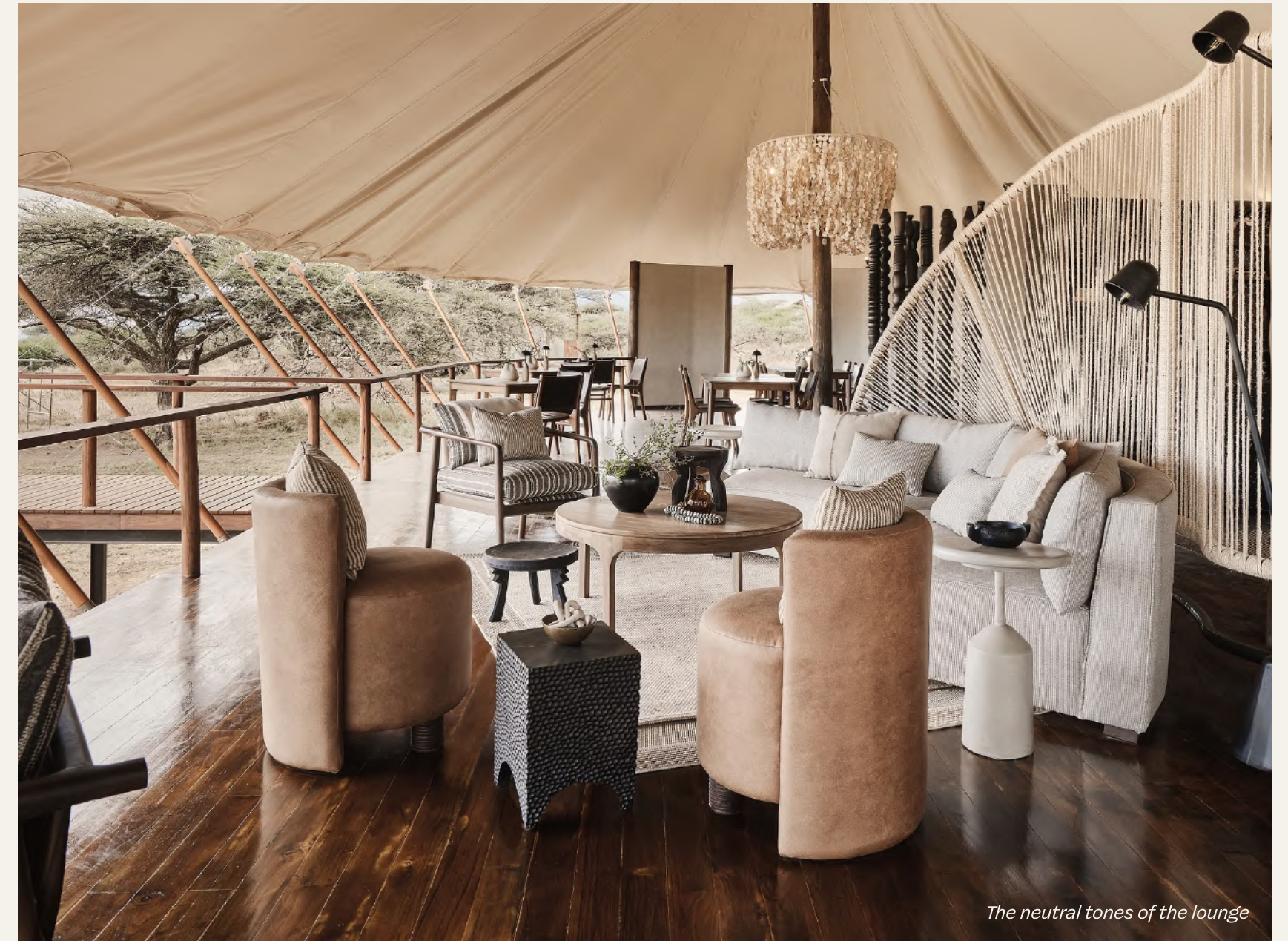
The neutral tones of the lounge

The light-touch design of Ngorongoro Crater Camp incorporates a water treatment system and electricity generated by solar power.