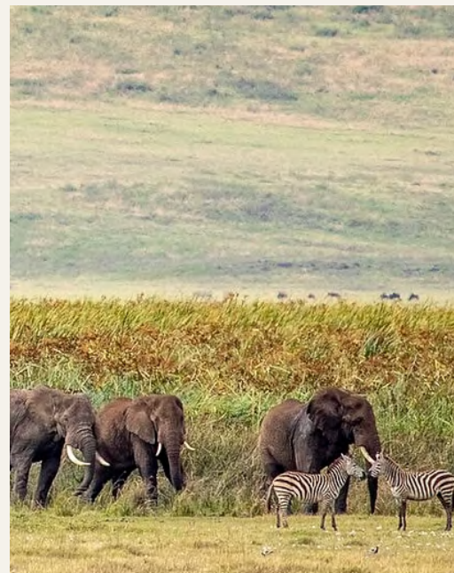
The crater is rich with wildlife

The unique topography of Ngorongoro Crater, abundant with zebras, lions, rhinos, cheetahs, elephants, hippos, warthogs and even the elusive leopard.