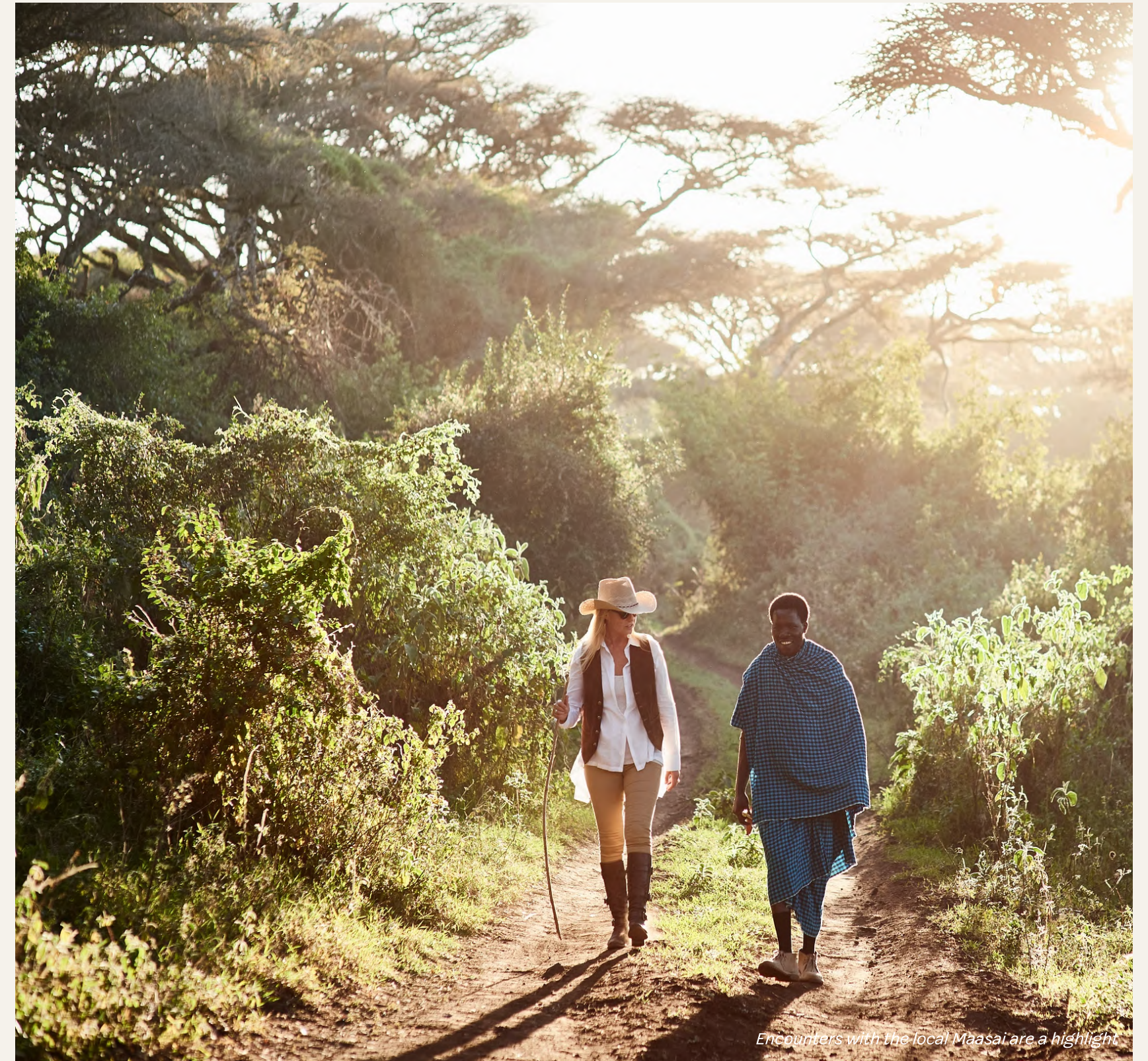
Encounters with the local Maasai are a highlight.