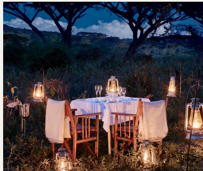
Dine at a linen-clad table in the bush The setting is natural inspiration