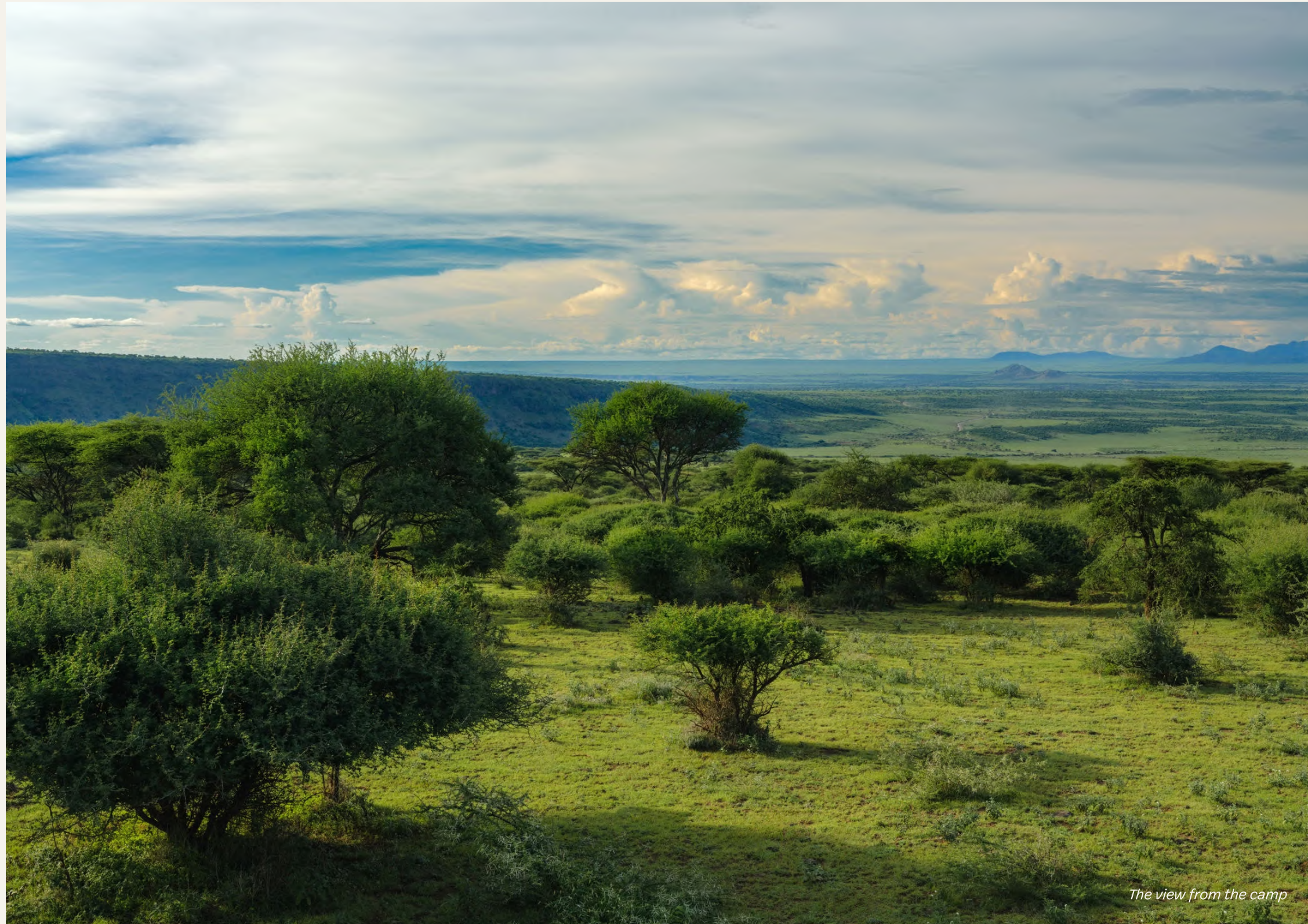
The view from the camp

Days at Ngorongoro Crater Camp deliver pulse-quickening adventure as well as serene moments to simply soak up the incredible nature all around. The camp's expert team of guides and support staff cleverly choreograph every detail – from action-packed morning game drives to delicious feasts around a campfire in the bush.