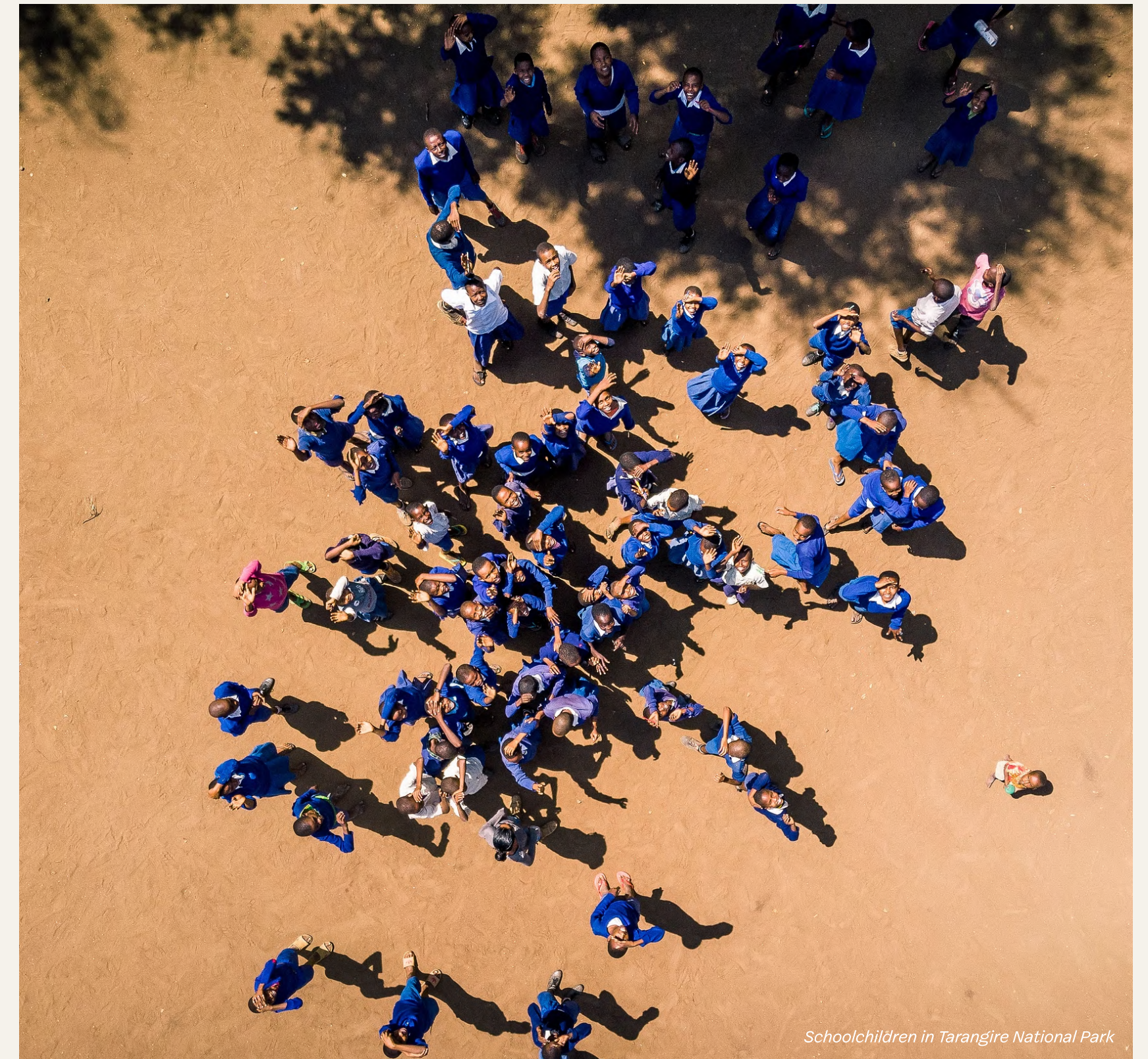
Schoolchildren in Tarangire National Park

AKP partnered with Kafika House to provide disabled children in Tanzania with a holistic, transformative healthcare facility. Kafika House affords a safe and loving home for children receiving pre- and post-operative care and rehabilitation for surgically correctable disabilities such as cleft lip and palate, clubfoot, skeletal fluorosis, burn scar contractures, masses and osteomyelitis. Children spend an average of three months at Kafika House, all the while learning, playing and receiving the care they need.