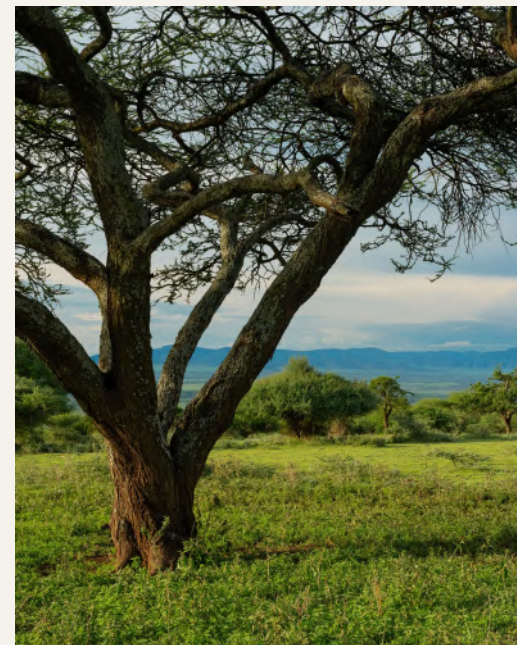
View from the main area

Extraordinary setting with wide savanna views – and herds of giraffes regularly roaming past.