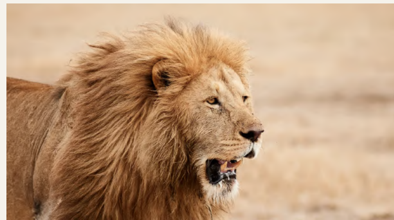
Lions thrive in the Ngorongoro Crater

Exploring the perfectly contained, wildlife-rich Ngorongoro Crater feels like stumbling upon some lost prehistoric world. Ngorongoro Crater Camp occupies an idyllic position near the edge of this, the largest inactive volcanic caldera on earth. Twice-daily game drives – or full-day excursions – offer the possibility of spotting elephants, hippos, buffaloes, lions, leopards, cheetahs, impalas, zebras, wild dogs, jackals and hyenas, plus a multitude of birdlife. A hike around the edges of the crater, to gaze down its 2,000ft sheer drop and watch the animals roaming below, is highly recommended too. Visiting the local Maasai community is a hugely enriching experience, when guests learn about the unique culture of one of Tanzania's most iconic ethnic groups.