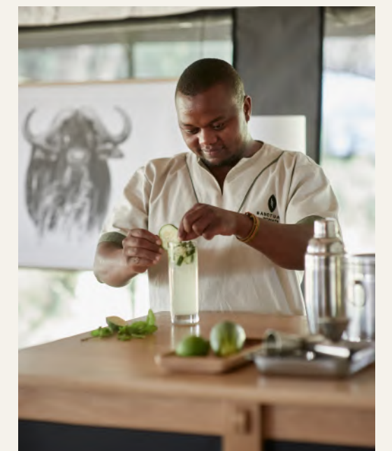
Order a cocktail at the well-stocked bar