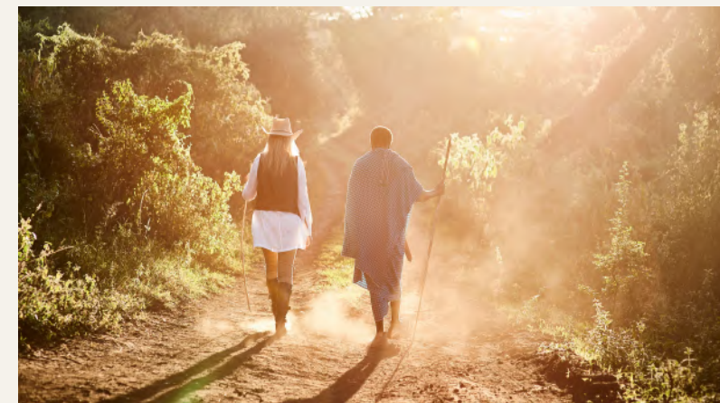
Guests learn about the Maasai way of life

Drives in the early morning and late afternoon in a closed 4x4 take guests into the thick of this unique and extraordinarily biodiverse habitat – either on the Ndotu Plains or down on the Ngorongoro Crater's floor (best experienced on a day-long drive).