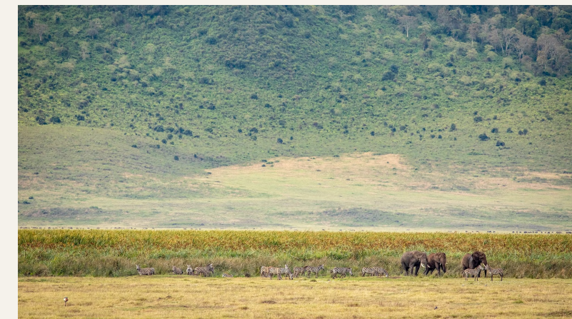
An epic scene in the Ngorongoro Crater