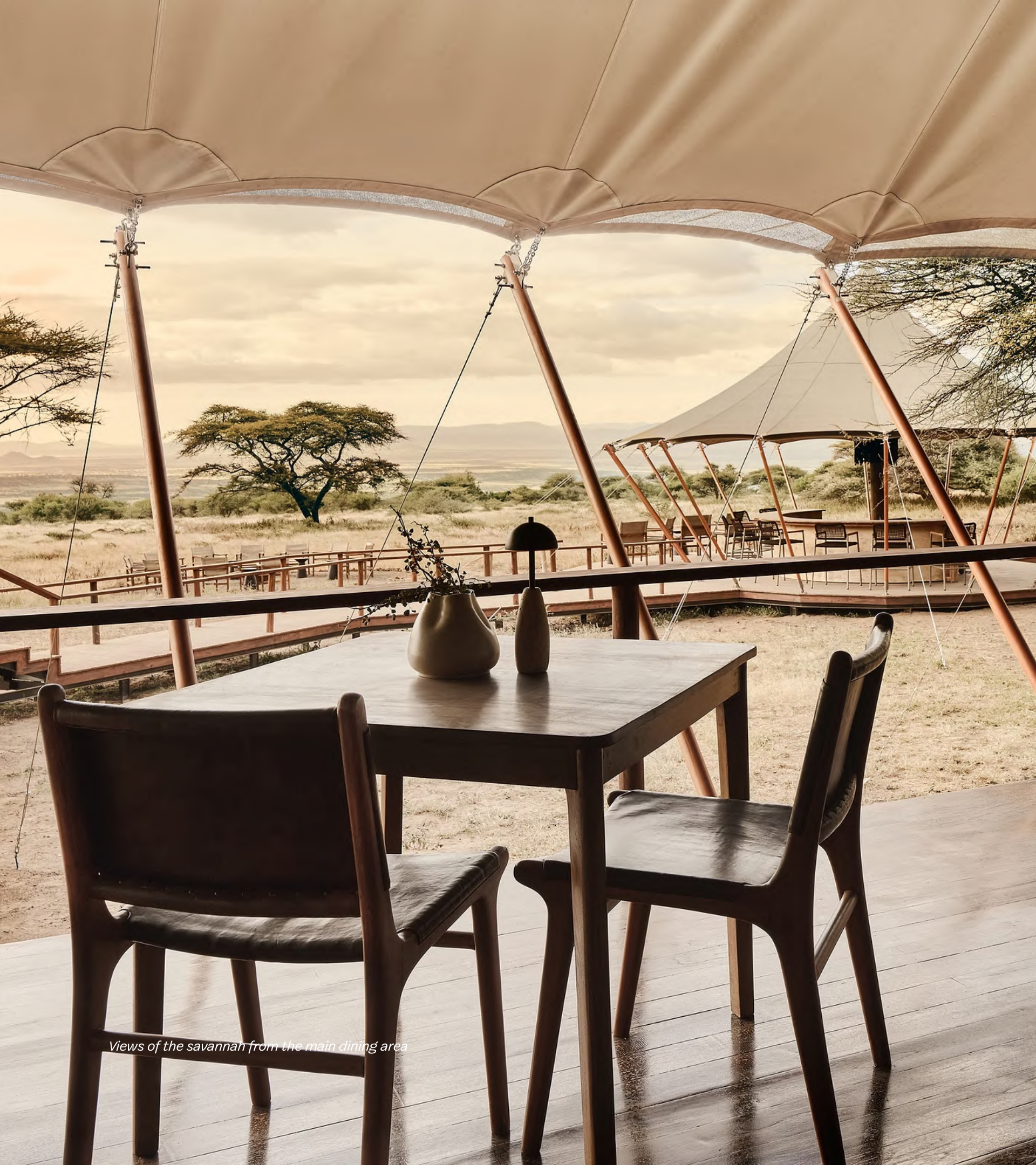
Views of the savannah from the main dining area