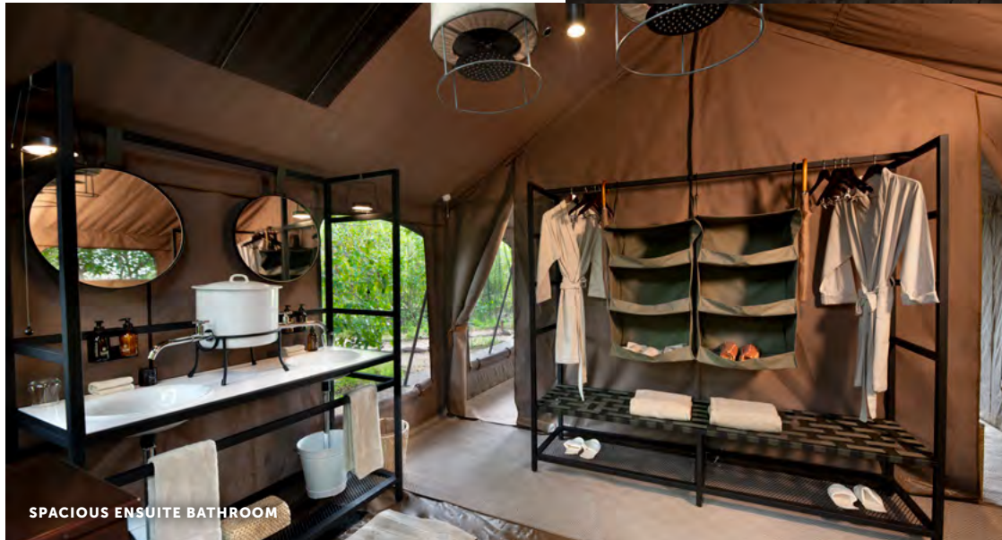
SPACIOUS ENSUITE BATHROOM