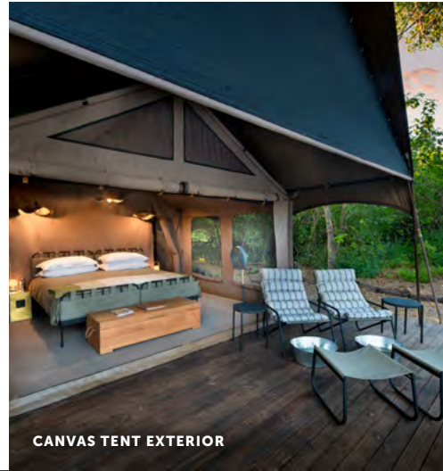
CANVAS TENT EXTERIOR

Set beside a seasonal floodplain in the heart of the Okavango Delta, Nxabega Under Canvas offers an intimate and exclusive safari experience with just three tents. Designed for tranquillity and immersion, the camp invites guests to slow down, unwind, and savour the rare serenity of the wilderness.