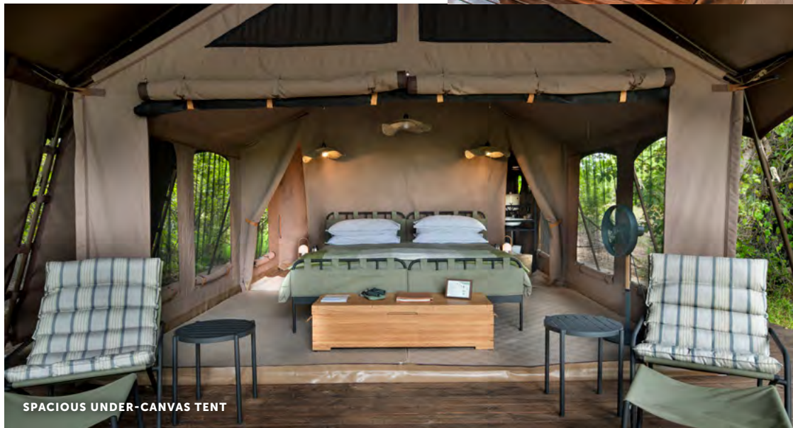
SPACIOUS UNDER-CANVAS TENT