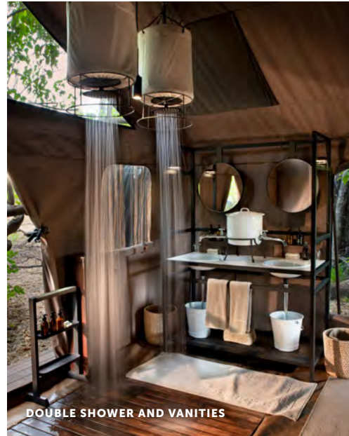
DOUBLE SHOWER AND VANITIES

With only three spacious canvas tents, Sandibe Under Canvas offers an experience that is both exclusive and immersive. Each tent includes an ensuite bathroom with a flushing toilet and a steaming hot shower, providing comfort without detracting from the wilderness experience.