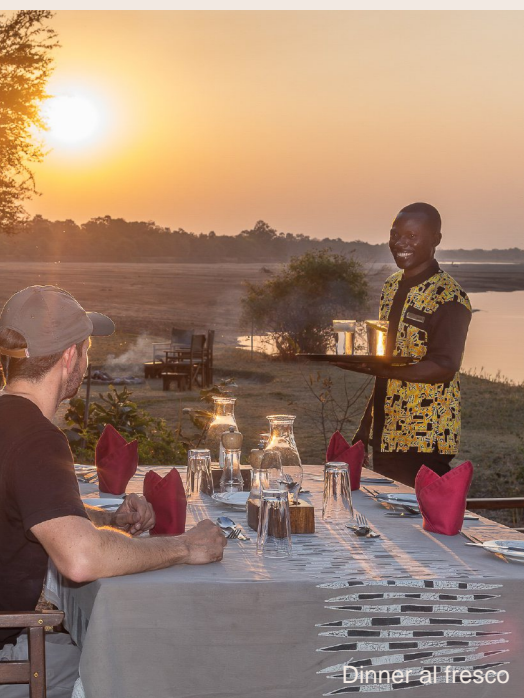
Dinner al fresco

Although the main activity at Island Bush Camp is walking safaris, we do also use a safari vehicle to get into a variety of walking areas or return from a walk after dark to discover some of the nocturnal wildlife in the area.