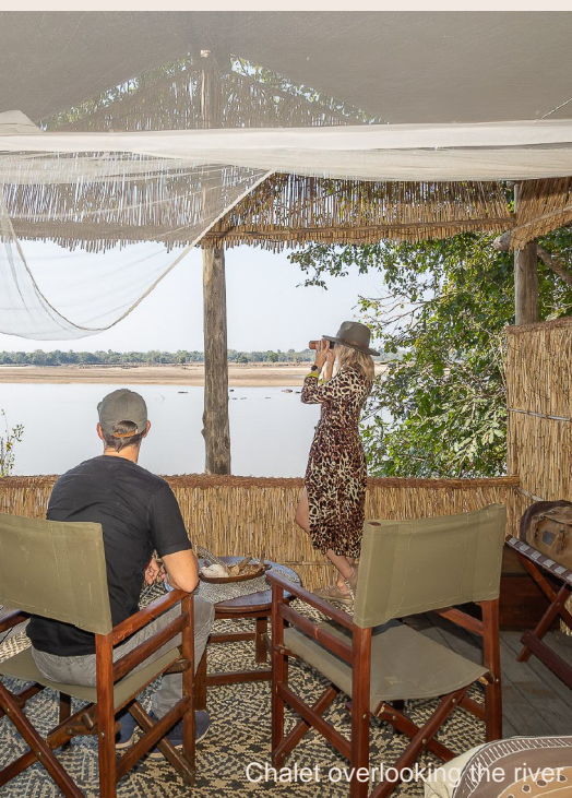
Chalet overlooking the river