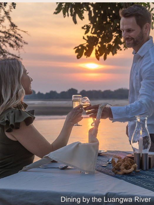
Dining by the Luangwa River