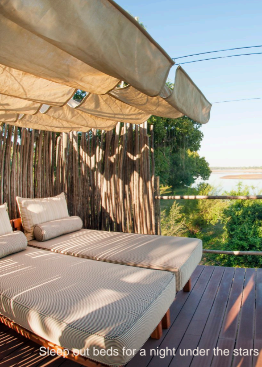
Sleep out beds for a night under the stars