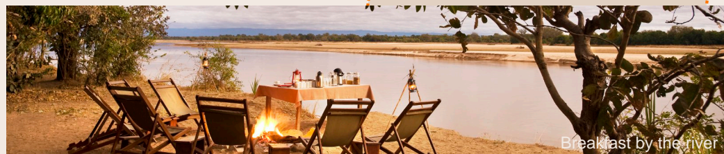
Breakfast by the river