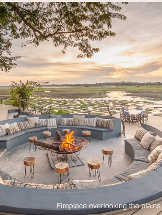
Fireplace overlooking the plains