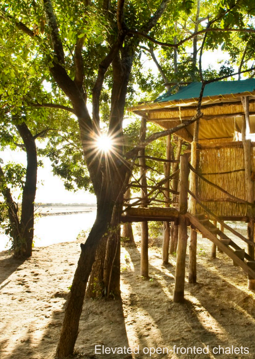
Elevated open-fronted chalets

Island Bush Camp is our charming authentic camp, located well off the beaten tracks and immersed in pure wilderness. The camp is set under the cool shade of old mahogany trees on the banks of the Luangwa River.