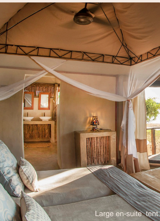
Large en-suite tent