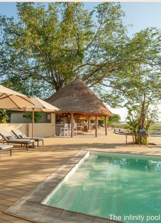
The infinity pool

Established for over 25 years, Kafunta is a distinctive Zambian safari lodge with a contemporary touch; it combines all the ingredients to create an exceptional safari. Here you will find the rest and peace you need after an exciting day in the bush in combination with attentive service and a warm welcome by our team.