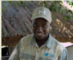
HUSTLER Guide, Maintenance