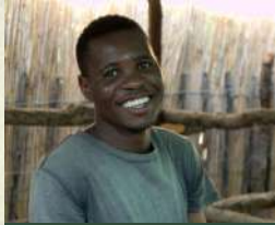
LIFE Groom, Poler, Assistant Farrier