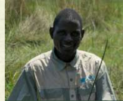
BARUTI Guide, Driver