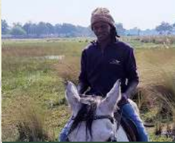
FLOOD Guide, Stable Hand