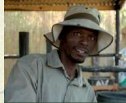
T-MAN Groom, Groundsman