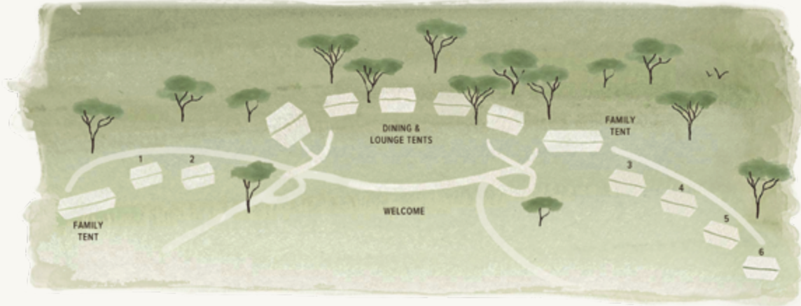
Camp layout | 1 November 2025 - 10 January 2026