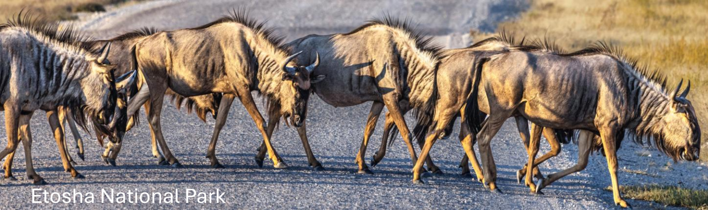
Etosha National Park