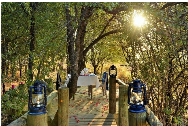
Private Dining (Honeymooners) 1