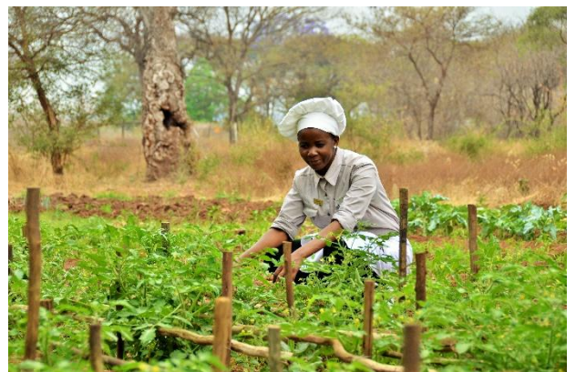
Fusion food inspired by local cuisine using freshly-grown produce from the garden