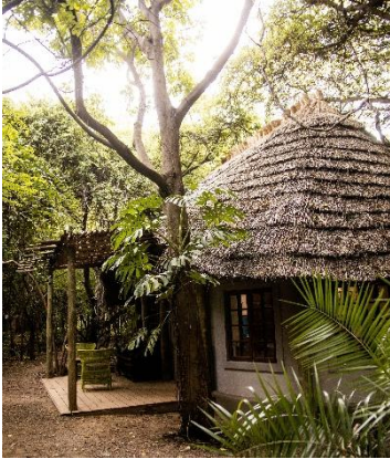
Reception & Curio Shop