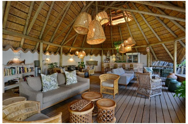
Main Area with separate Lounge/Bar and Dining