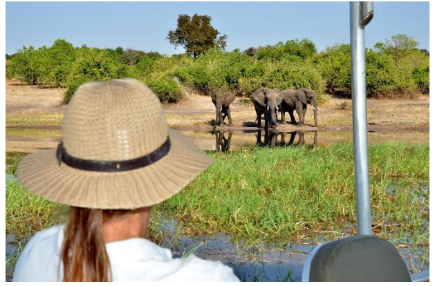
BOAT CRUISES in the Chobe National Park.