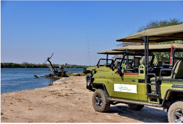
GAME DRIVES in the Chobe National Park.