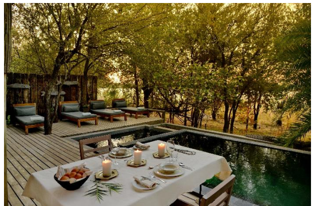
Private Dining (Honeymooners) 2