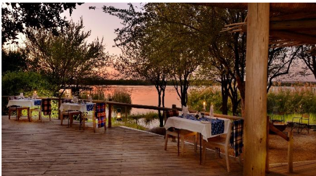
Dining Area 1