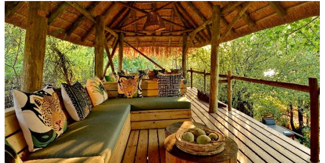
Upstairs Chill-Out Lounge above the pool area