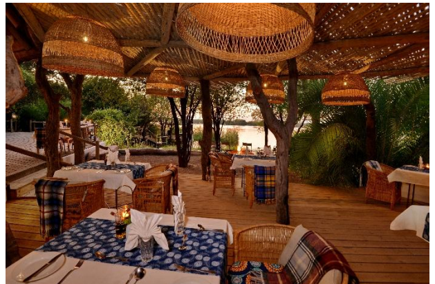
Dining Area 2