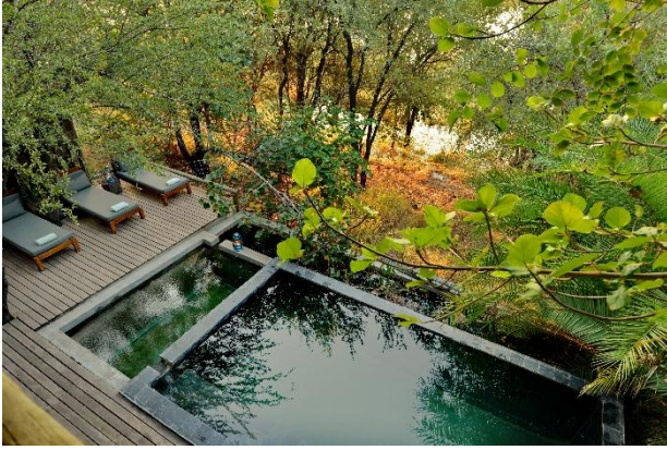
Outdoor natural Swimming Pool (Eco pool) Naturally filtered by plants – no chlorine, salt or harmful chemicals