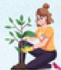
Harvest and Tasting