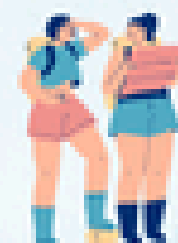
Nature Trails Hiking