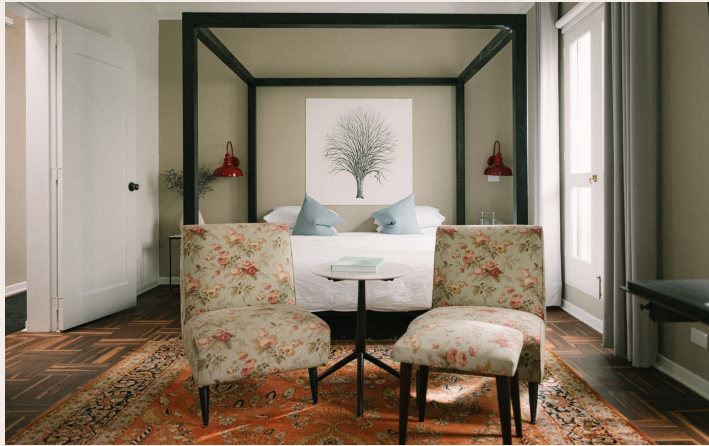
Grande – Starting at $335 (27m 2 )