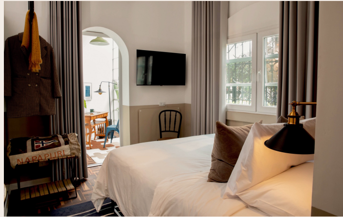
Mediana – Starting at $224 (17.5m 2 )