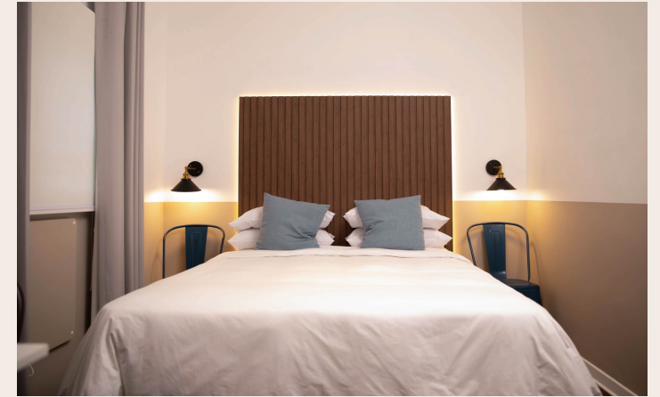
Pequeña – Starting at $191 (15m 2 )