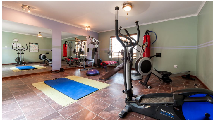
The fully equipped gym is available to guests