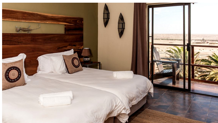
Luxury Room in the house - overlooking the moon landscape

Style and Luxury ~ away from the madding crowd