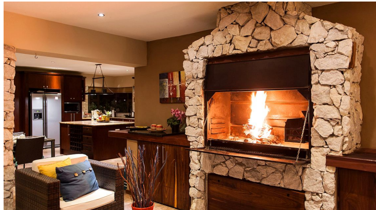
The cosy yet spacious interior of the house