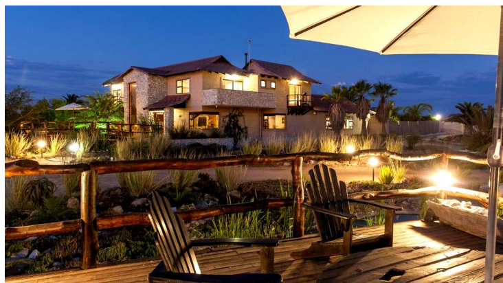
Truly an oasis in the desert!