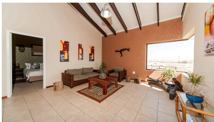
A spacious Self-Catering Chalet - Lounge and Bedroom