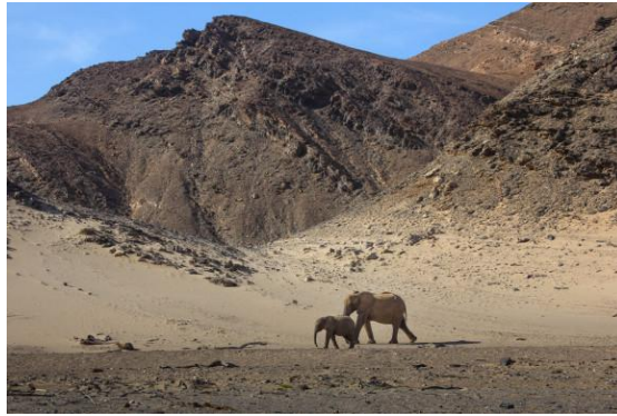
Desert-adapted elephant ACTIVITY