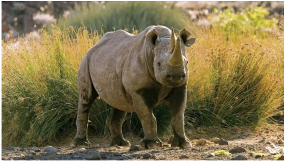
Save the Rhino Trust (SRT)