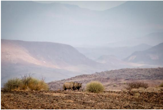
Desert-adapted rhino ACTIVITY

*DESERT ELEPHANT AND PRIVATE ROCK ART ACTIVITY ARE ONLY POSSIBLE ON A MINIMUM OF 3 NIGHTS STAY