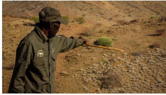
Pack for Conservation