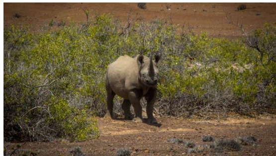
DORO JMA CONSERVATION AREA