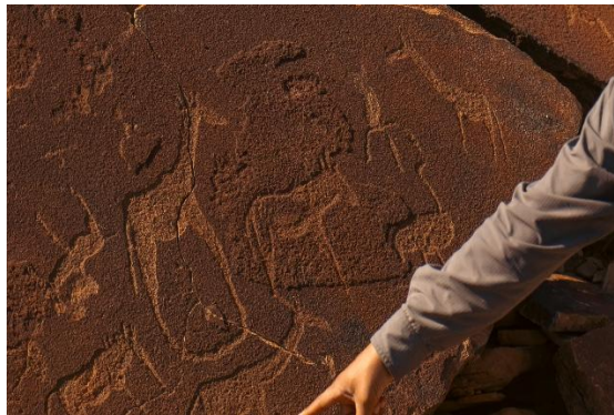
Private rock art site ACTIVITY

Reservations Emergency Number: +264 81 165 9975 • Tel: +264 61 248137 • reservations@ultimate.earth