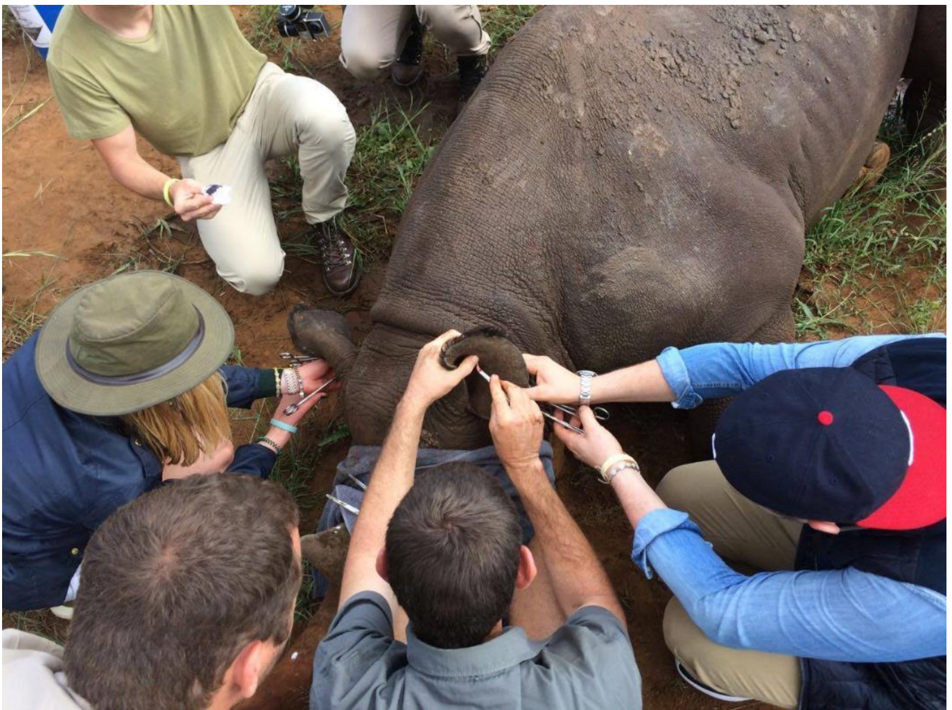
Rhino notching procedure

Afterwards you will enjoy a nice breakfast (at the house or in the bush) and you will have time to relax and enjoy the pool. In the afternoon you will enjoy lunch and another afternoon game-drive , followed by dinner.