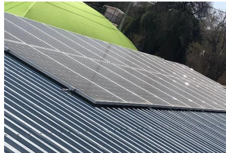
Sustainable management practices

Reservations Emergency Number: +264 81 165 9975 • Tel: +264 61 248137 • reservations@ultimate.earth