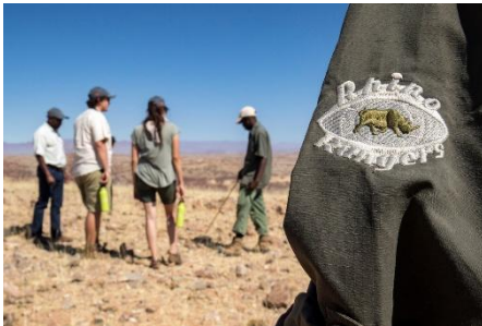
Pack for Conservation