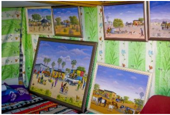
Windhoek 'Redefined' Tour