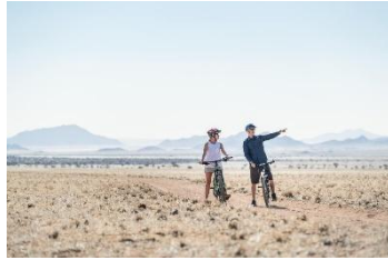
Windhoek Mountain Biking