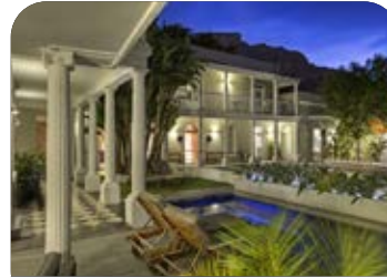
3. THE THREE BOUTIQUE