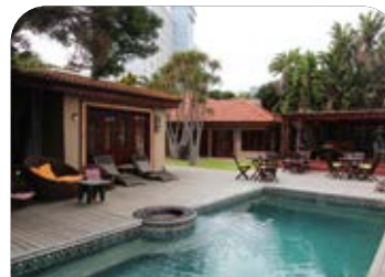
8. SINGA LODGE