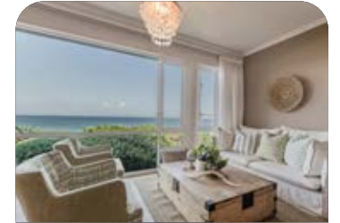
5. THE ROBBERG BEACH LODGE