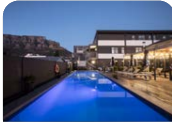
2. KLOOF STREET HOTEL