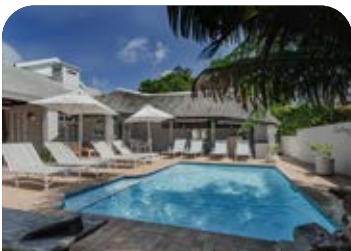
6. COTTAGE PIE VILLA