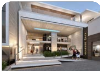
7. PLETT QUARTER HOTEL & APARTMENTS