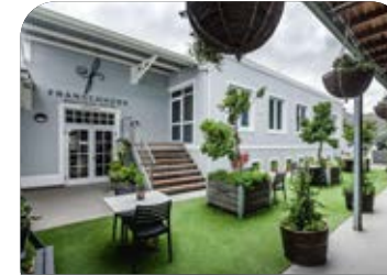
4. FRANSCHHOEK BOUTIQUE