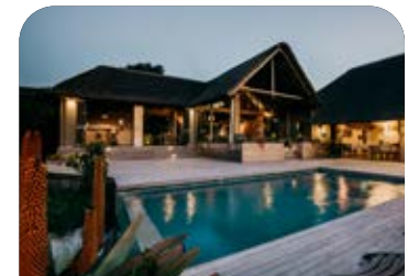
10. BUKELA LODGE