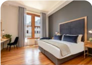
1. OLD BANK HOTEL