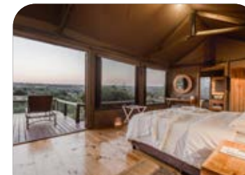
9. HLOSI LODGE