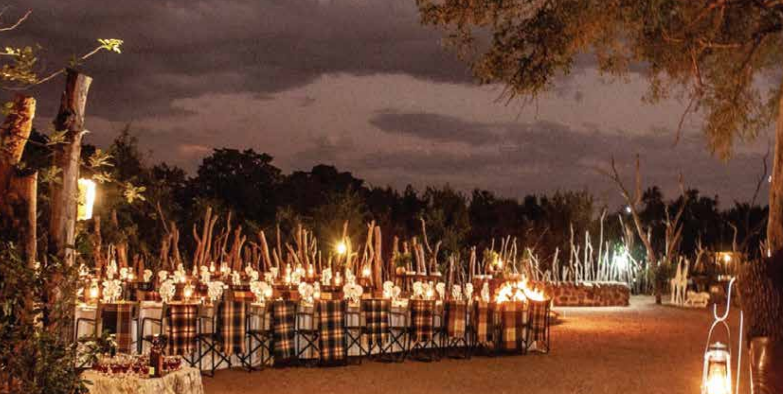
Chisomo hosts elegant weddings in the midst of the Big 5.