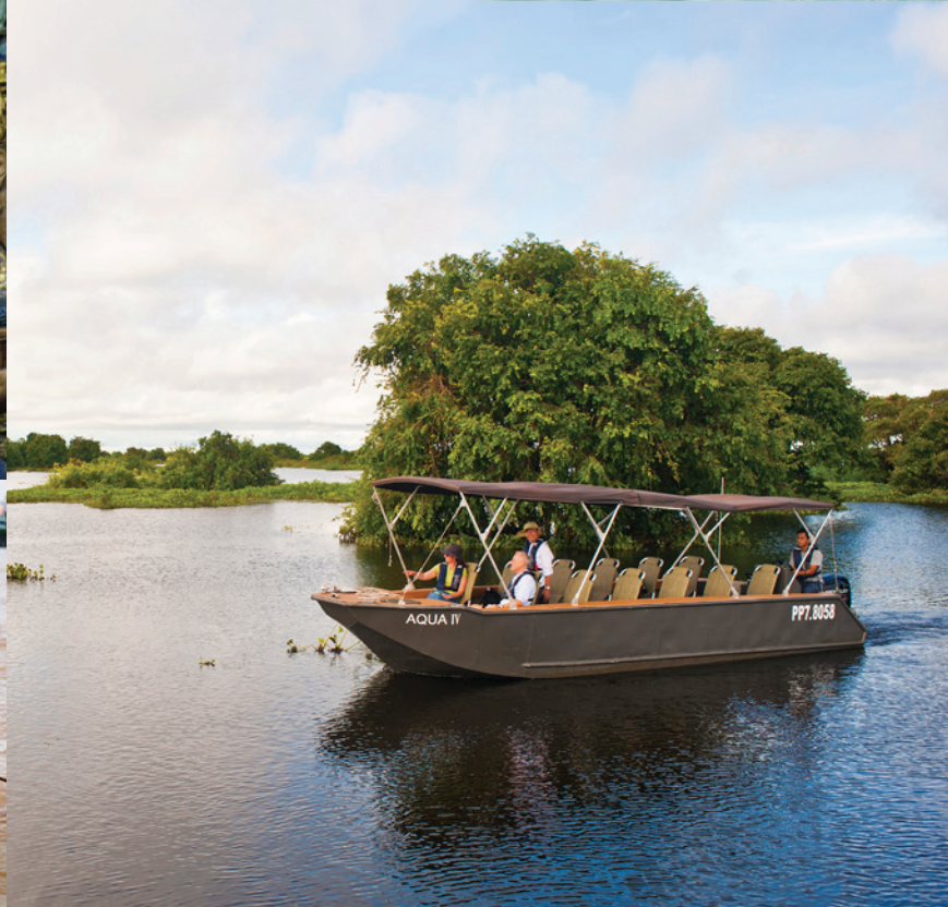
4 ergonomic private tenders for excursions