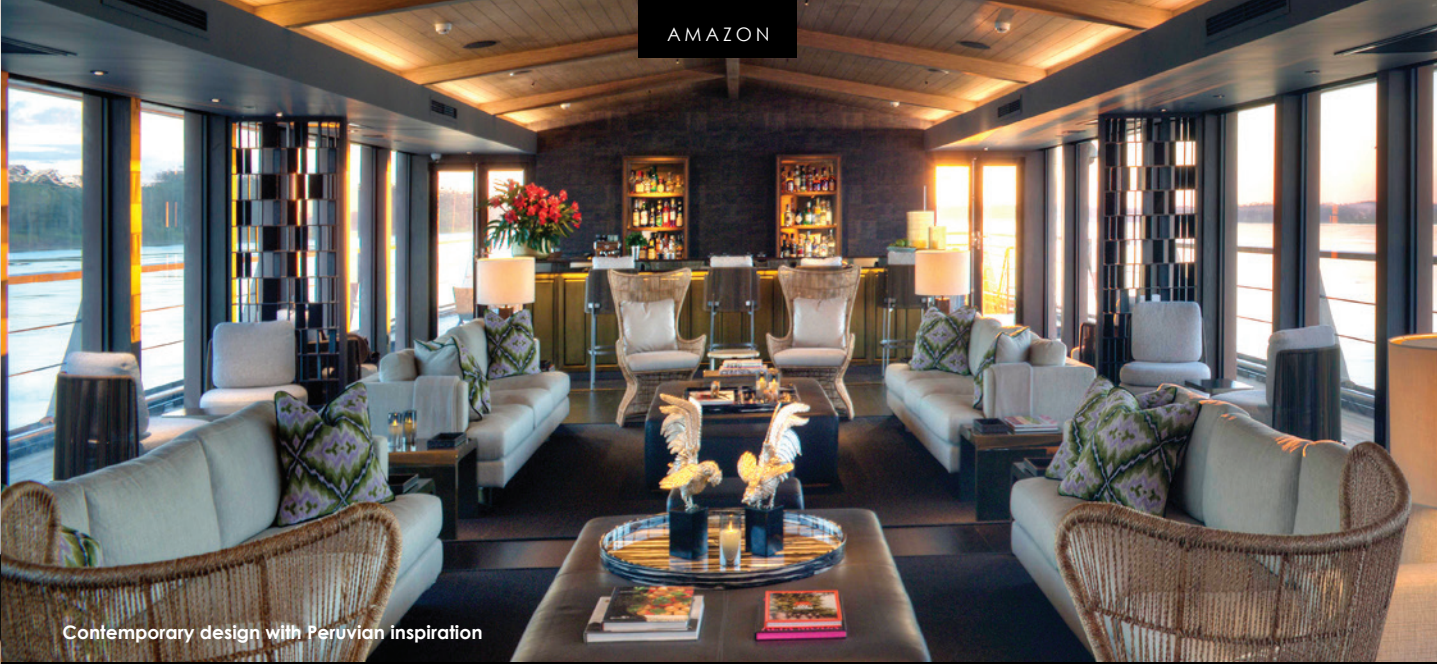
Contemporary design with Peruvian inspiration