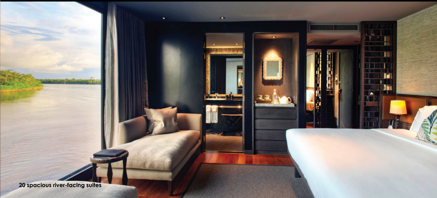
20 spacious river-facing suites