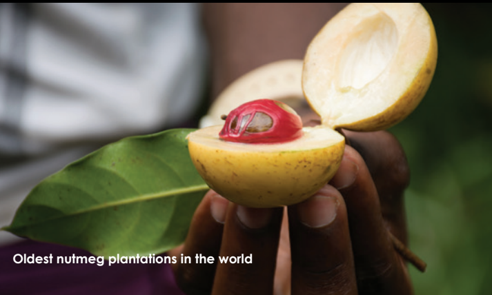
Oldest nutmeg plantations in the world