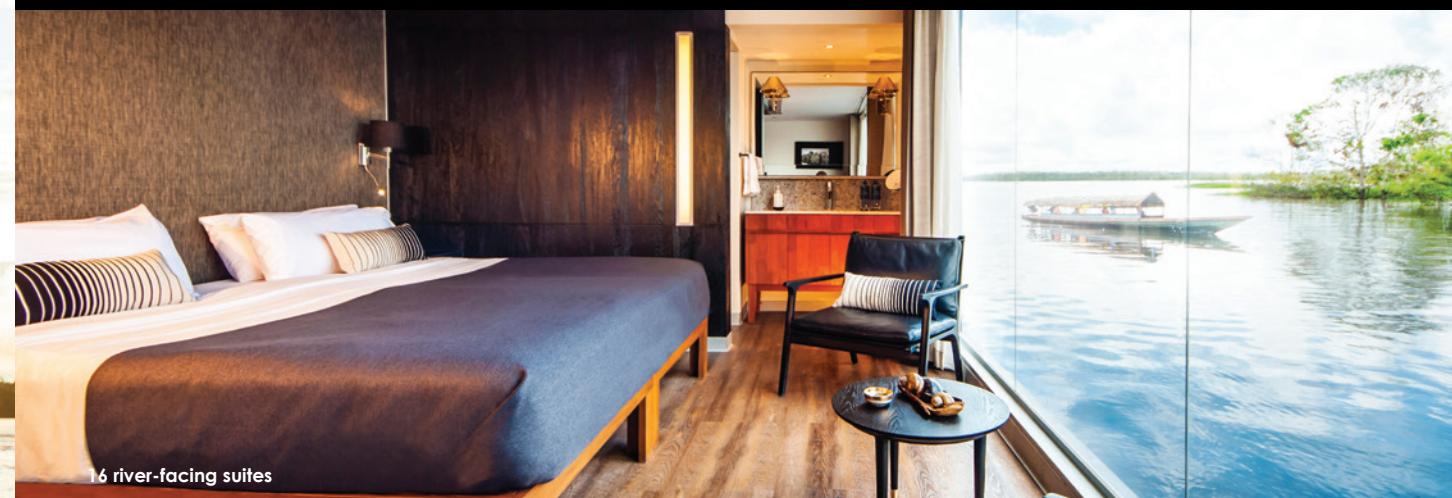
16 river-facing suites