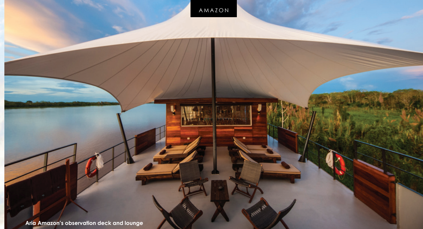
Aria Amazon's observation deck and lounge