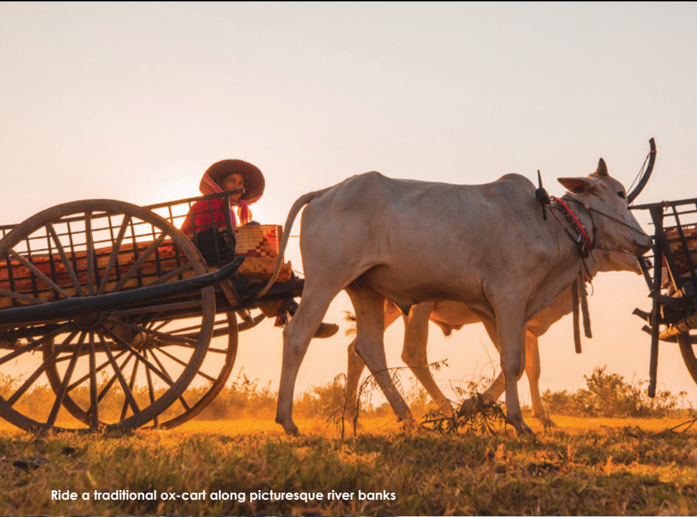
Ride a traditional ox-cart along picturesque river banks