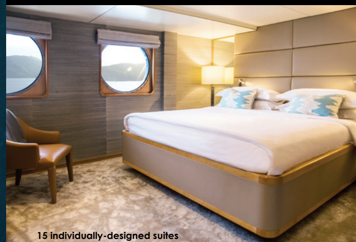
15 individually-designed suites