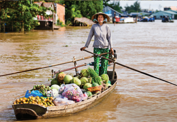
Local floating markets