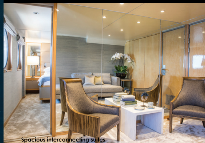
Spacious interconnecting suites