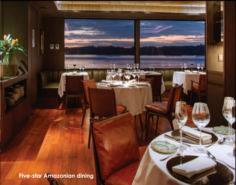
Five-star Amazonian dining