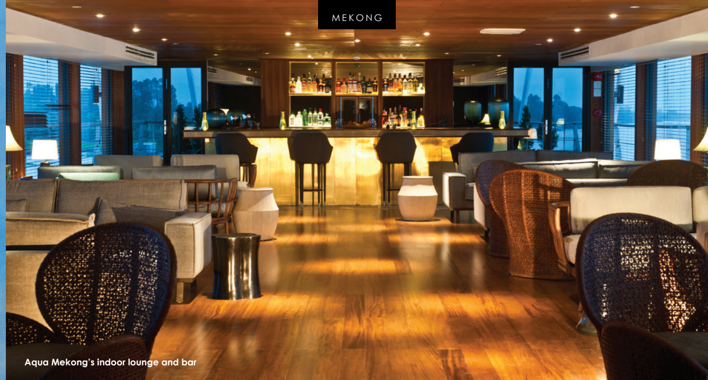
Aqua Mekong's indoor lounge and bar