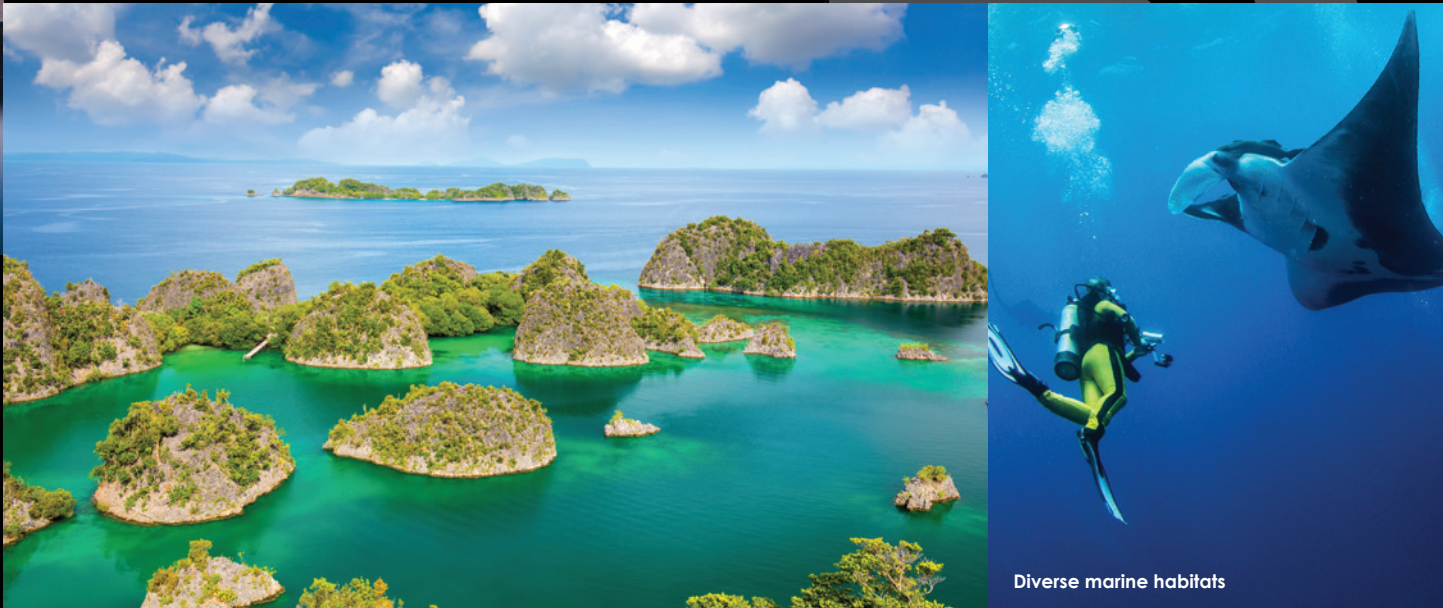
Diverse marine habitats

Discover paradise on the edge of the Pacific