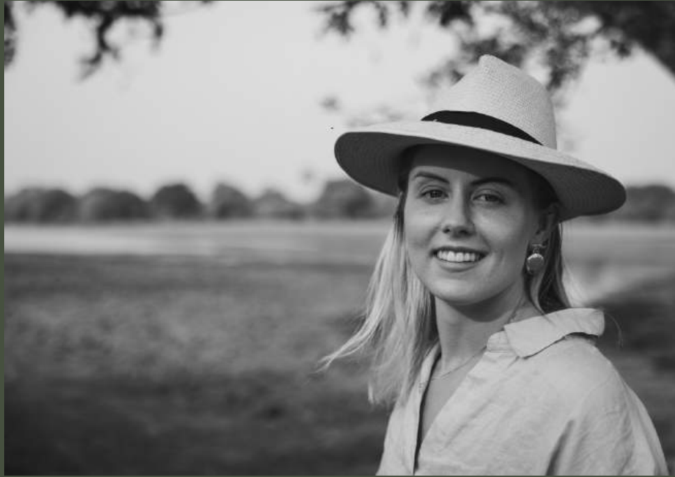
Jordan Marketing and Reservations