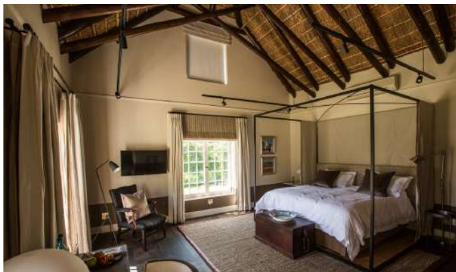
Garden Rooms | 2

With their elegant design and lofty ceilings, the two Garden Rooms seamlessly blend with the outdoors, leading to a verandah covered in wisteria. From this vantage point, you can savour views of the pool and vineyards, creating a serene backdrop for your stay.