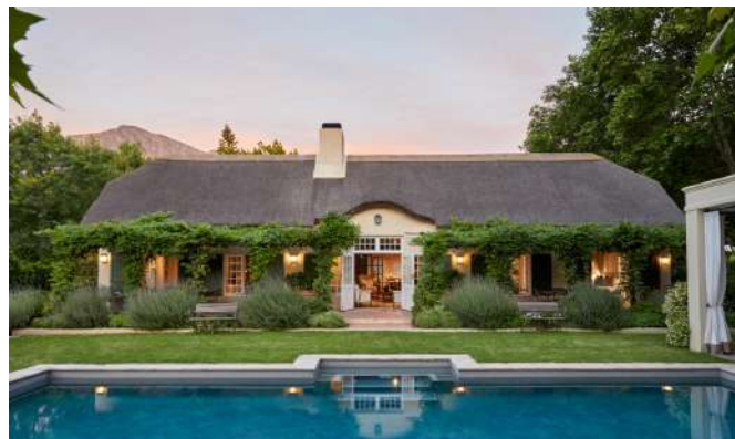
Exclusive Use | 5-bedroom villa

Tucked beneath traditional thatched roofs, the Petite Rooms offer cosy charm with a king-size bed (or twins), en-suite shower, and access to a shared lounge. Ideal for solo travellers or couples seeking a snug retreat.