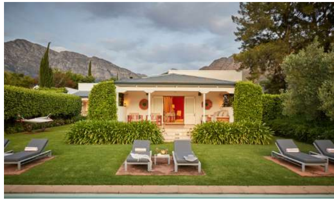
Domain | 3- or 4-bedroom villa

An art-inspired haven with contemporary design elements. Boasts an open-plan living area, private garden, and sweeping views of the surrounding vineyards and mountains. Perfect for art lovers and those seeking a chic retreat.