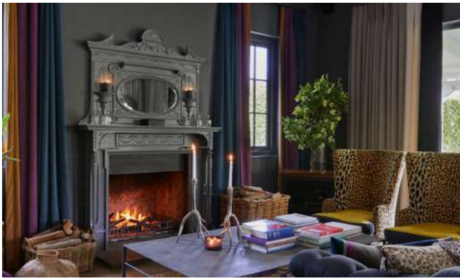
Galerie | 1 or 2-bedroom villa

A spacious, designer-renovated barn that combines rustic charm with modern comforts. Features a loft area suitable for children, open-plan living spaces, and a sun-drenched pool. Ideal for families or groups desiring ample space and comfort.