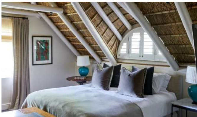
Petite Rooms | 2

The Courtyard Room offers both privacy and spaciousness, featuring direct access to the exquisite gardens through a private patio. This room boasts the most opulent bathroom in the lodge, ensuring your relaxation is as luxurious as it is tranquil.