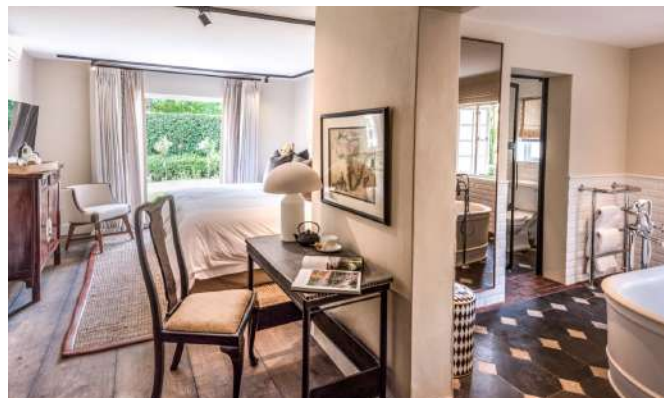
Courtyard Room | 1

With their elegant design and lofty ceilings, the two Garden Rooms seamlessly blend with the outdoors, leading to a verandah covered in wisteria. From this vantage point, you can savour views of the pool and vineyards, creating a serene backdrop for your stay.