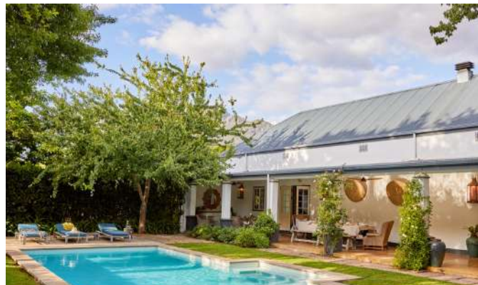
Grange | 3-bedroom villa

A historic Cape Dutch farmhouse that exudes timeless elegance. Features a wraparound terrace, private pool, and interiors adorned with French linens, antiques, and muted tones. Ideal for couples or small families seeking a serene escape.