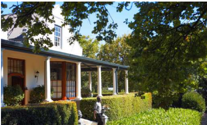
Manoir | 1 or 2-bedroom villa

A historic Cape Dutch farmhouse that exudes timeless elegance. Features a wraparound terrace, private pool, and interiors adorned with French linens, antiques, and muted tones. Ideal for couples or small families seeking a serene escape.