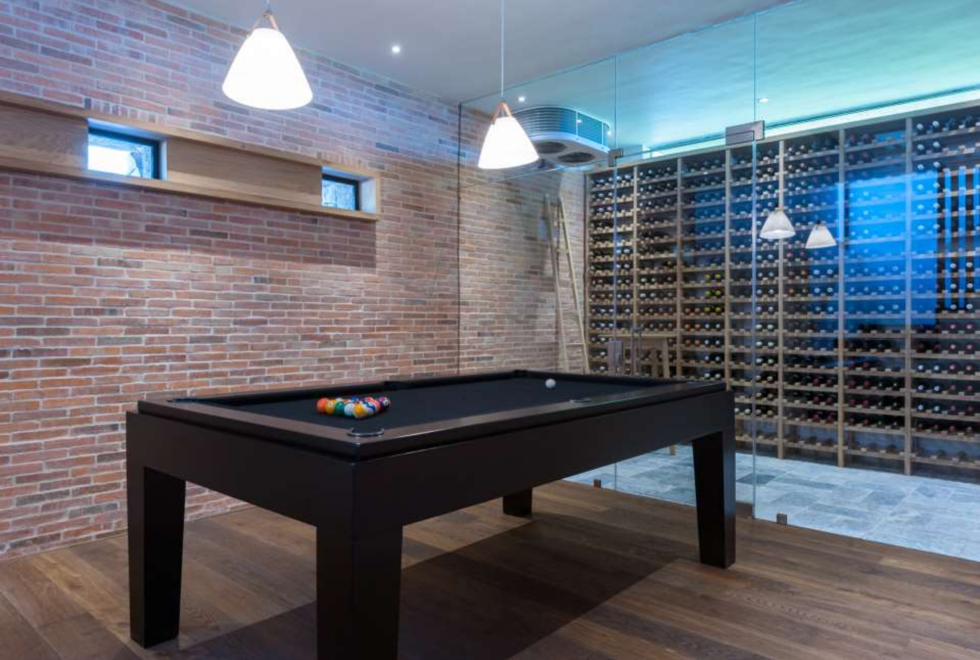
Entertainment Room and Wine Cellar