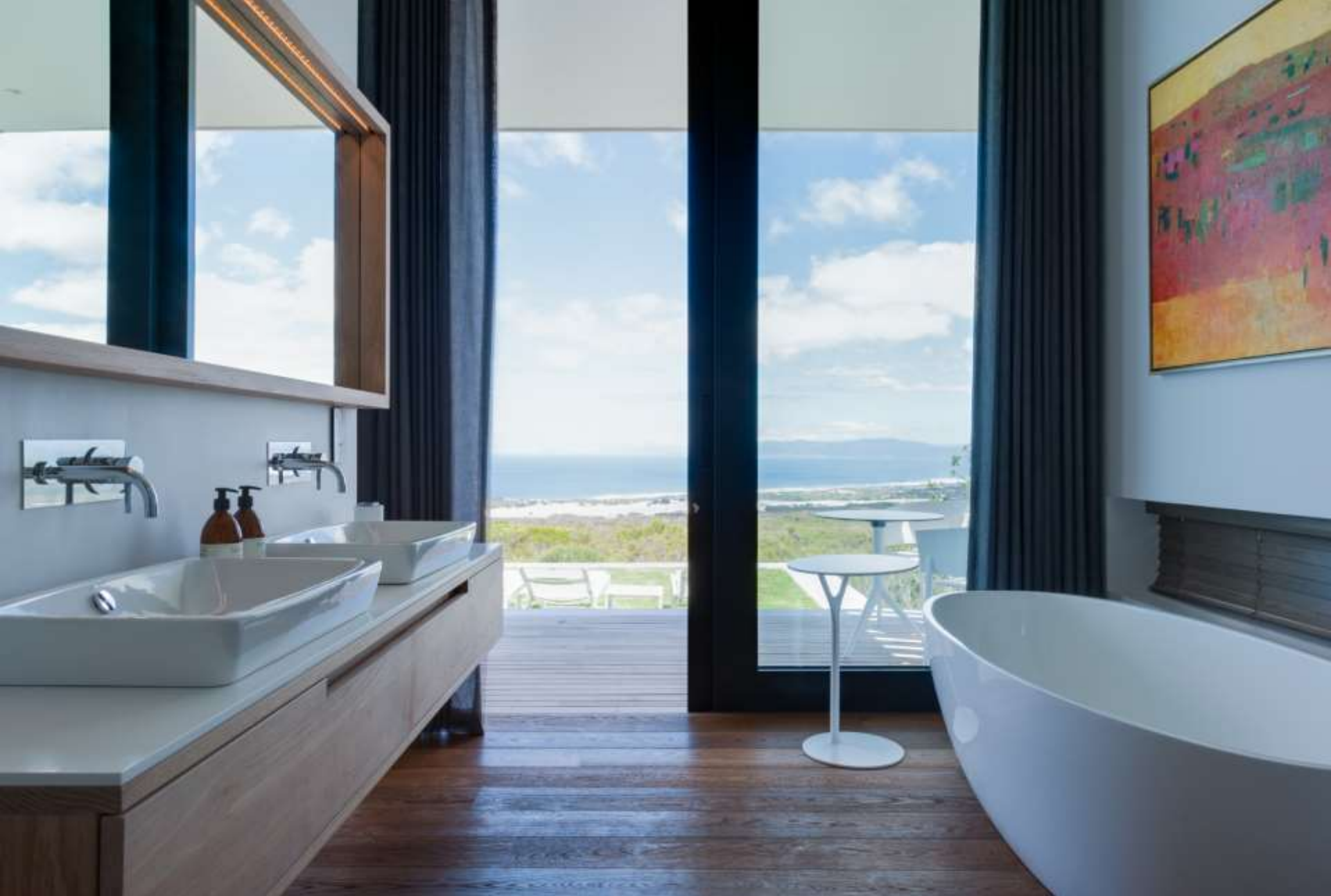
1x Master Suite with en-suite bathroom (bath and shower)