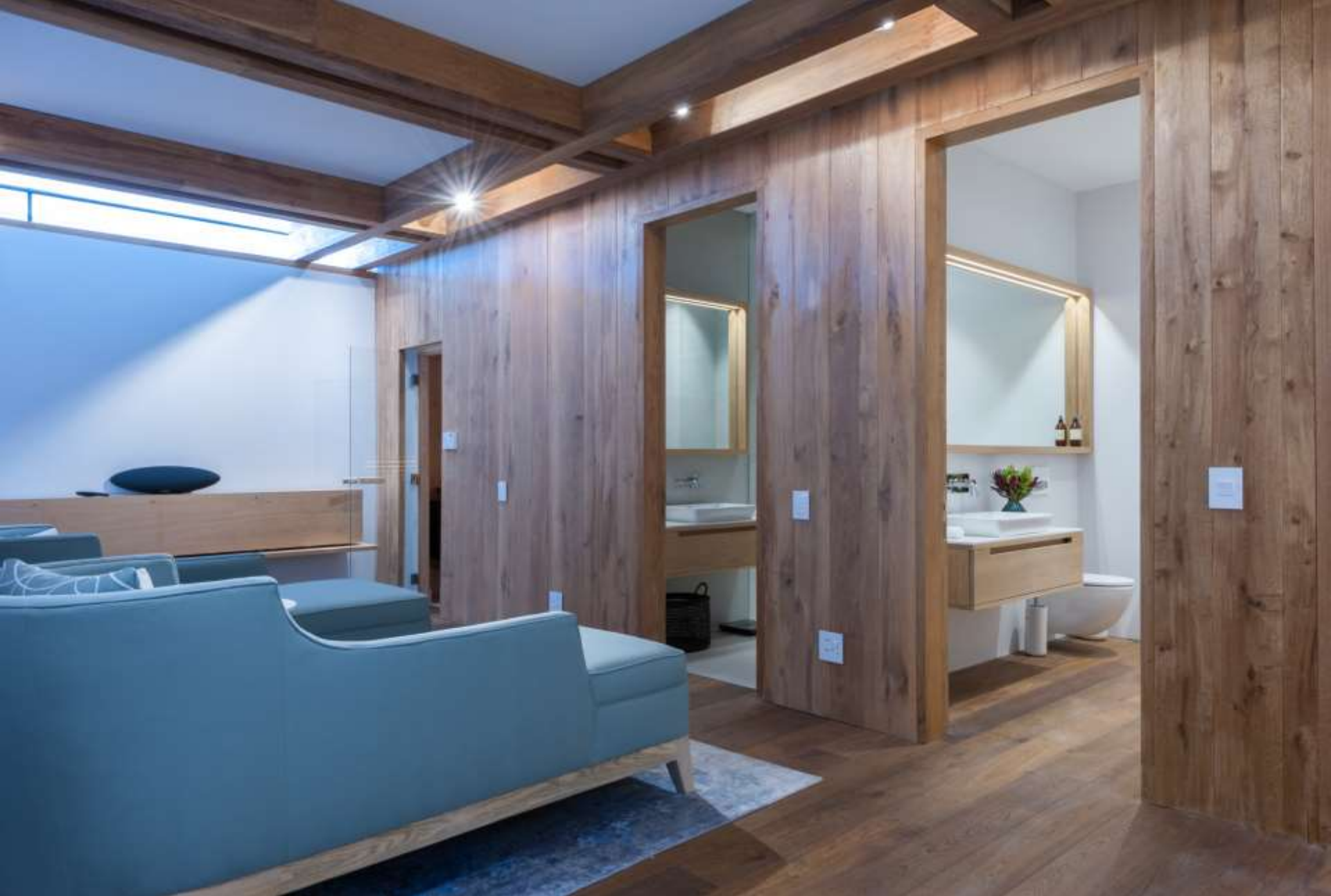
Sauna and Relaxation Room