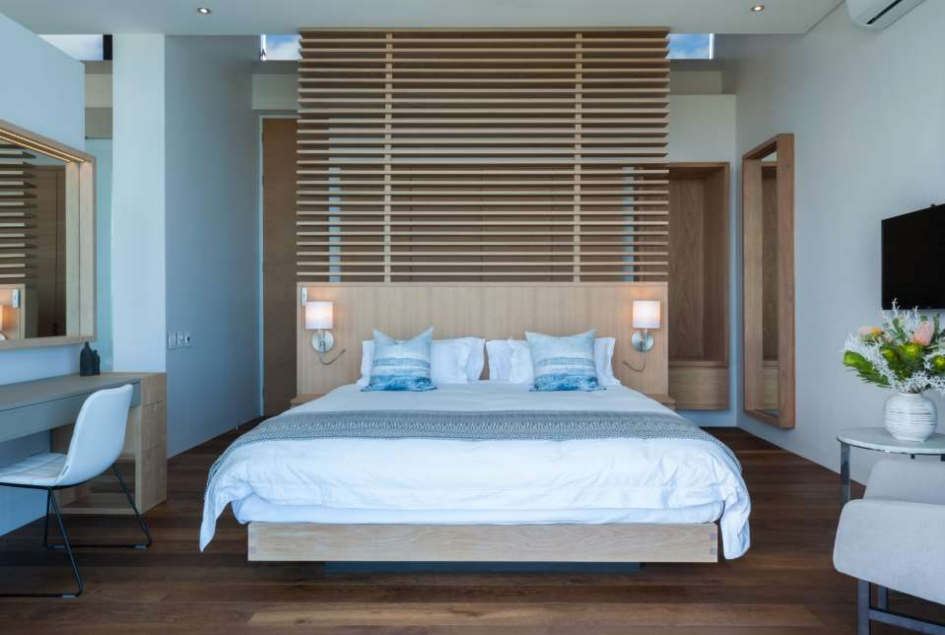
1x Master Suite with en-suite bathroom (bath and shower)