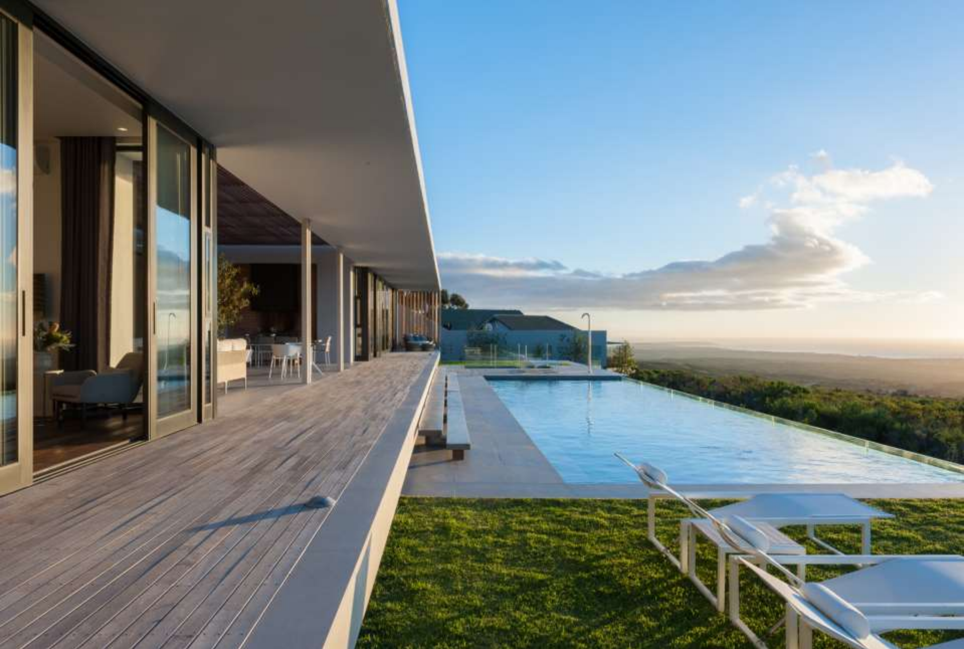
Outside Pool (heated)