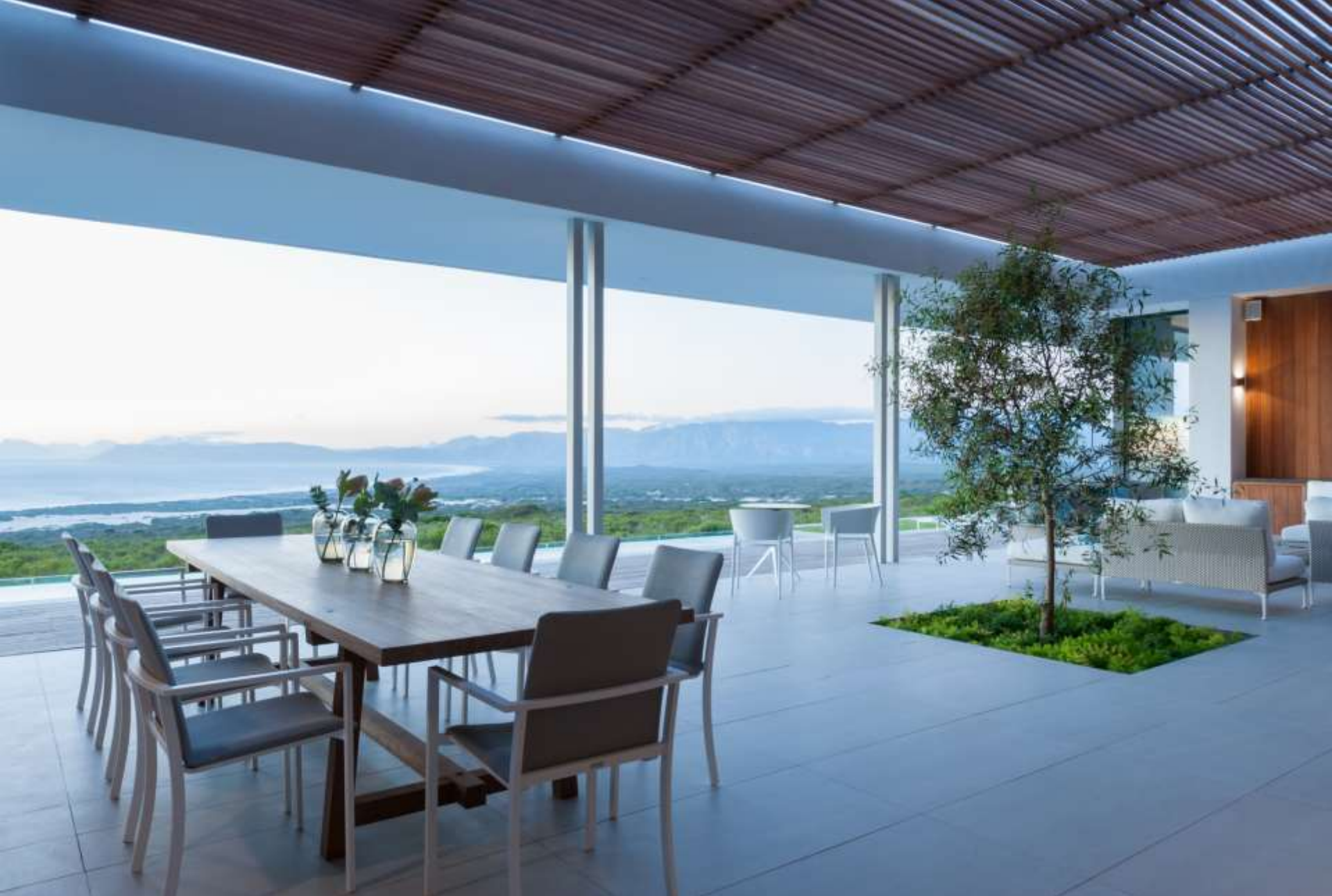
Outside Deck with BBQ area