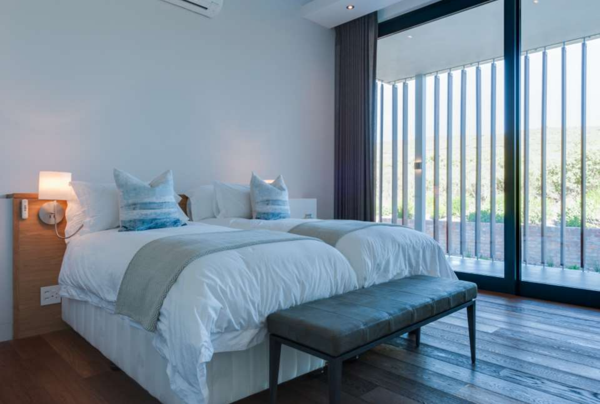
1x Luxury Bedroom with en-suite bathroom (shower only)