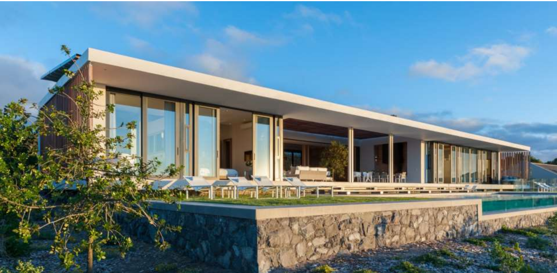
4-Bedroom Grootbos Villa