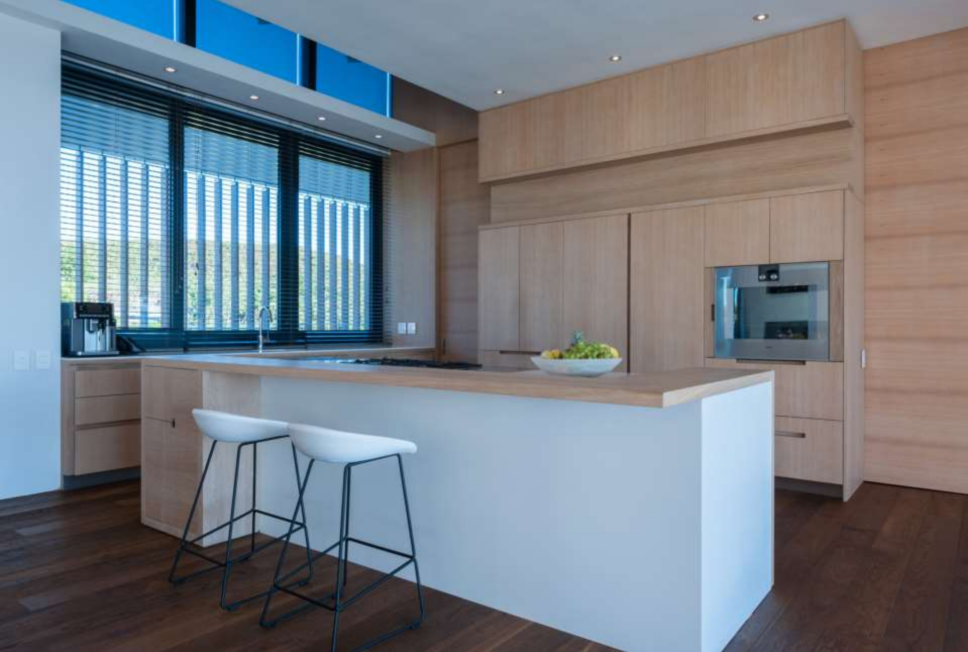
Fully equipped kitchen with storeroom and scullery