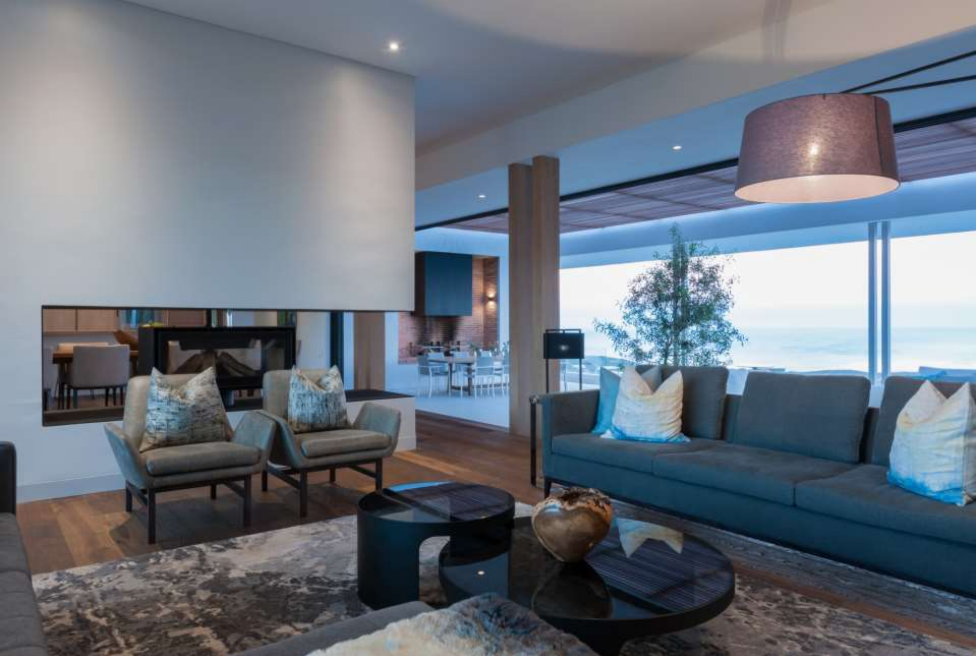
Lounge with TV Satellite