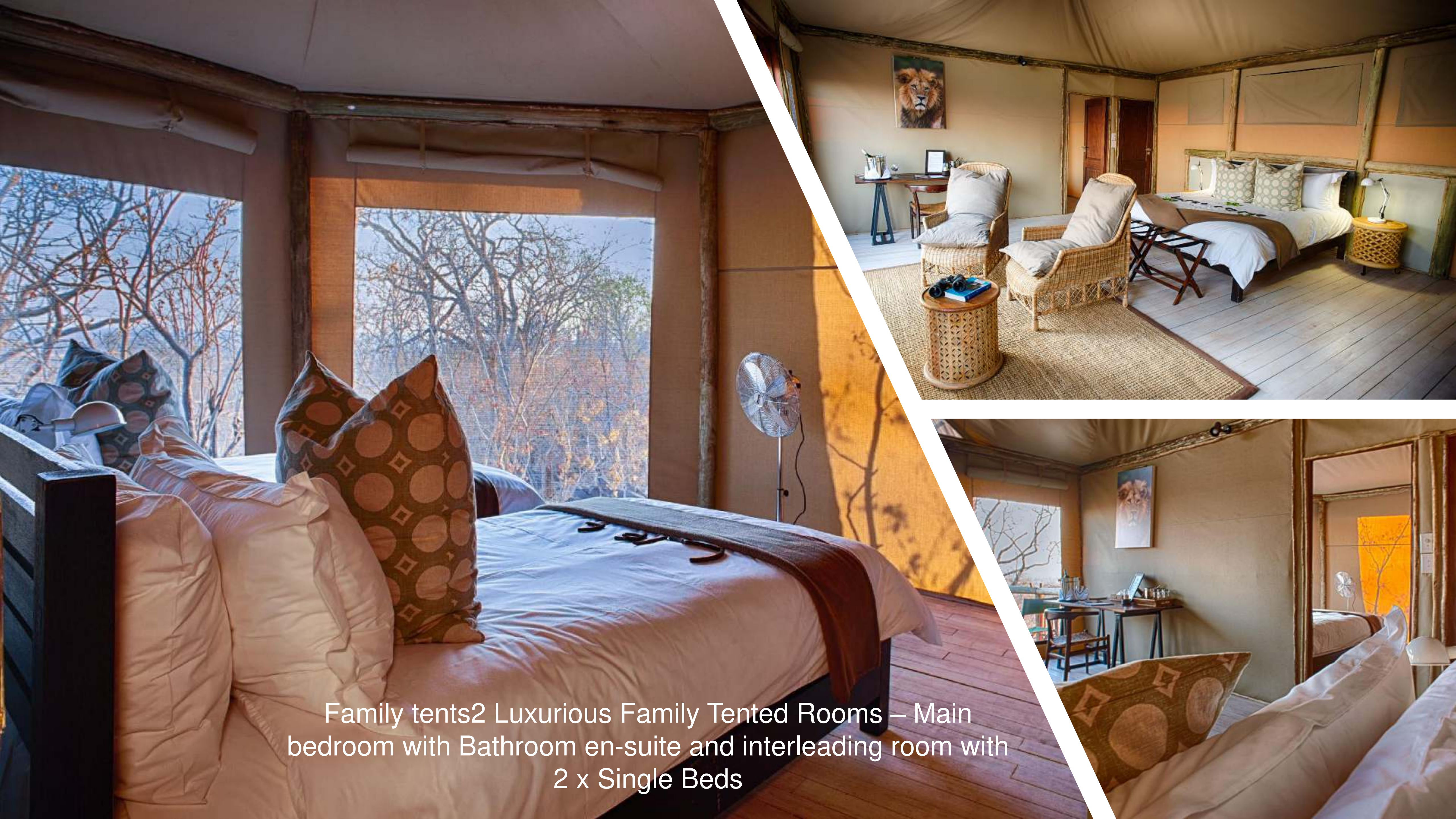
Family tents2 Luxurious Family Tented Rooms – Main bedroom with Bathroom en-suite and interleading room with 2 x Single Beds