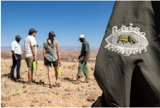
Pack for Conservation