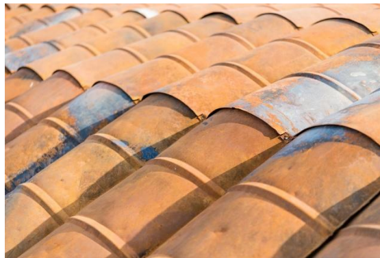
Reused, recycled & completely sustainable