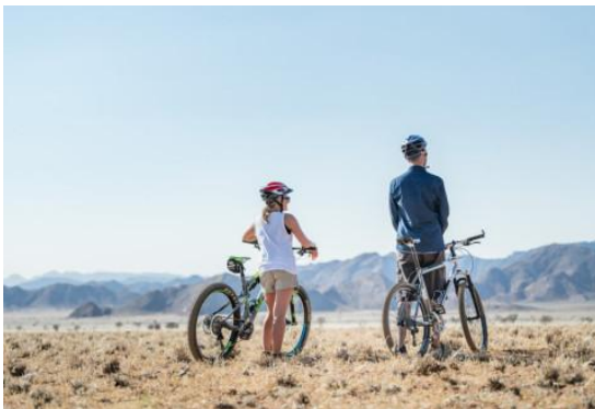
Mountain biking ACTIVITY