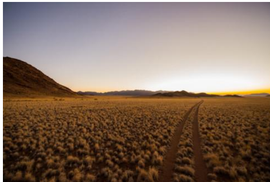
Nature drives ACTIVITY