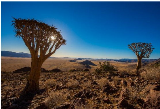
Namib Tsaris Conservancy