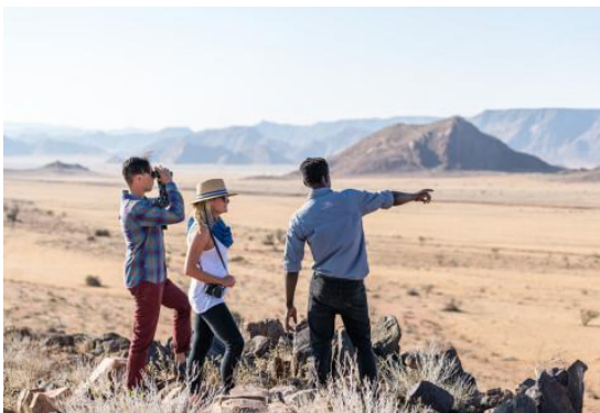
Nature walks ACTIVITY