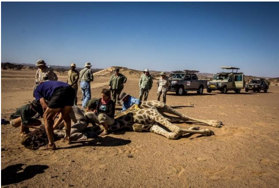
Giraffe Conservation Foundation