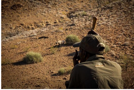
Black Rhino ACTIVITY (extended stays only)