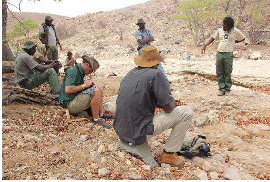
Doro !Nawas Conservancy