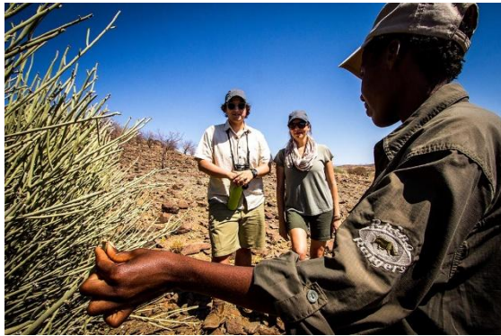
Pack for Conservation

Reservations Emergency Number: +264 81 165 9975 • Tel: +264 61 248137 • reservations@ultimate.earth