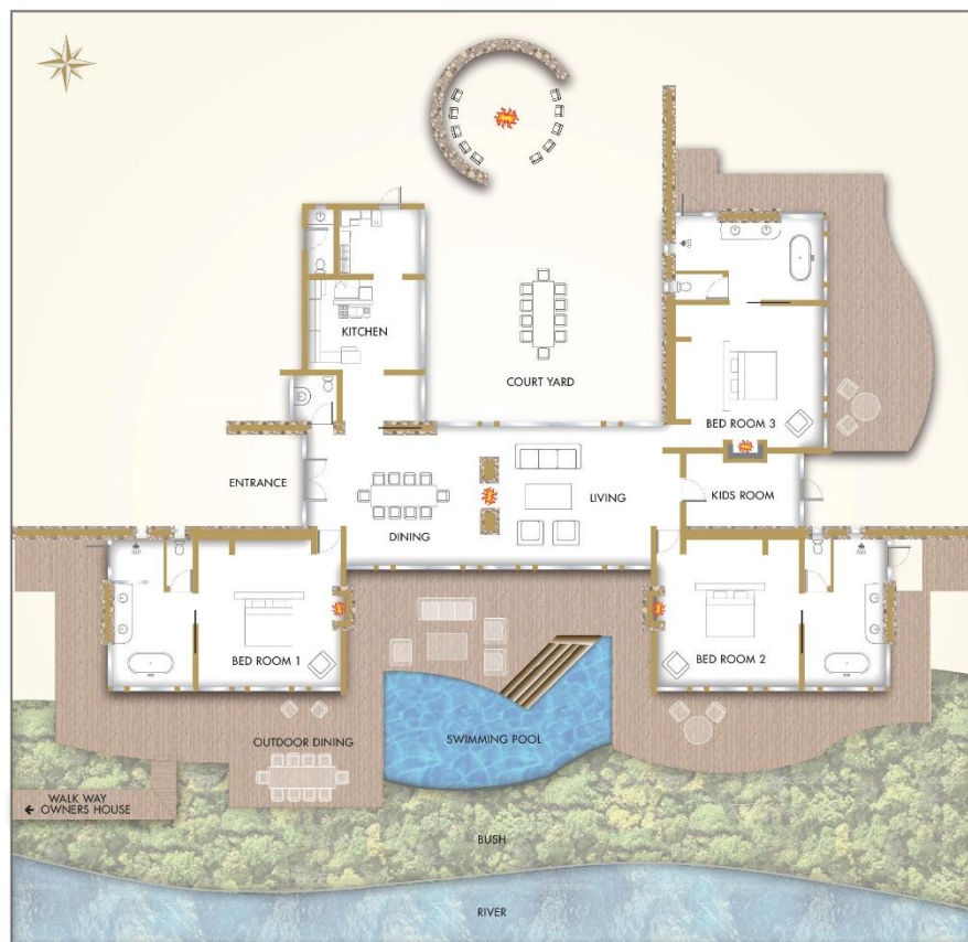
River House – 320 m 2 Bedroom sizes (including bathroom) – 52 m 2