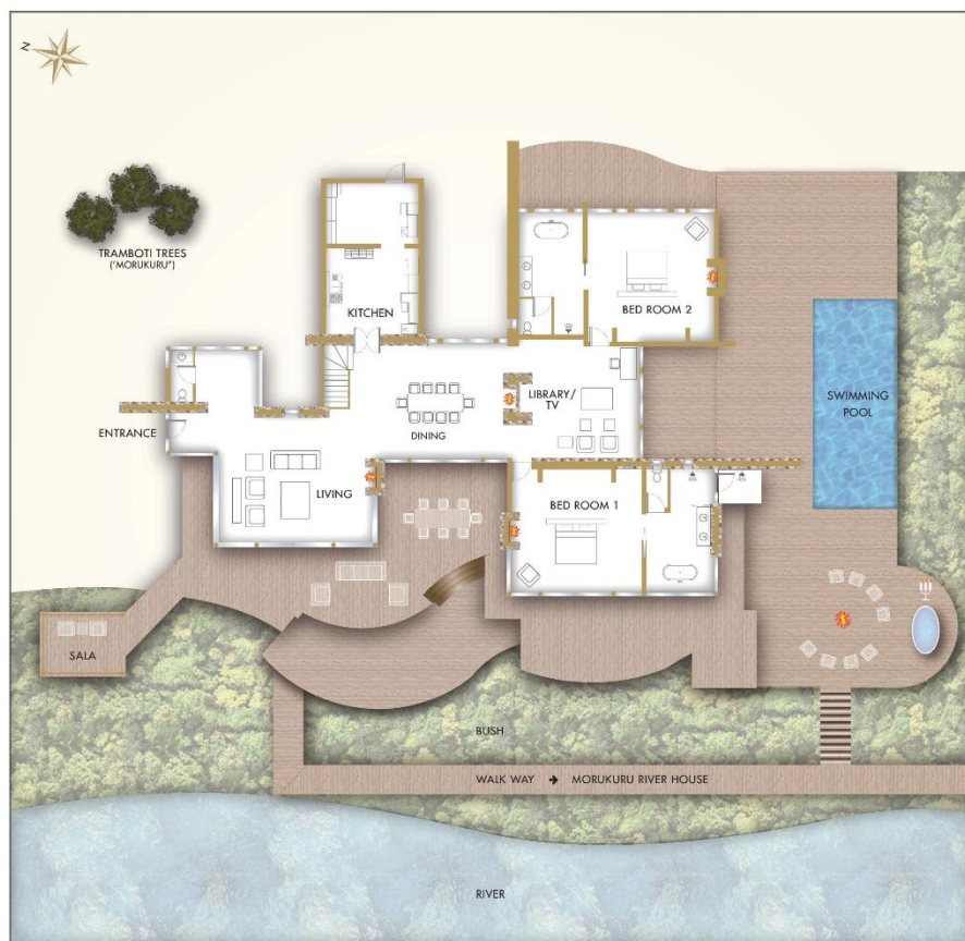
Owner's House – 310 m 2 Bedroom sizes (including bathroom) – 52 m 2