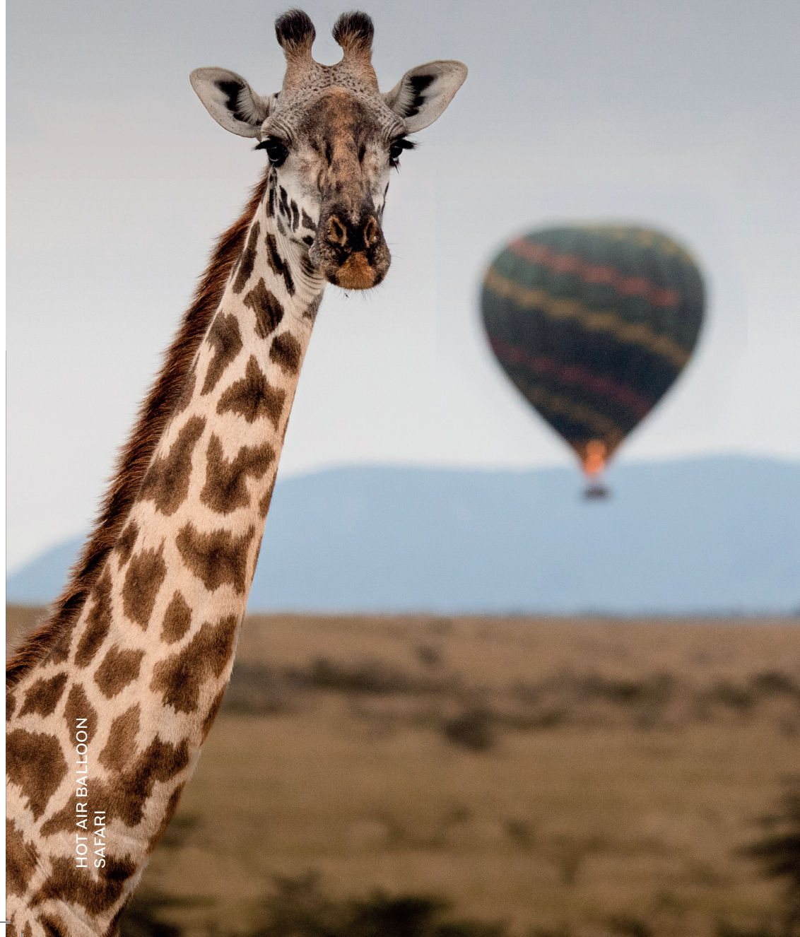
HOT AIR BALLOON SAFARI