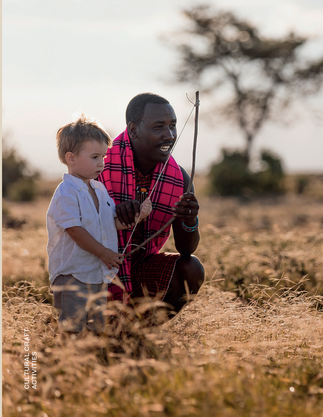
CULTURAL CRAFT ACTIVITIES

Ol Seki is family-oriented and offers a variety of child-friendly experiences designed to educate and entertain younger guests. Highlights include: