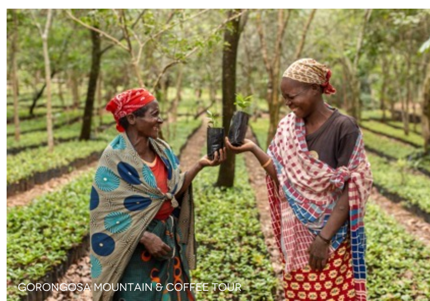
GORONGOSA MOUNTAIN & COFFEE TOUR