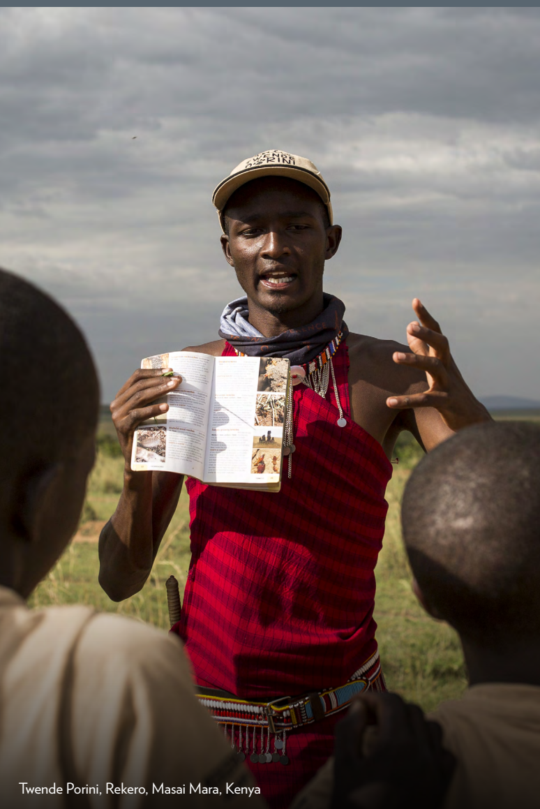
Twende Porini, Rekero, Masai Mara, Kenya

We acknowledge that people and nature are inseparable partners, so we work closely with communities, authorities, NGOs and industry partners to achieve the best possible long-term outcomes for all concerned.