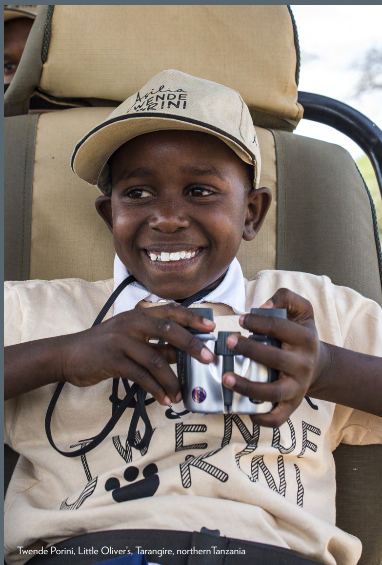
Twende Porini, Little Oliver's, Tarangire, northern Tanzania