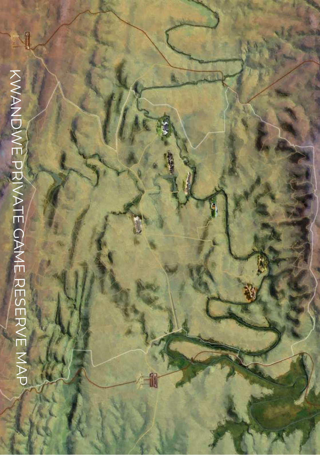
KWANDWE PRIVATE GAME RESERVE MAP