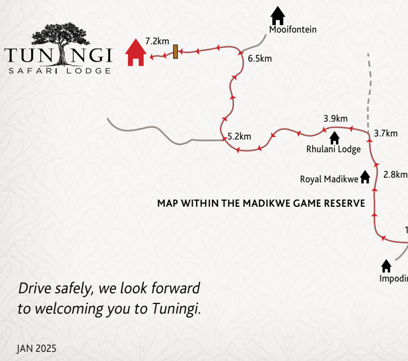
MAP WITHIN THE MADIKWE GAME RESERVE

WHEN YOU REACH THE ENTRANCE GATE TO THE LODGE, PLEASE PRESS THE GREEN BUTTON ON THE TREE STUMP ON YOUR RIGHT HAND SIDE! PLEASE DO NOT LEAVE YOUR VEHICLE! THE GATE WILL AUTOMATICALLY CLOSE BEHIND YOU ONCE YOU HAVE ENTERED.