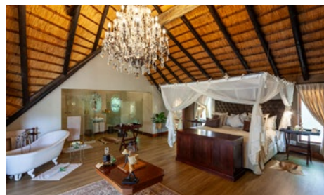
WATERBUCK PRIVATE CAMP