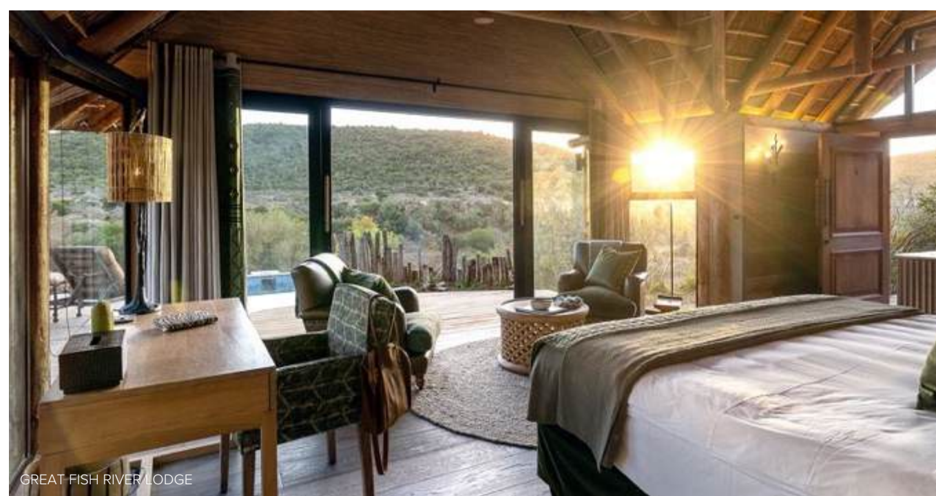
GREAT FISH RIVER LODGE