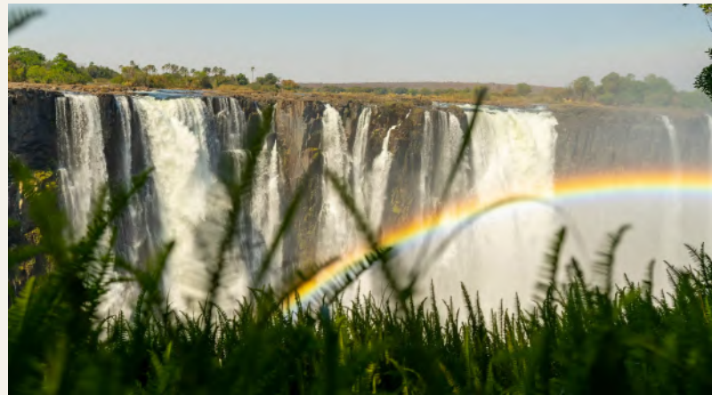
March is a good month for rainbows

While it's impossible to predict the weather, guests might find it helpful to learn how a visit to Sussi & Chuma Lodge might differ from one month to the next: from the secret perks of the rainy season to the best time for pulse-quickenning white-water rafting.