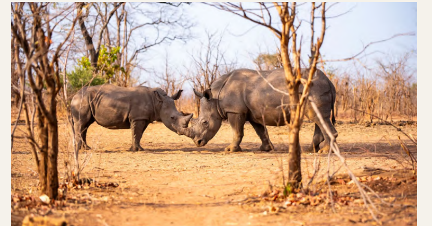
Two rhino on the dry plains

As the flow of the Zambezi lessens, white-water rafting is possible, with the Devil's Pool (a rockpool on the edge of the falls described as the ultimate infinity pool) opening in late August. It's also a good time for adventurous activities such as zip lining.