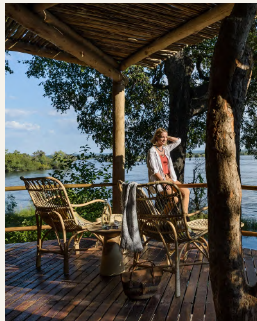
Widescreen views from the deck

Enchanting treehouse accommodation to charm adventurers aged six years and over.