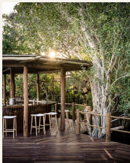
The pared-back bar amid the trees

"Big kids and little kids alike will love the lodge's treehouses, set above the rushing Zambezi."