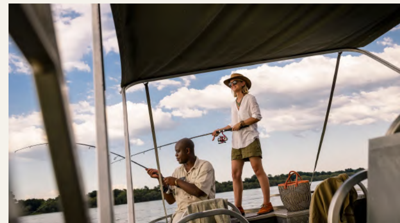
Keen anglers will enjoy fishing in the Zambezi

Follow endangered white rhinos on foot, remaining at a safe distance, as part of a 4x4 safari in Mosi-oa-Tunya National Park. Once trackers have located the animals, guests are briefed about safety protocols and rhino behavior before setting off on a thrilling two-hour walk.