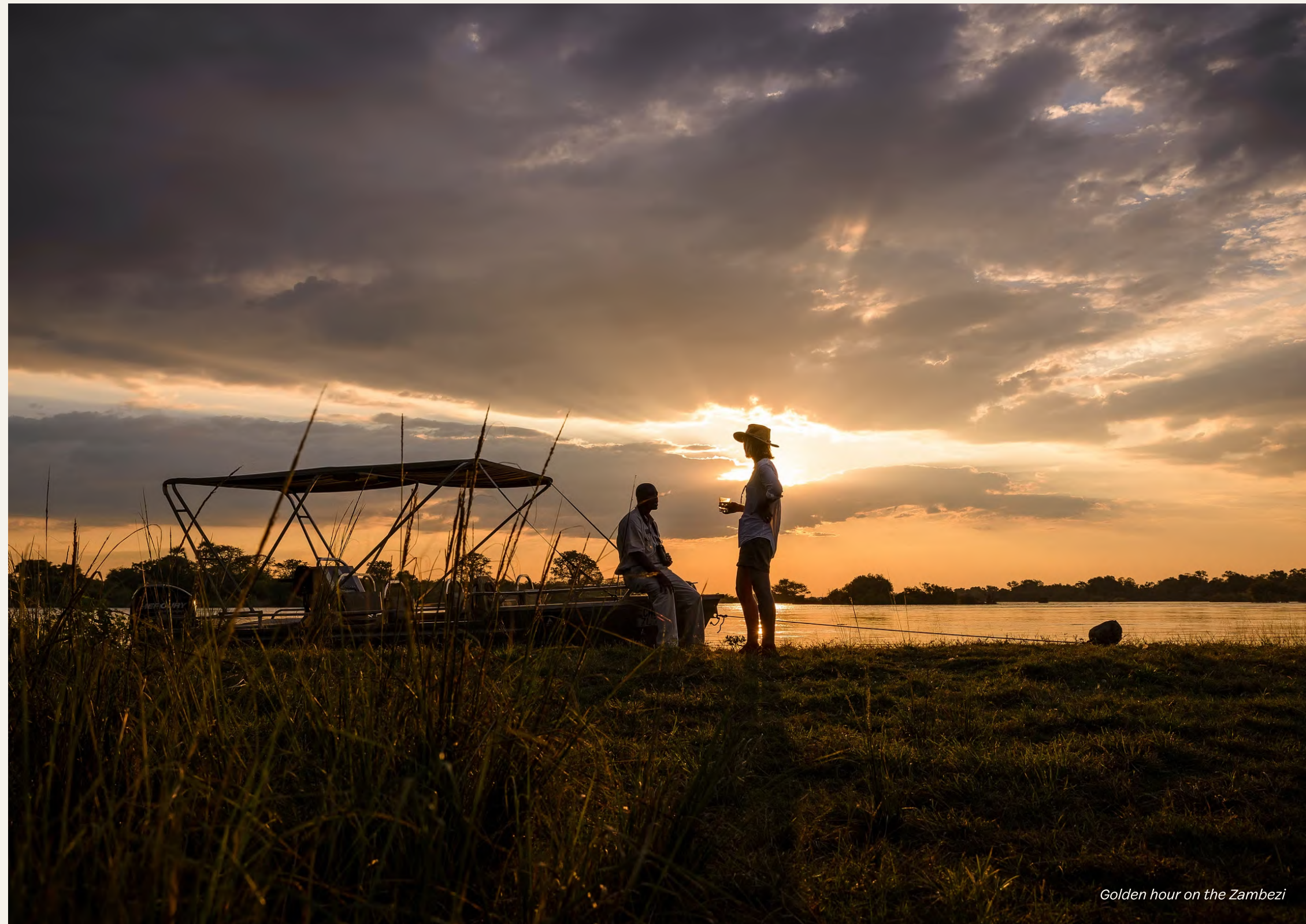
Golden hour on the Zambezi

Days at Sussi & Chuma Lodge deliver pulse-quickening adventure as well as serene moments to simply soak up the incredible nature all around. The lodge's expert team of guides and support staff cleverly choreograph every detail – from action-packed morning game drives to sundowner cruises on the Zambezi.