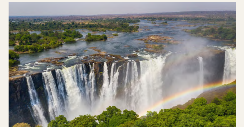
Wild rides await when white-water rafting

The extraordinary magnitude of Victoria Falls comes into perspective on a scenic helicopter flight above the tumbling water. Also look out for the area’s rich wildlife – from grazing zebras to lurking crocodiles. Note that this activity is available at an additional cost.