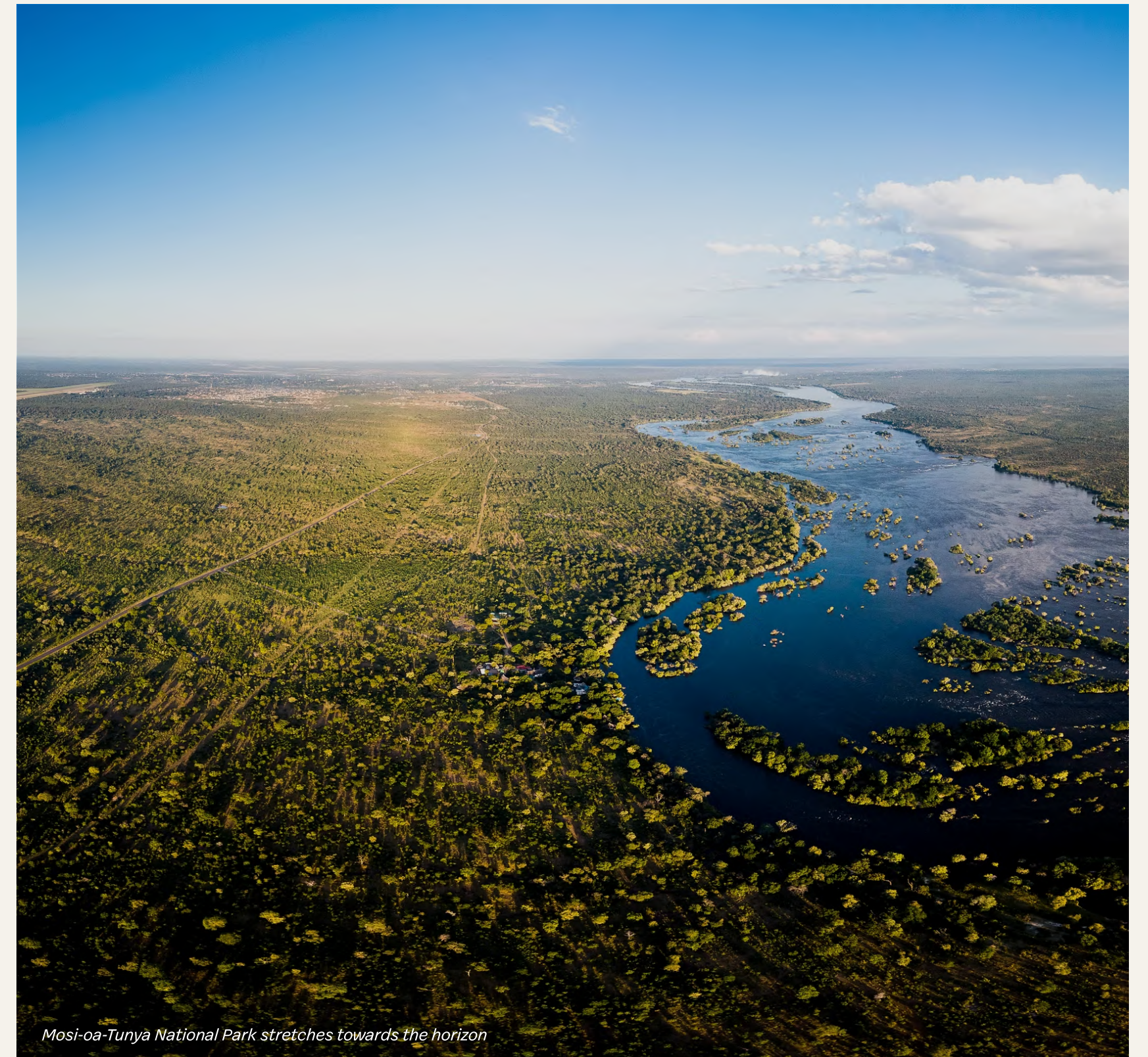
Mosi-oa-Tunya National Park stretches towards the horizon