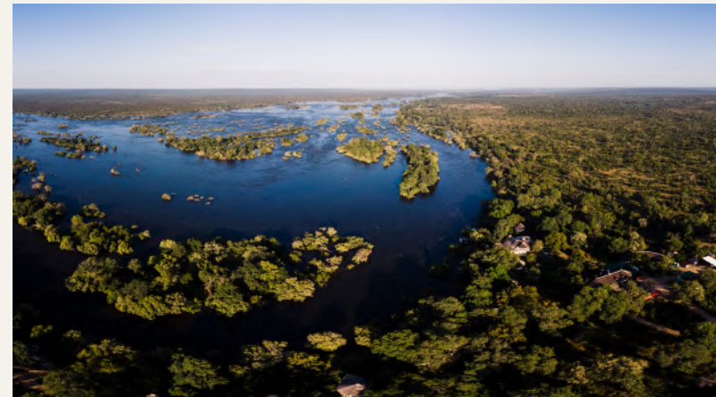
Water levels change with the seasons

The low crowds of February make it the best time to view the falls – though rainbows, and moonbows, are more common in March. The early months of the year are also a great time to spot the national park's thriving birdlife, with the presence of European migratory birds and many species in their colorful breeding plumage.