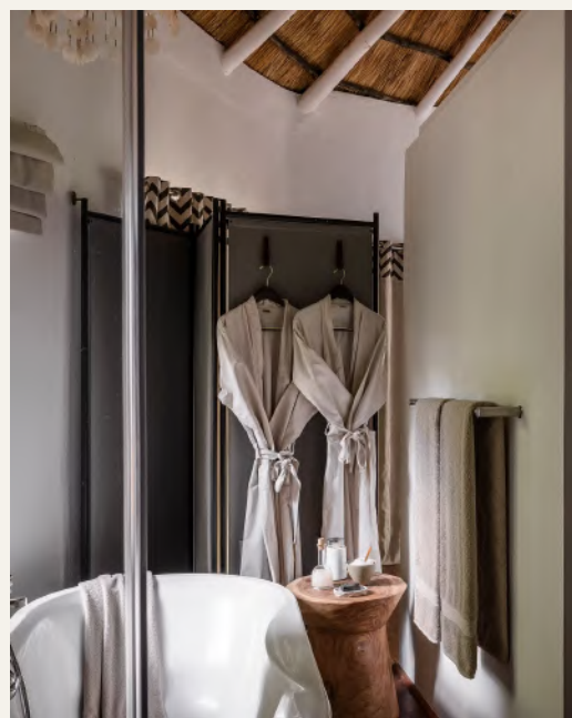
A deep bathtub for soaking

"The elegant design and indulgent touches make this the most unique stay on the Zambezi."