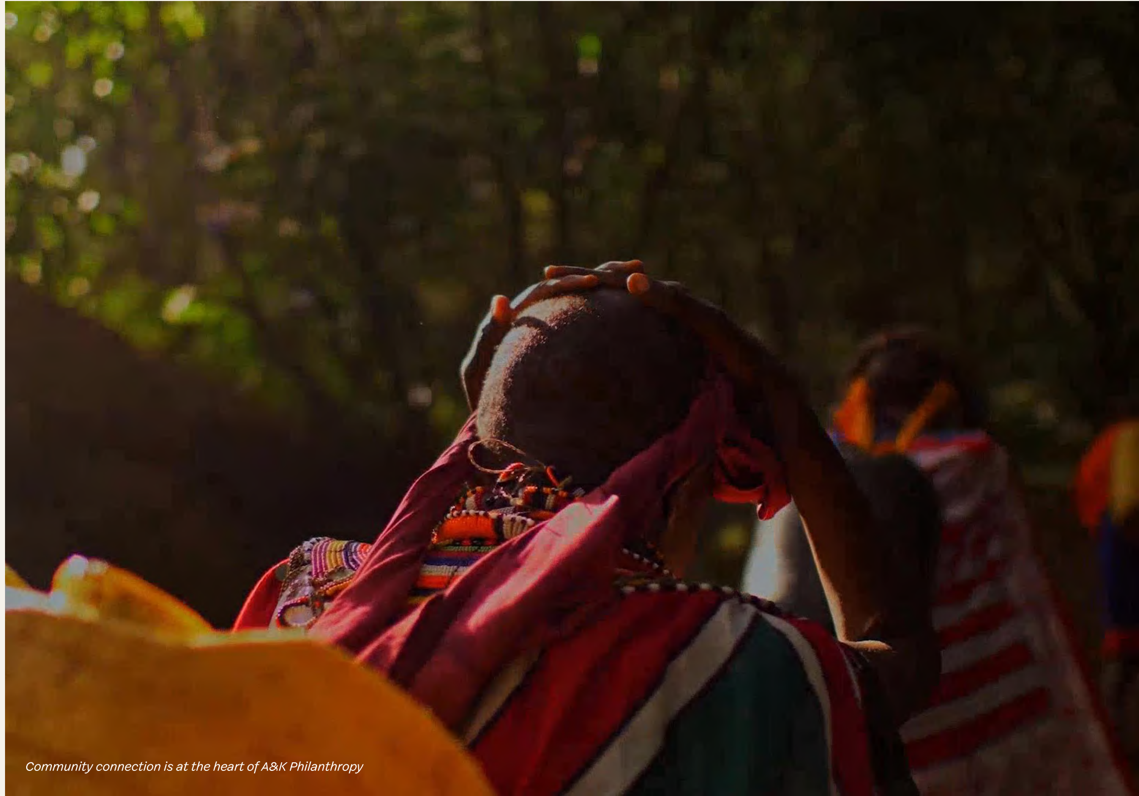
Community connection is at the heart of A&K Philanthropy