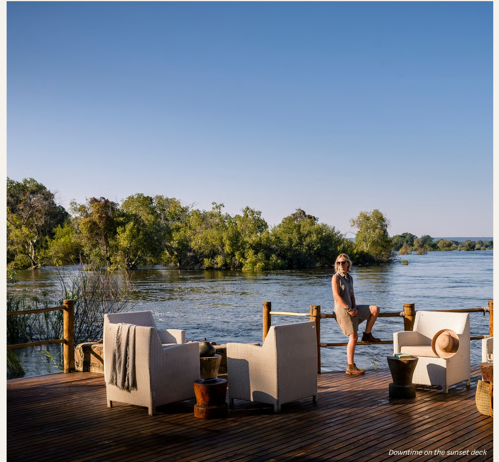
Downtime on the sunset deck