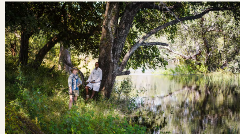
Zambia is known for its thrilling walking safaris

In a small but agile motor launch, navigate a series of Grade 2 rapids – guided by highly skilled professionals – before finding the perfect spot to come ashore for a refreshing sunset cocktail.