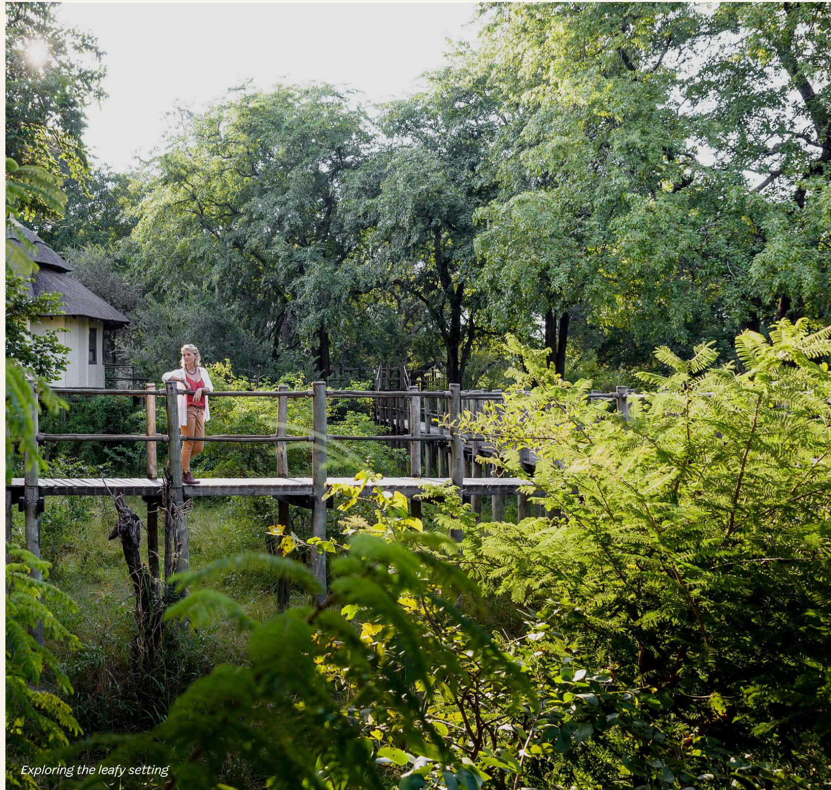
Exploring the leafy setting