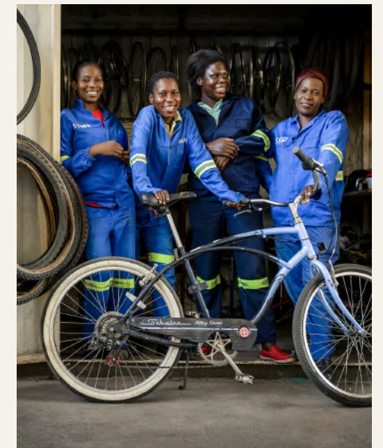
A&K Philanthropy supports Chipego Bike Shop

Established philanthropy project at Nakatindi Village including the school, bike shop, hospital and bead-making workshop.