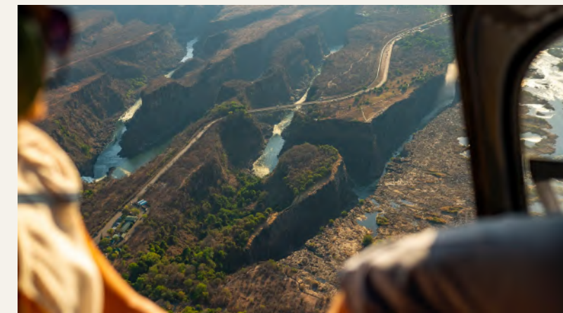
Get an eagle’s-eye view on a helicopter flight

The Zambezi offers a fantastic angling experience, and the team at Sussi & Chuma will be pleased to make the necessary arrangements. Fishing is strictly seasonal and conducted on a catch-and-release basis.