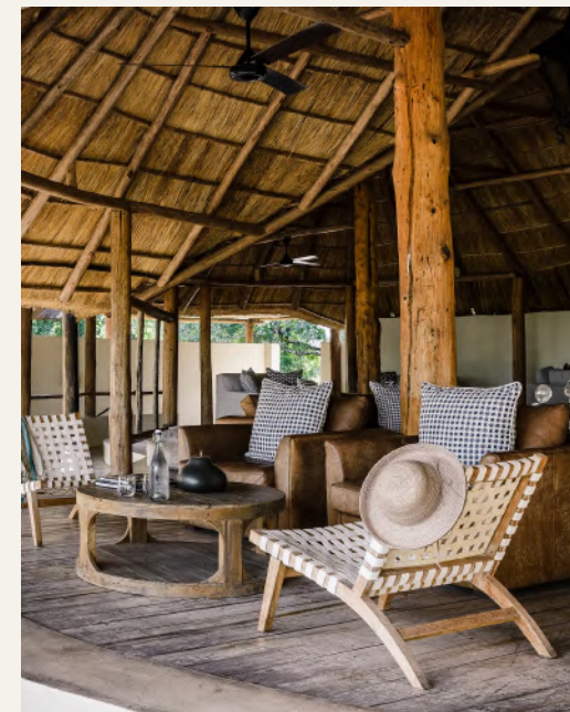
There are plenty of corners for relaxing

Numerous communal spaces for guests to enjoy, including a cozy lounge, dining area, bar and a striking swimming pool.