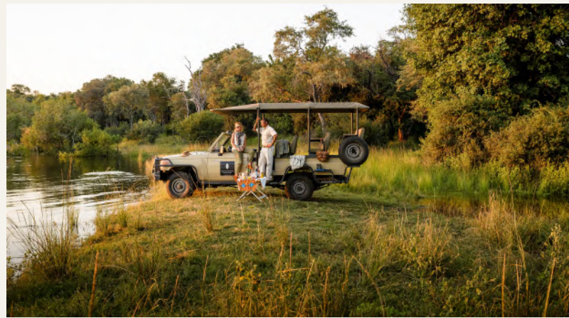
Expert guides know all the best corners

Guests are immersed in their wild setting on twice-daily game drives and on walking safaris – a particular Zambian speciality – in Mosi-oa-Tunya National Park (there's even a chance to track rhinos on foot). With the mighty Zambezi right outside there are many water-based activities on offer too: fishing, white-water rafting, sundowner cruises. Of course, a trip to Victoria Falls will be top of everyone's agenda, but there's also the option to soar above them – and spot hippos and crocs in the river far below – on a scenic helicopter flight. After all that activity, guests can regroup back at the lodge, where pampering spa treatments and cooling dips in the pool beckon.