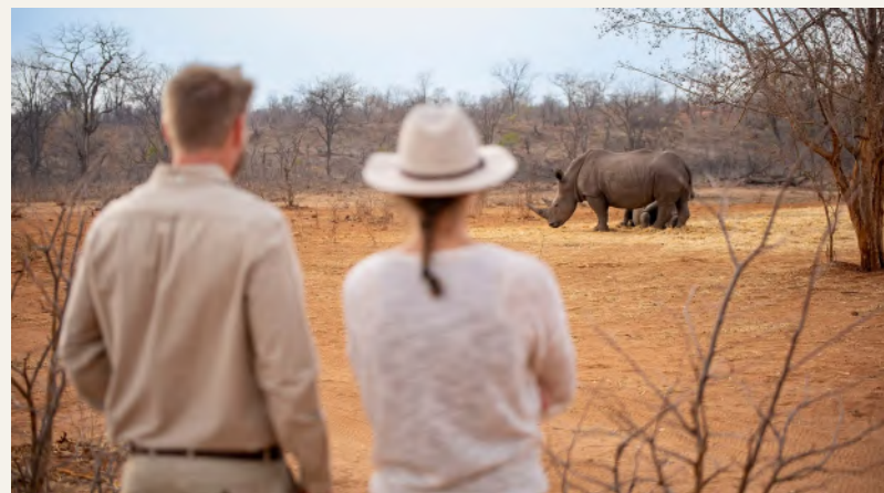
Track rhino on foot in Mosi-oa-Tunya National Park

Guests are immersed in their wild setting on twice-daily game drives and on walking safaris – a particular Zambian speciality – in Mosi-oa-Tunya National Park (there’s even a chance to track rhinos on foot). With the mighty Zambezi right outside there are many water-based activities on offer too: fishing, white-water rafting, sundowner cruises. Of course, a trip to Victoria Falls will be top of everyone’s agenda, but there’s also the option to soar above them – and spot hippos and crocs in the river far below – on a scenic helicopter flight. After all that activity, guests can regroup back at the lodge, where pampering spa treatments and cooling dips in the pool beckon.