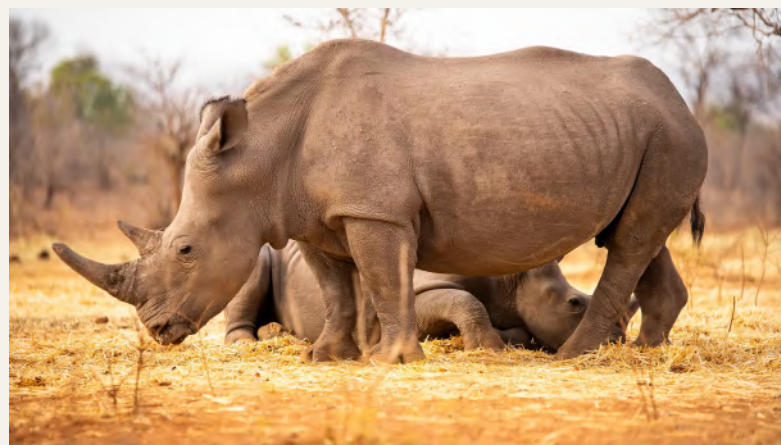
Endangered white rhino call the park home

Mosi-oa-Tunya National Park holds Zambia's entire population of endangered white rhino, and encountering these mighty creatures is a highlight. Guests may also be lucky enough to experience a rare sighting of the wild dogs that on occasion pass through the park.