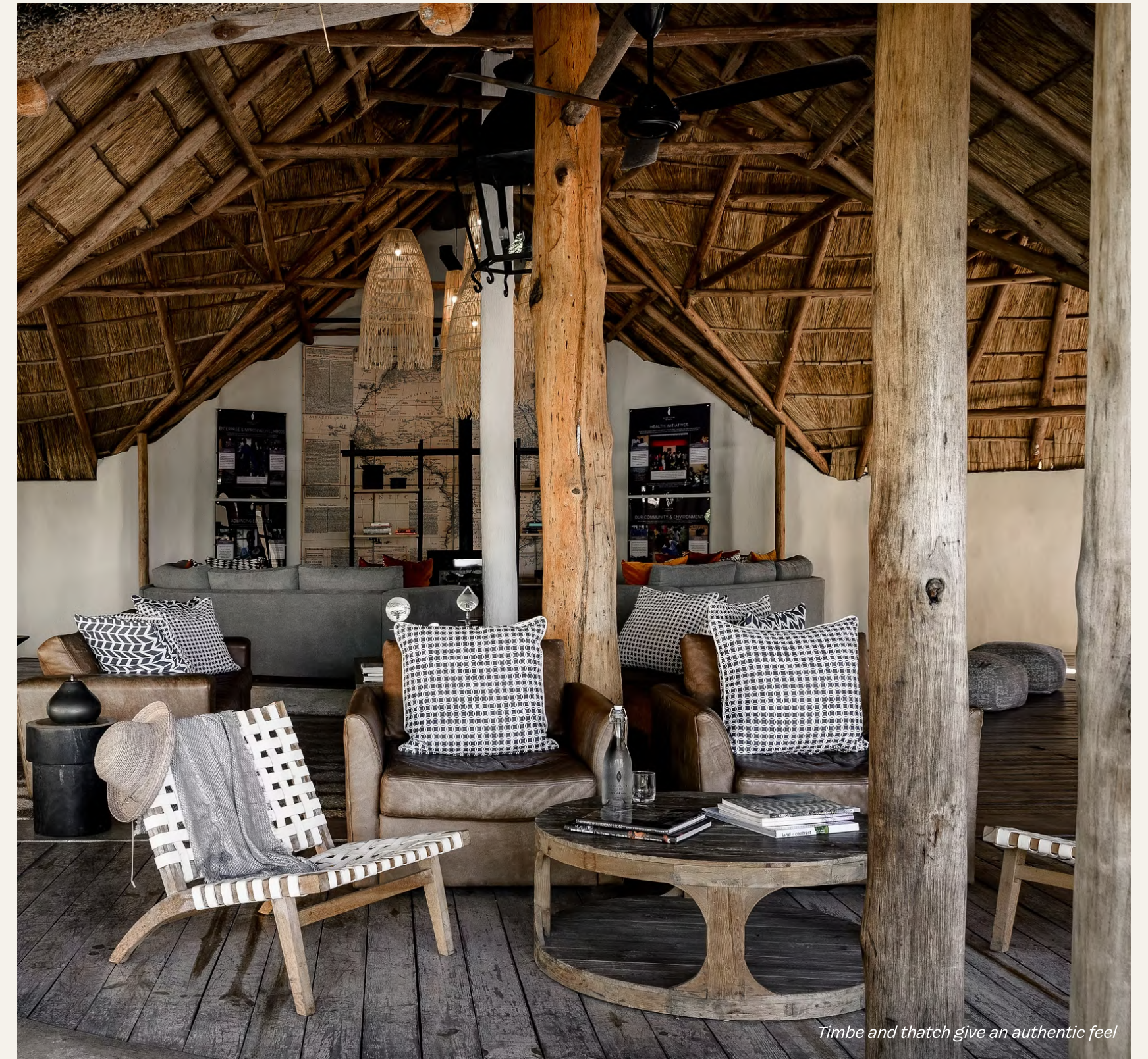
Timbe and thatch give an authentic feel

"Big kids and little kids alike will love the lodge's treehouses, set above the rushing Zambezi."