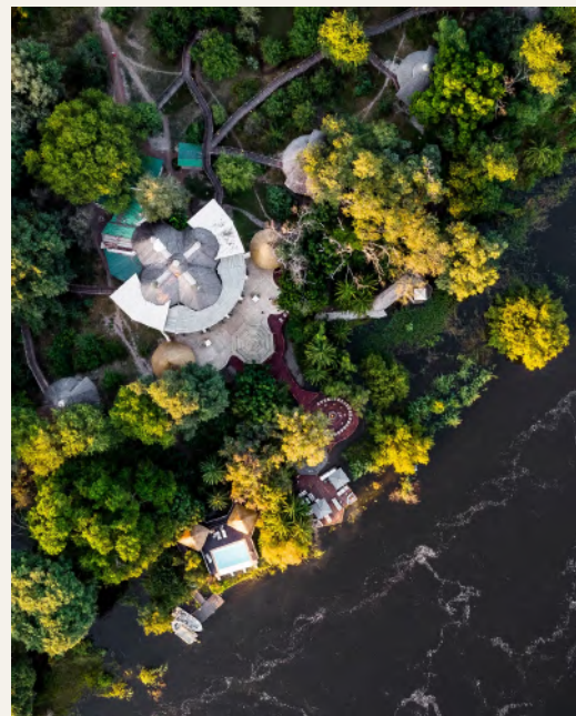
The lodge's impressive riverfront location

Just seven miles upstream from Victoria Falls on a quiet bend of the Zambezi River away from the crowds.