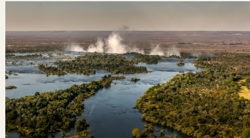
This is the time for white-water rafting

Victoria Falls is at its fullest, and rainbows remain common. June is the start of the dry season with water levels beginning to drop at the falls, meaning rock formations can be seen more easily – as can elephants, which cross the Zambezi to Zimbabwe at this time.