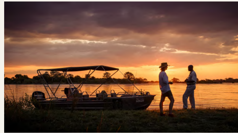
Take a motor boat to the perfect sunset spot

Set off in the early morning and late afternoon with Sussi & Chuma's expert guides deep into the Mosi-oa-Tunya National Park, where the rich diversity of wildlife includes antelopes, zebras, giraffes, elephants, warthogs and a cacophony of birds.