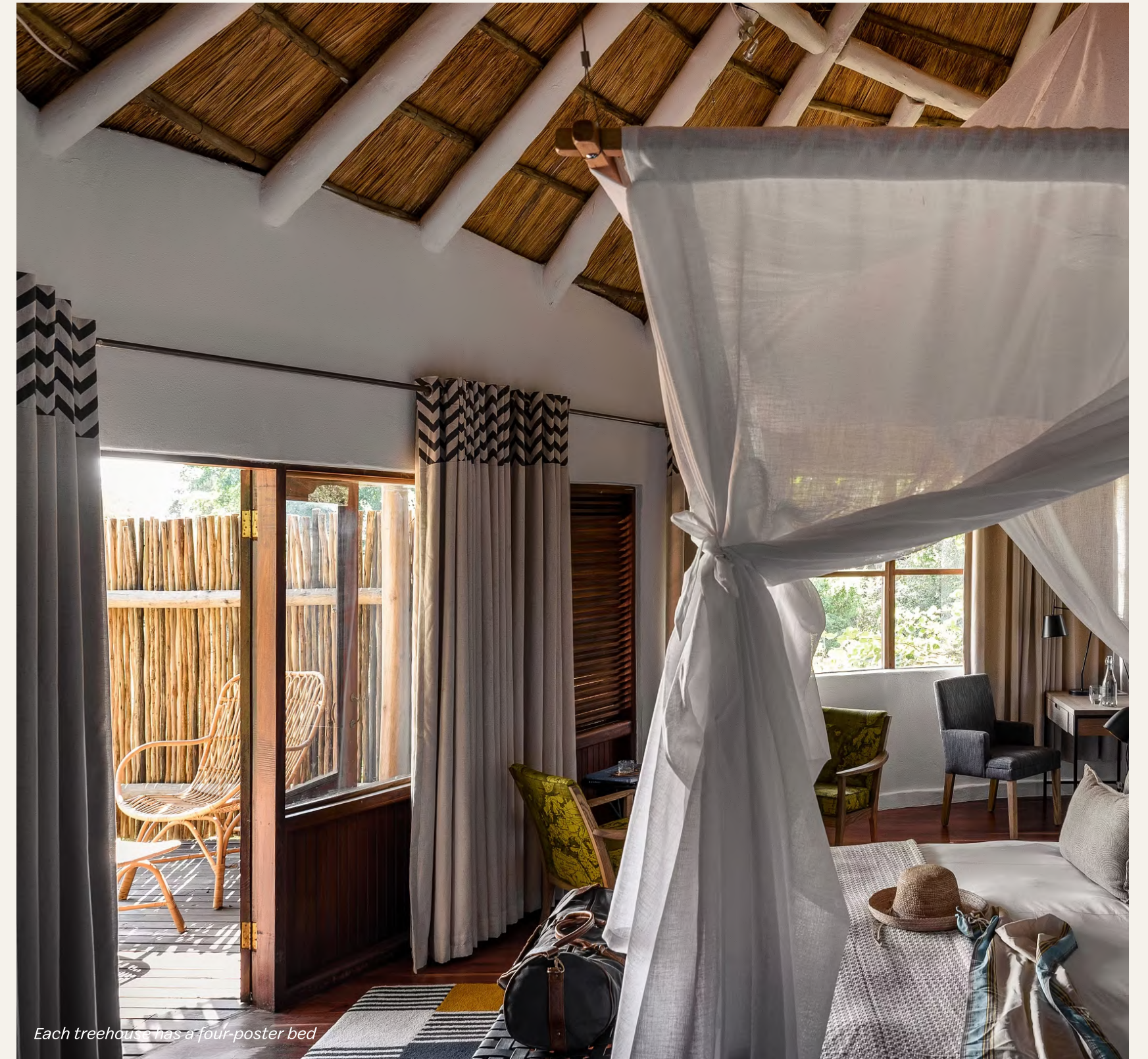
Each treehouse has a four-poster bed

"The elegant design and indulgent touches make this the most unique stay on the Zambezi."