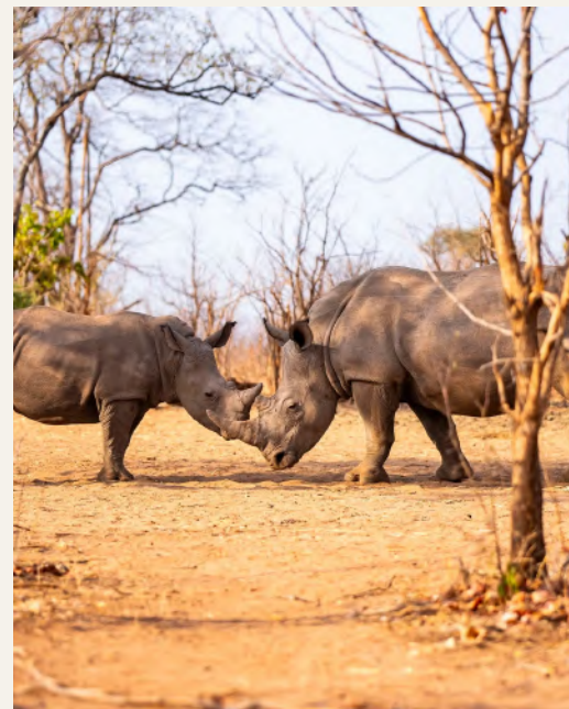
An unforgettable rhino encounter

Animals to spot in Mosi-oa-Tunya National Park include impalas, zebras, giraffes, hippos, wildebeest, crocodiles, elephants, buffalo and rhinos.