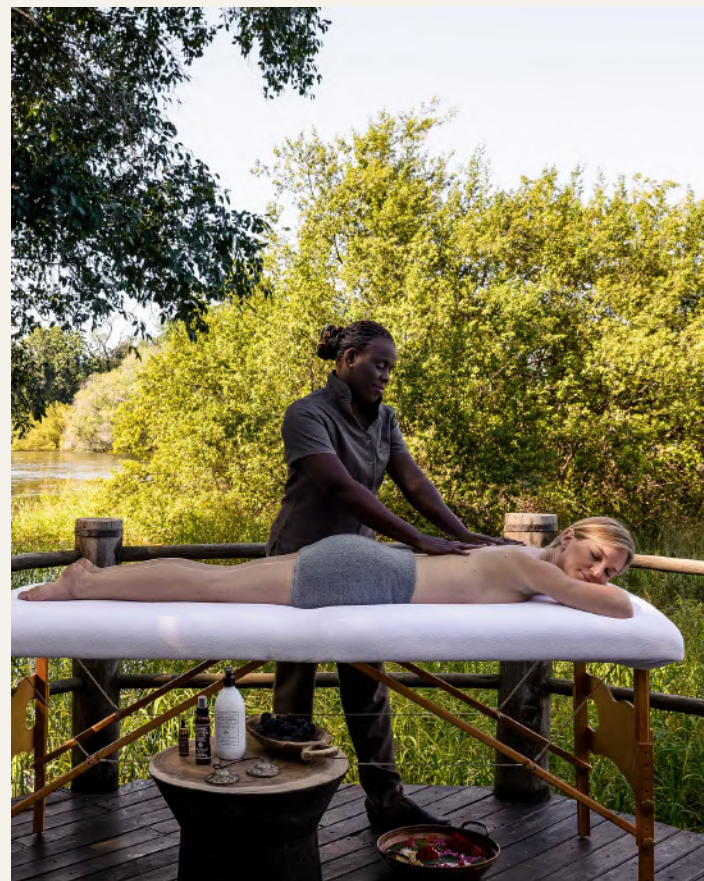
Enjoy an outdoor spa treatment