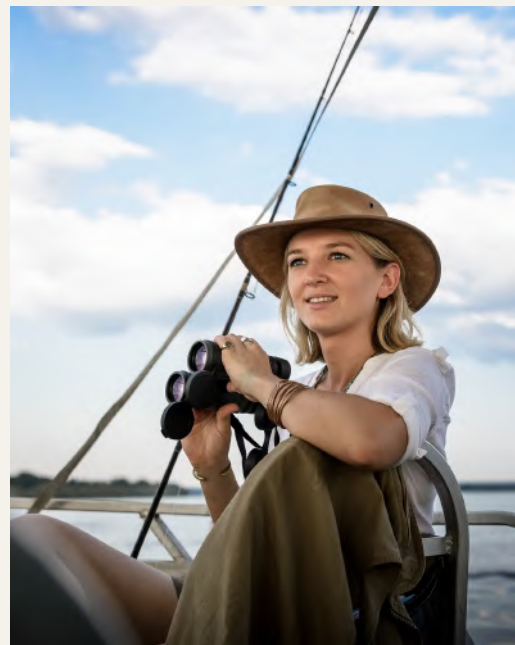
Binoculars at the ready for wildlife

The only lodge in the area offering guided walking safaris, plus you can go fishing or rafting, and enjoy a sundowner cruise on the river.