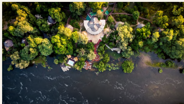
The lodge is on a quiet river bend

On the doorstep of all this drama, Sussi & Chuma Lodge is seven miles upriver from Victoria Falls, in a blissfully peaceful spot on a bend in the Zambezi within Mosi-oa-Tunya National Park, surrounded by leafy jackalberry trees and majestic phoenix palms. Although it's one of the smallest national parks in Zambia, it packs quite a punch for flora and fauna, and is home to an abundance of antelopes, zebras, giraffes, elephants, warthogs and a variety of birds. Since there are no predators, wildlife here is very relaxed, making for amazing photo opportunities.