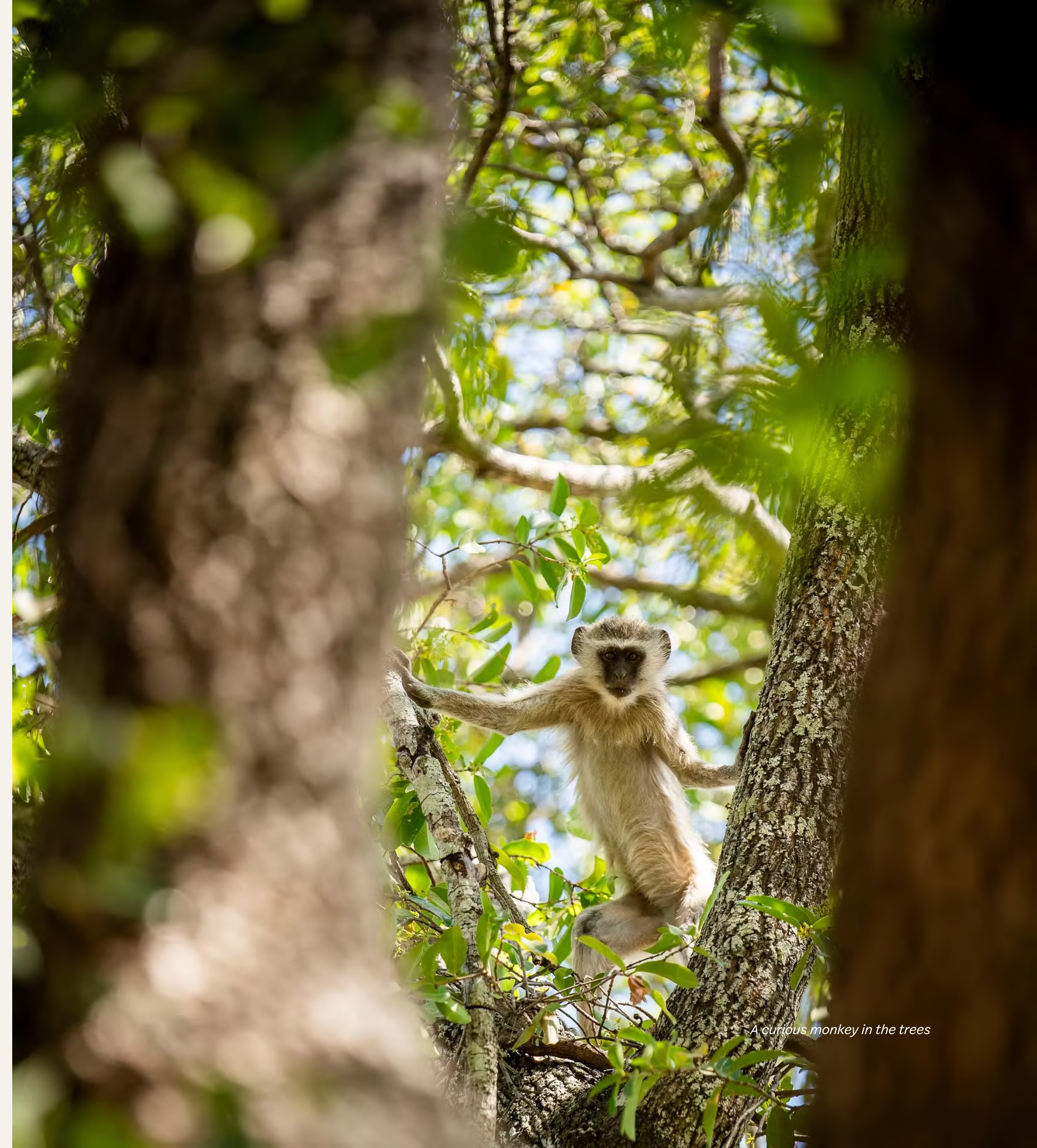
A curious monkey in the trees