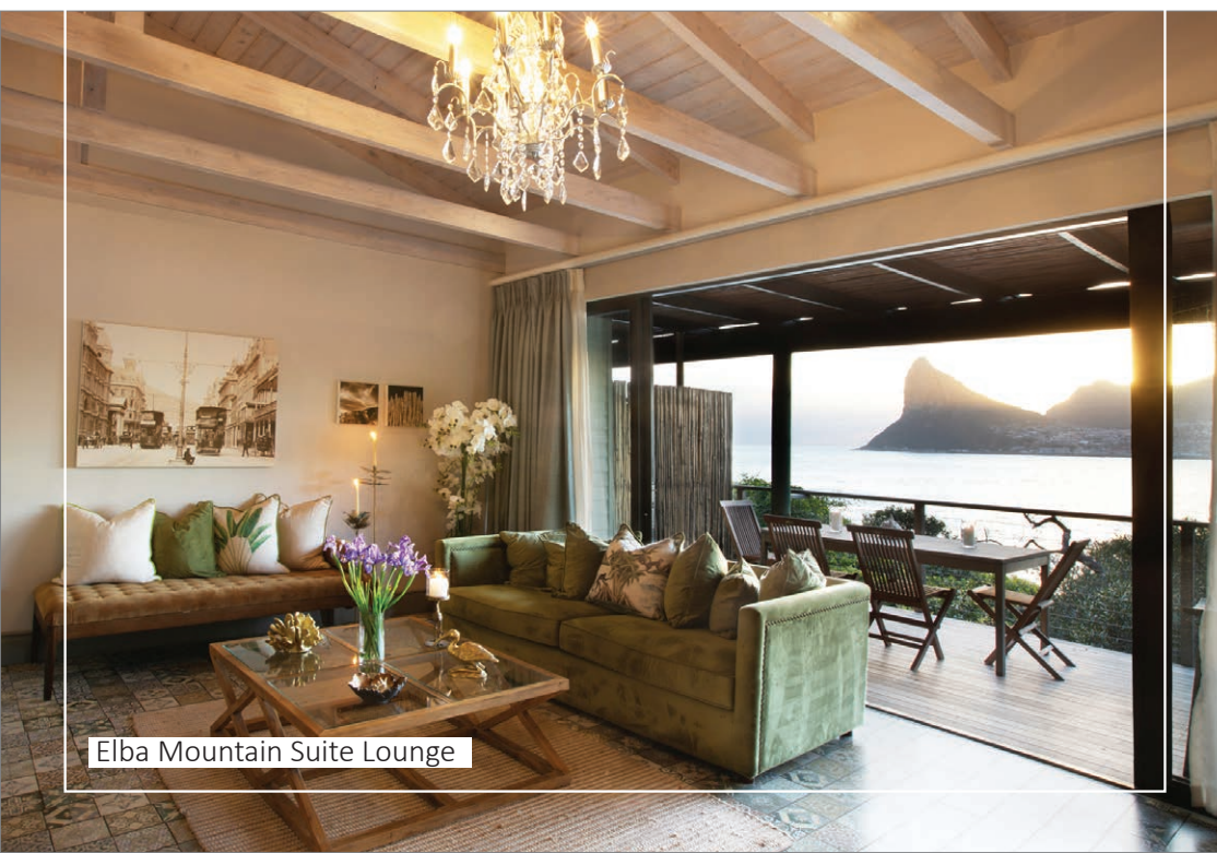
Elba Mountain Suite Lounge