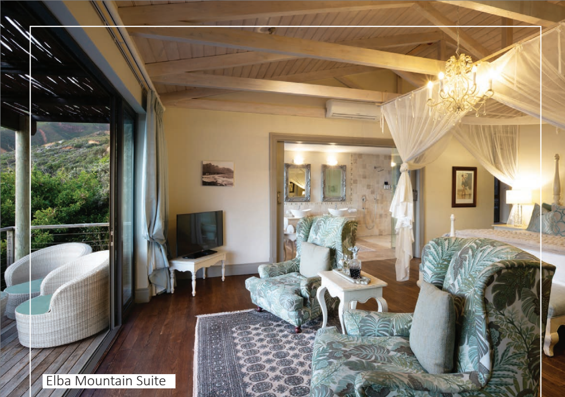
Elba Mountain Suite