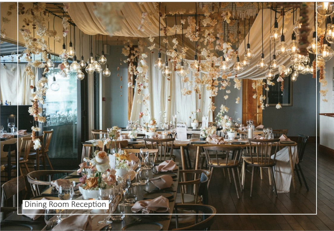
Dining Room Reception