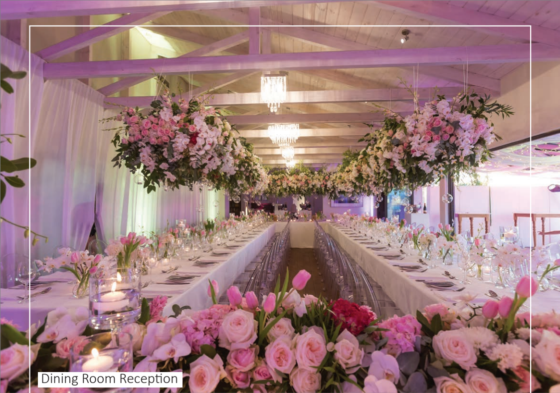
Dining Room Reception