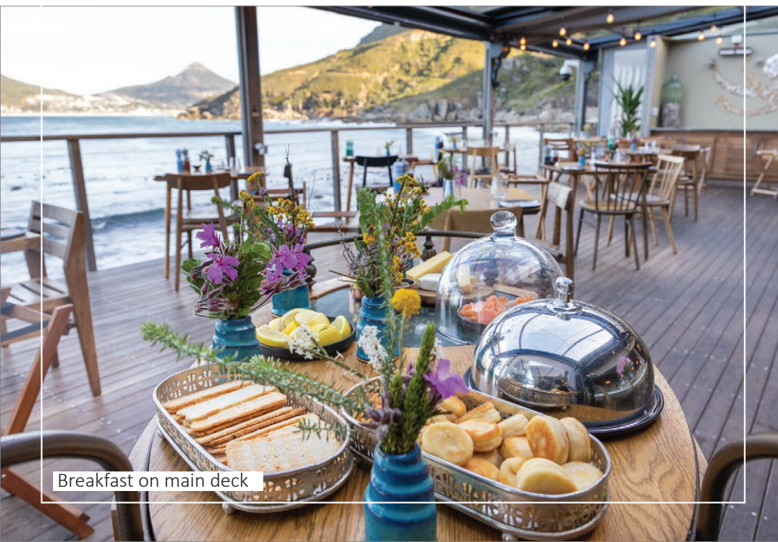
Breakfast on main deck

* Due to the popularity of Tintswalo Atlantic as a wedding venue and long waiting list, the cancellation policy will be strictly adhered to by Management and the Owners of Tintswalo.