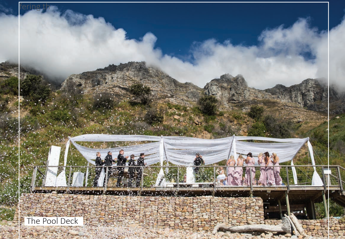
The Pool Deck