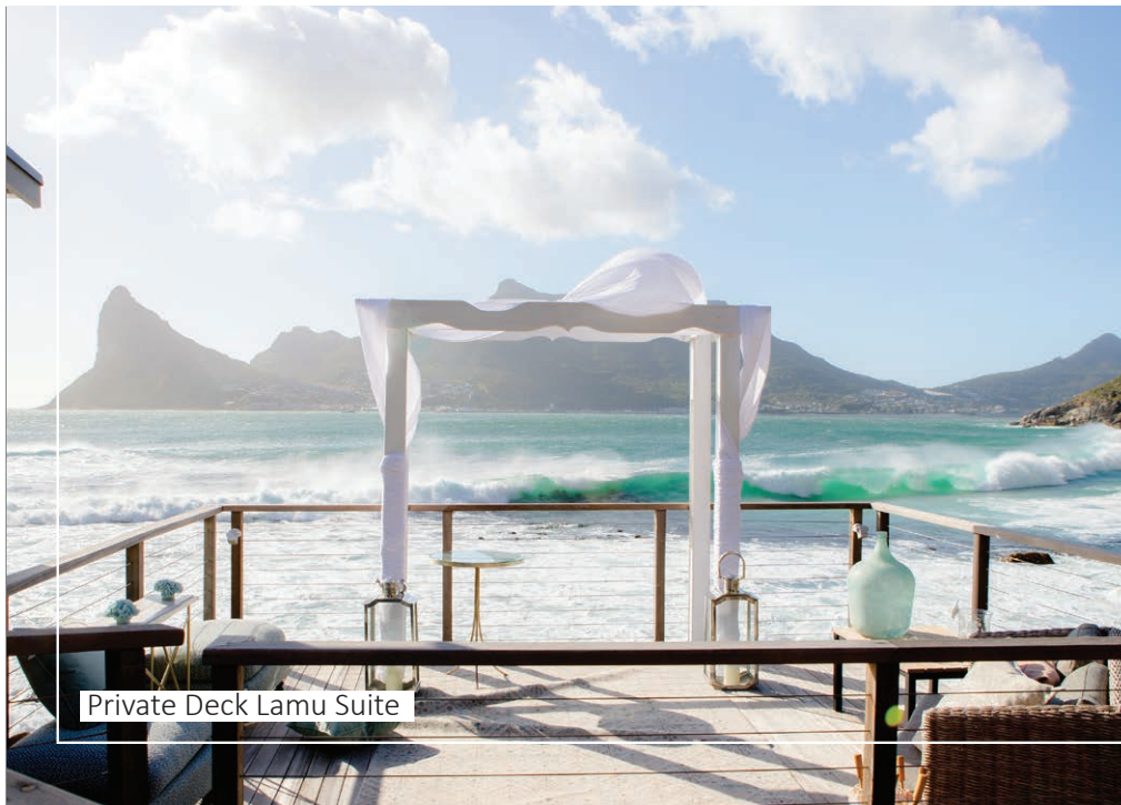
Private Deck Lamu Suite