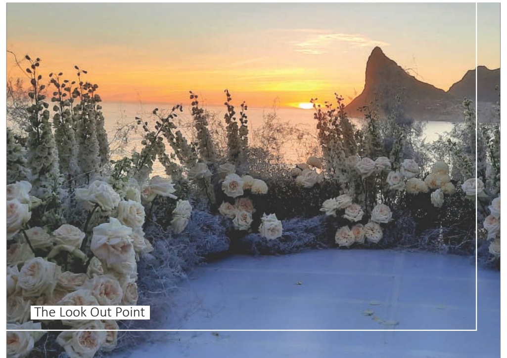
The Look Out Point