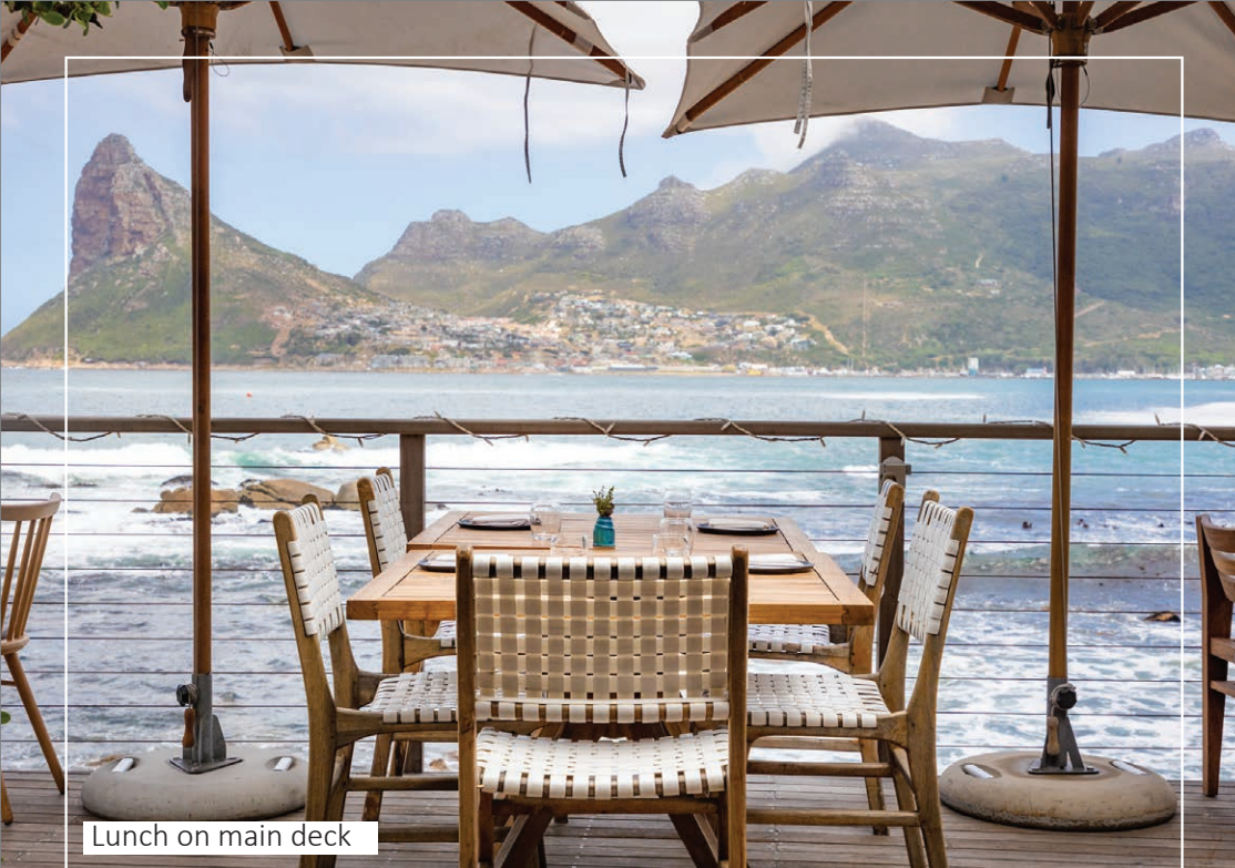
Lunch on main deck