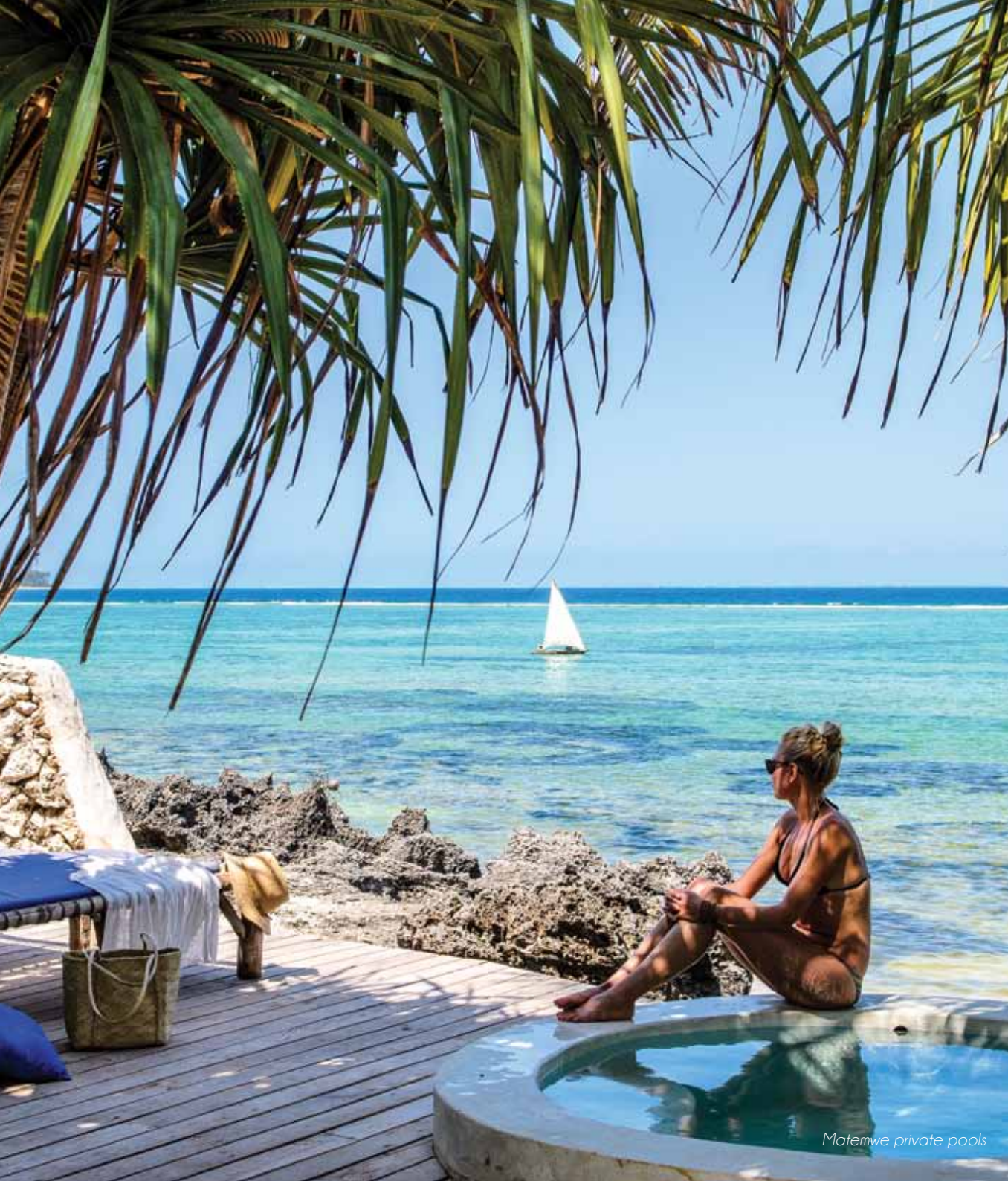
Matemwe private pools