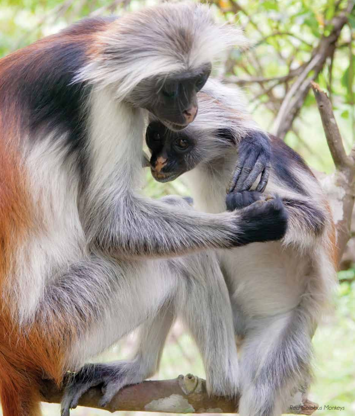
Red Colobus Monkeys