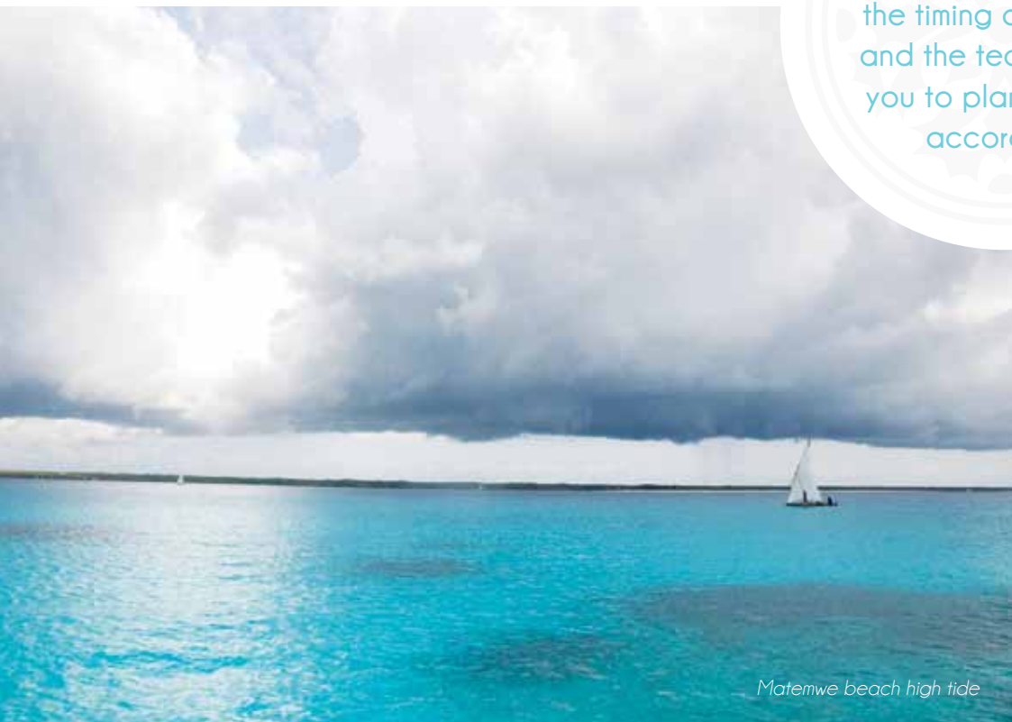
Matemwe beach high tide

Please be advised that during the Kuzi monsoon period from April to August, Zanzibar experiences stronger than normal winds and Matemwe receives seaweed deposits on the beach. We do not remove the sea-weed deposits from the beach because they are key to preventing the erosion of our beautiful sand beach. However, there is always a comfy sun lounger and white sand for you to sink your toes into and our water-based activities are largely uninterrupted.