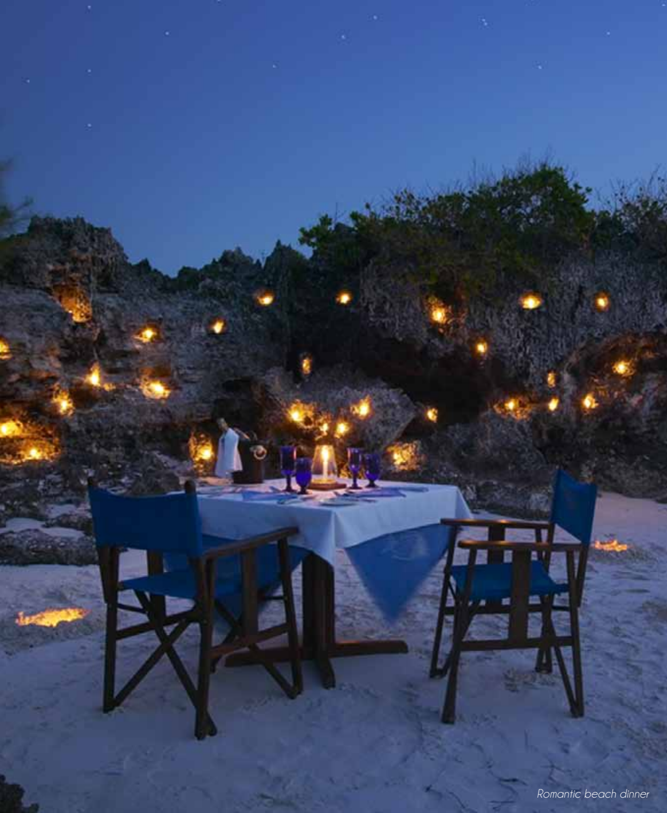
Romantic beach dinner