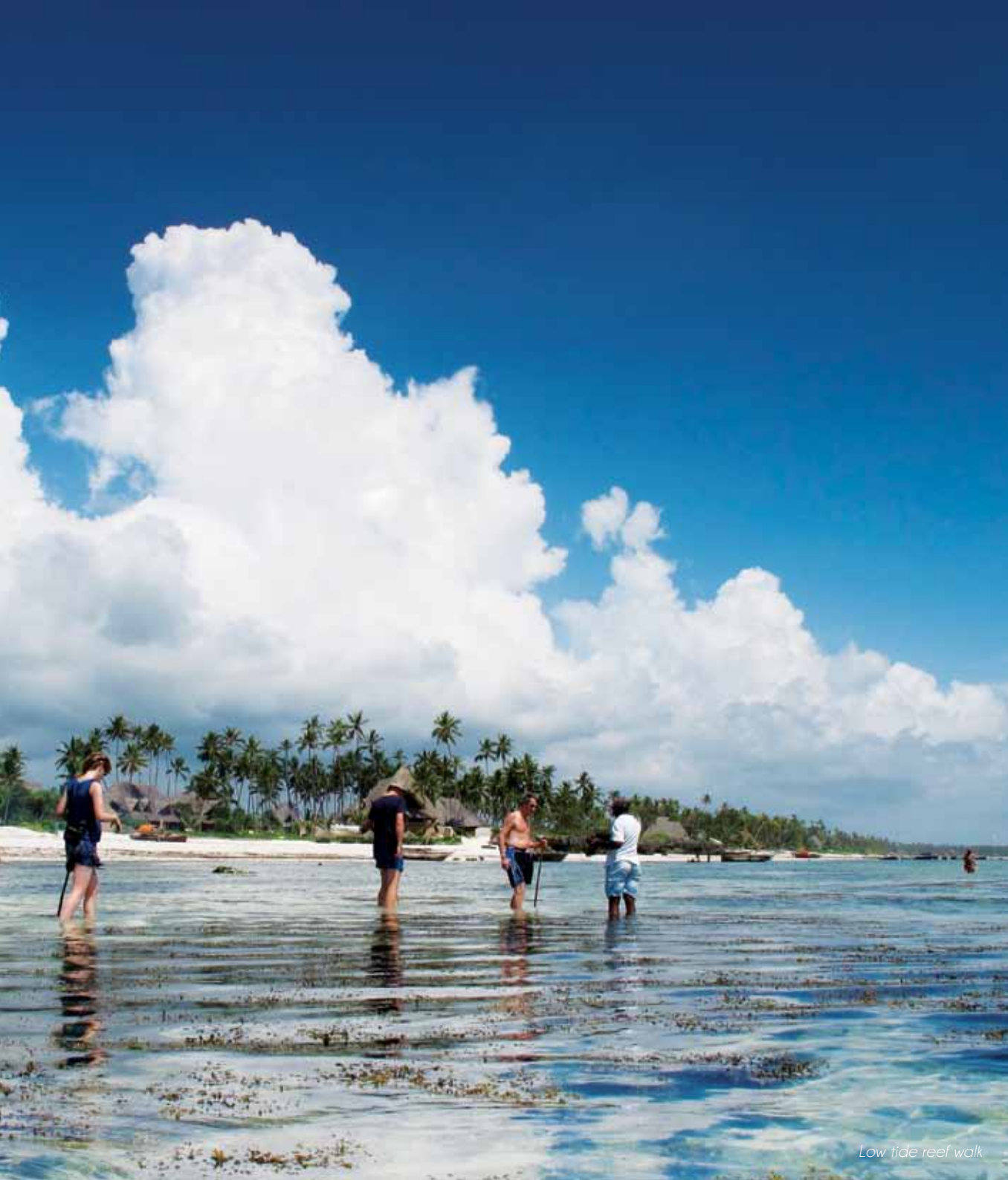
Low tide reef walk