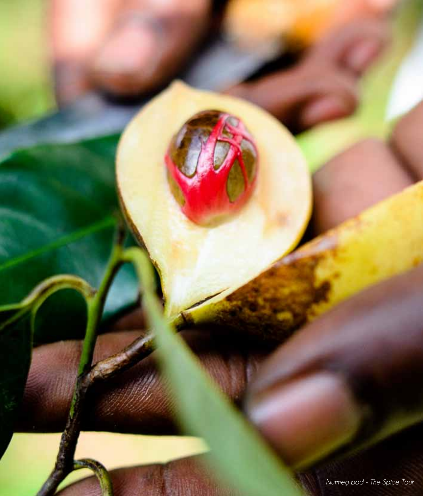
Nutmeg pod - The Spice Tour