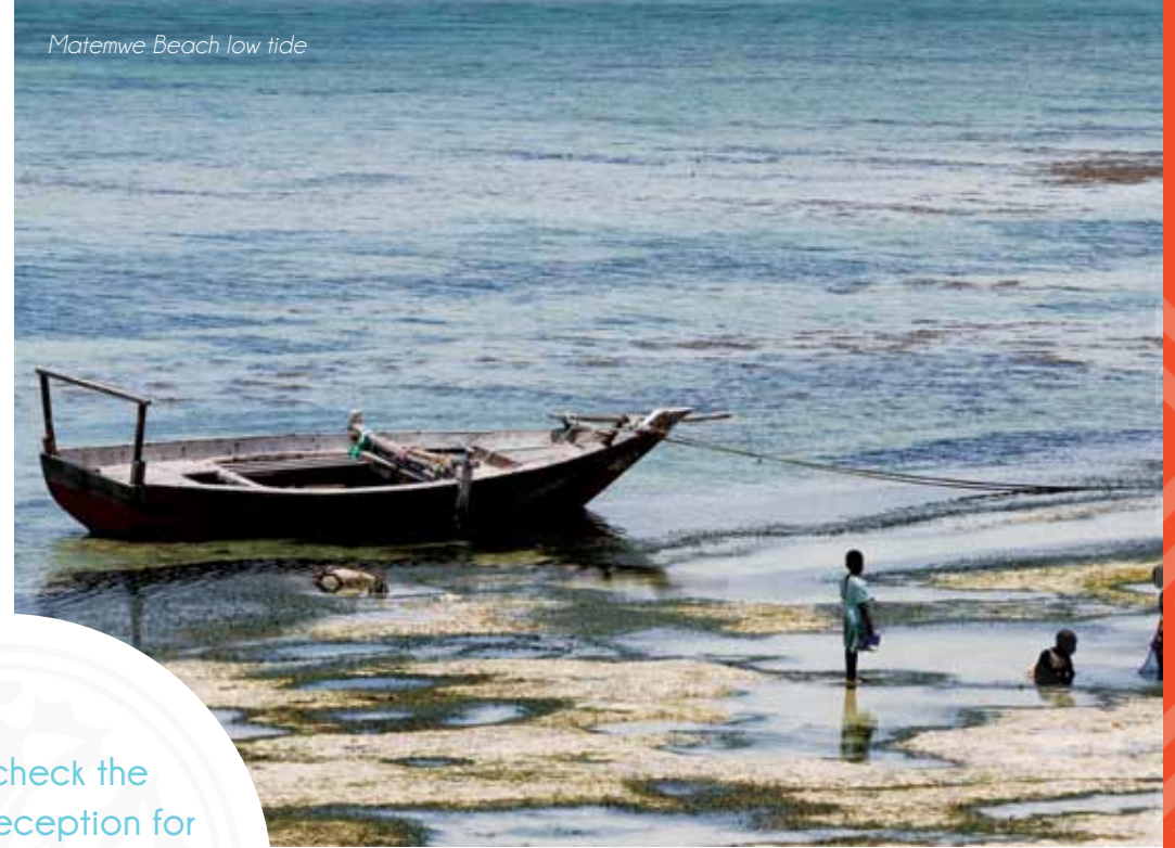
Matemwe Beach low tide

Please be advised that during the Kuzi monsoon period from April to August, Zanzibar experiences stronger than normal winds and Matemwe receives seaweed deposits on the beach. We do not remove the sea-weed deposits from the beach because they are key to preventing the erosion of our beautiful sand beach. However, there is always a comfy sun lounger and white sand for you to sink your toes into and our water-based activities are largely uninterrupted.