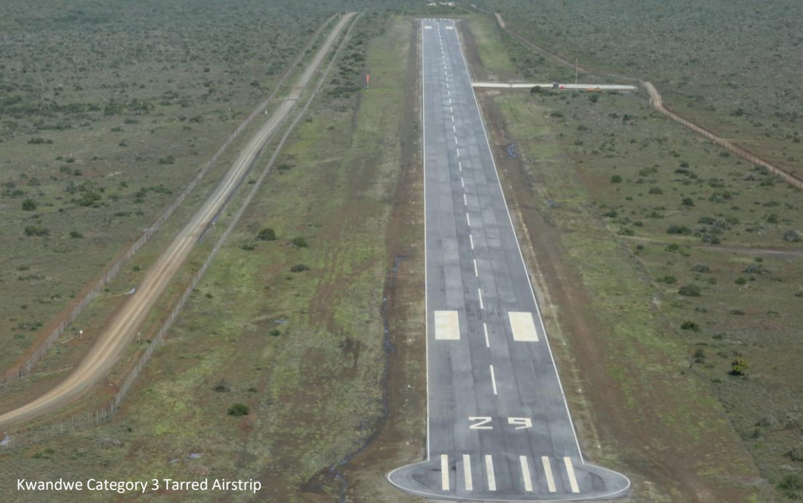
Kwandwe Category 3 Tarrred Airstrip