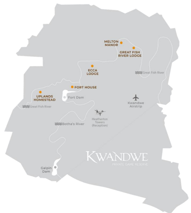
MAP OF KWANDWE PRIVATE GAME RESERVE