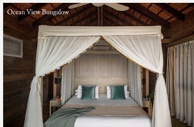
Ocean View Bungalow