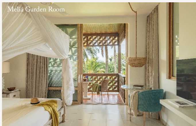
Meliá Garden Room