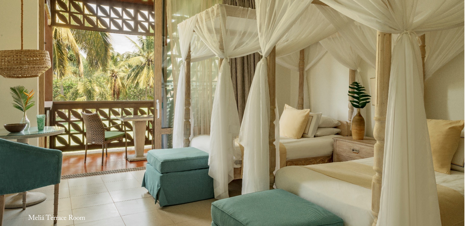
Meliá Terrace Room