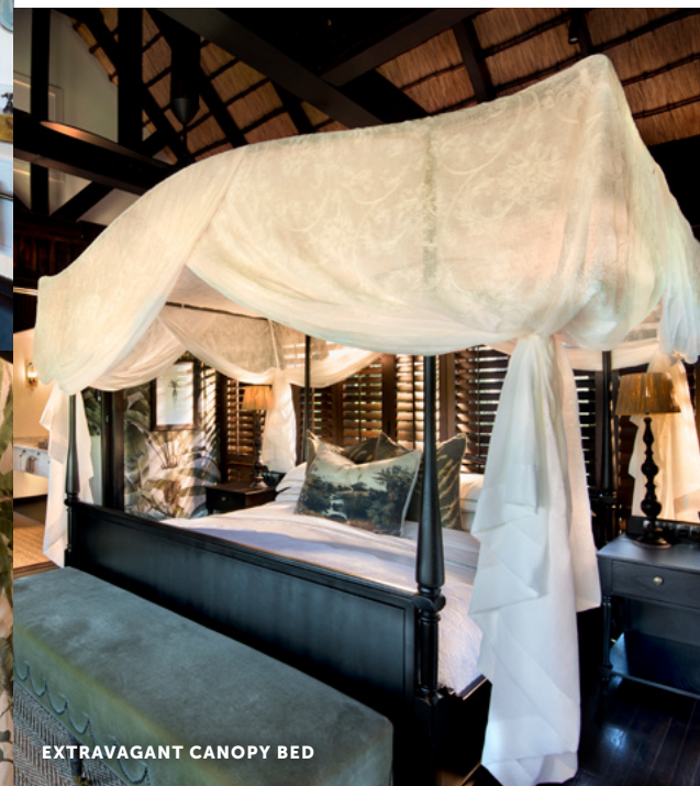
EXTRAVAGANT CANOPY BED