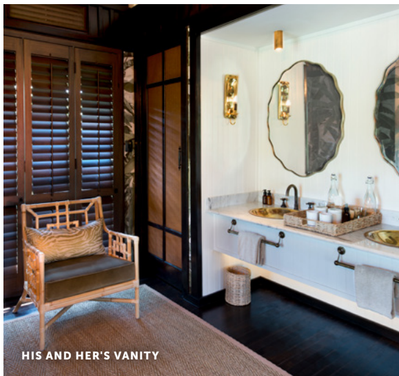
HIS AND HER'S VANITY

Set on the edge of a sand forest, and overlooking a vast grassy meadow, each of the six thatched Suites ensure exclusivity and incredible wildlife sightings.