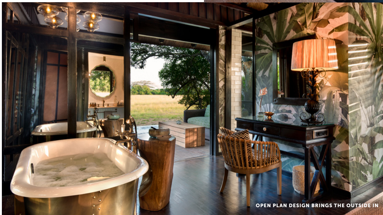
OPEN PLAN DESIGN BRINGS THE OUTSIDE IN