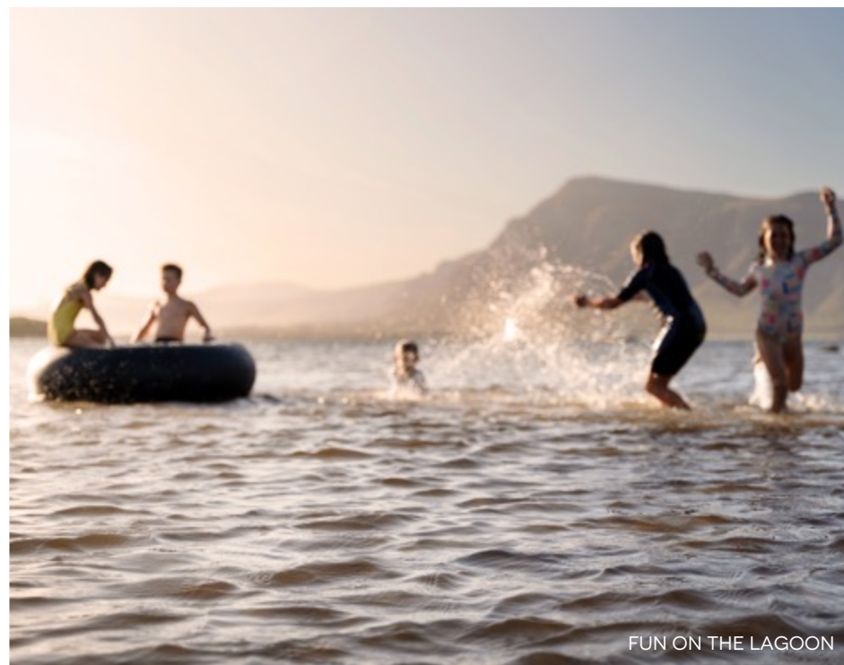
FUN ON THE LAGOON