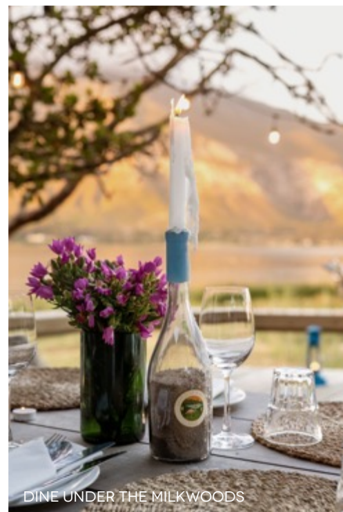
DINE UNDER THE MILKWOODS