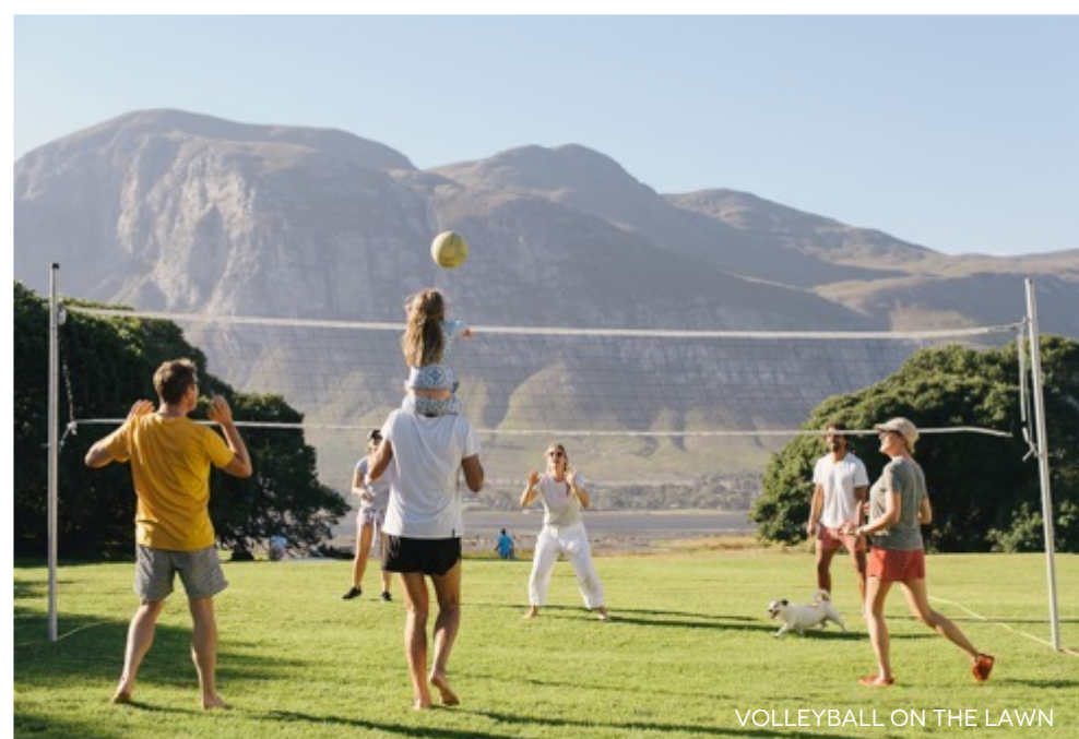
VOLLEYBALL ON THE LAWN